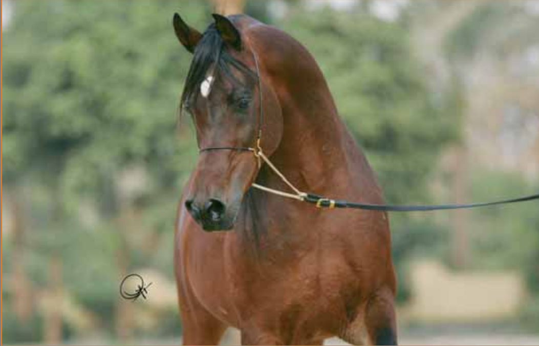
Ibn El Basha (El Basha Sqr. x Nawader)