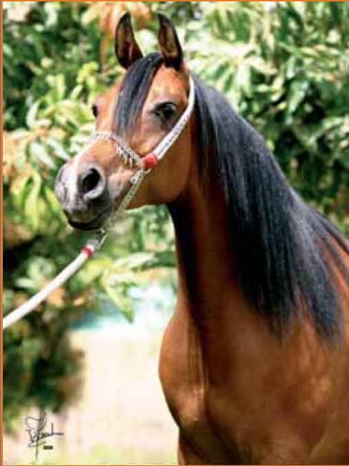
Nawwaret Hamdan (Imperial Madori x Dahimaara)