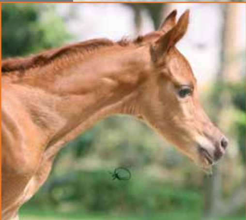
Filly (Taymour x G Ashalima)