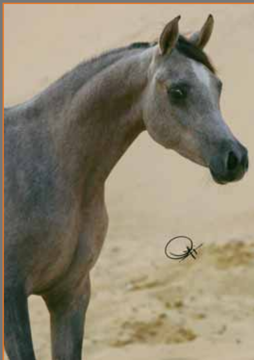
Anbar Noor (Ibn Arabia Sqr. x Hams El Kouloub)