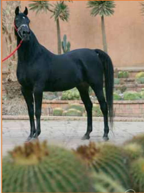
Nawader (Hafeed Anter x Dahimaara)

other bloodlines that shape the rest of the program. The original star mares are still strongly represented in today's horses. Kout El Kouloub was bred to Ibn Adaweya and together they produced Afrah, National Supreme Champion mare and the dam of Ghozlan '95 who is carrying on their special tradition. In 2002, the same pair produced Yakout RB, who even as a young stallion very clearly shows the same fine features of both his parents.