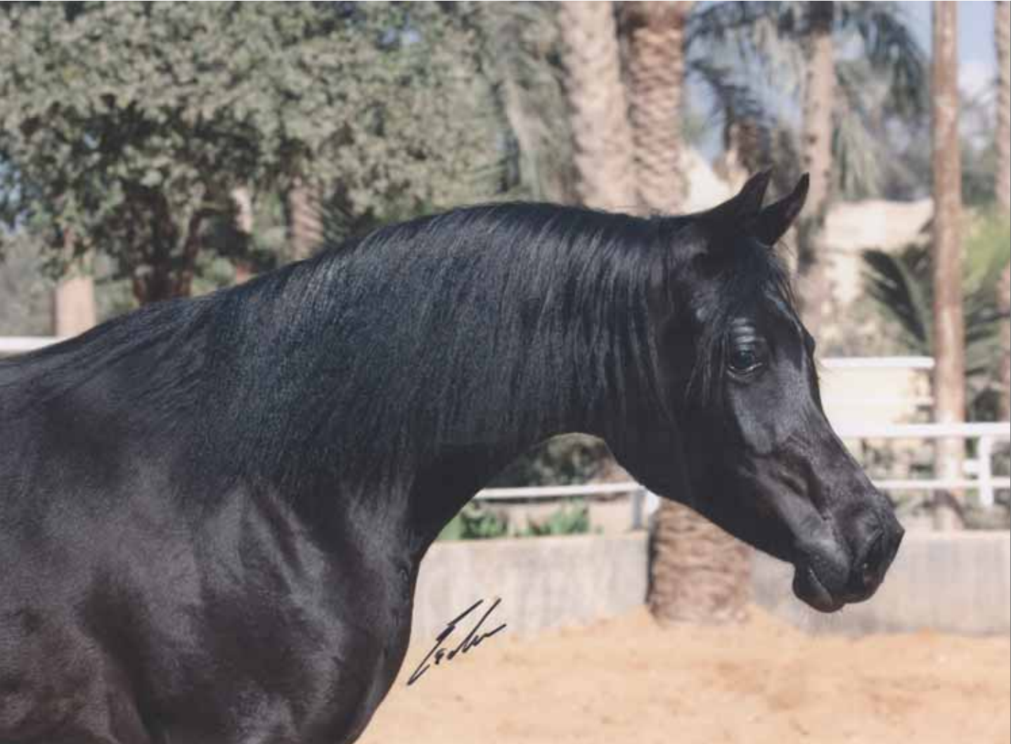
Layaly Al Najdiah – RB (Ibn El Basha x Nawwaret Hamdan)