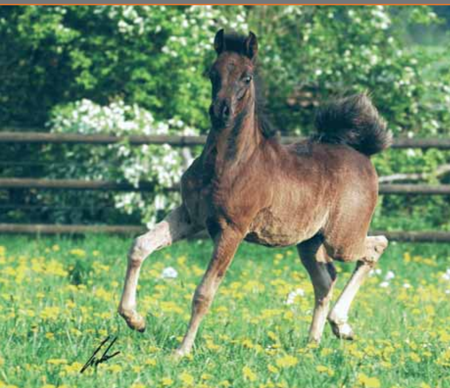
GR Maarif (GR Faleeh x Maria Halima)