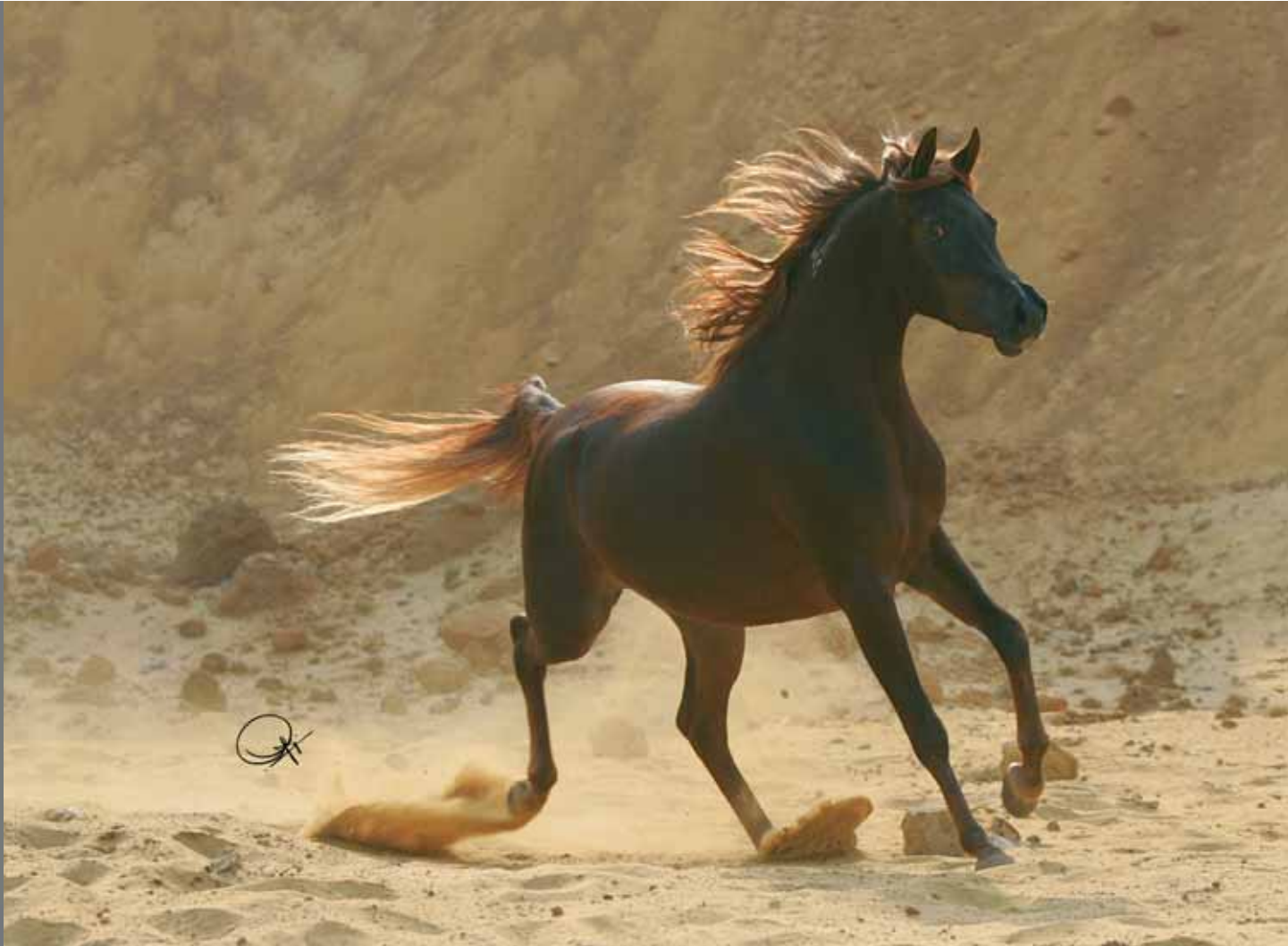
Kahramanah RB (Mogeer Ikh. x Alf Leila Wa Leila)