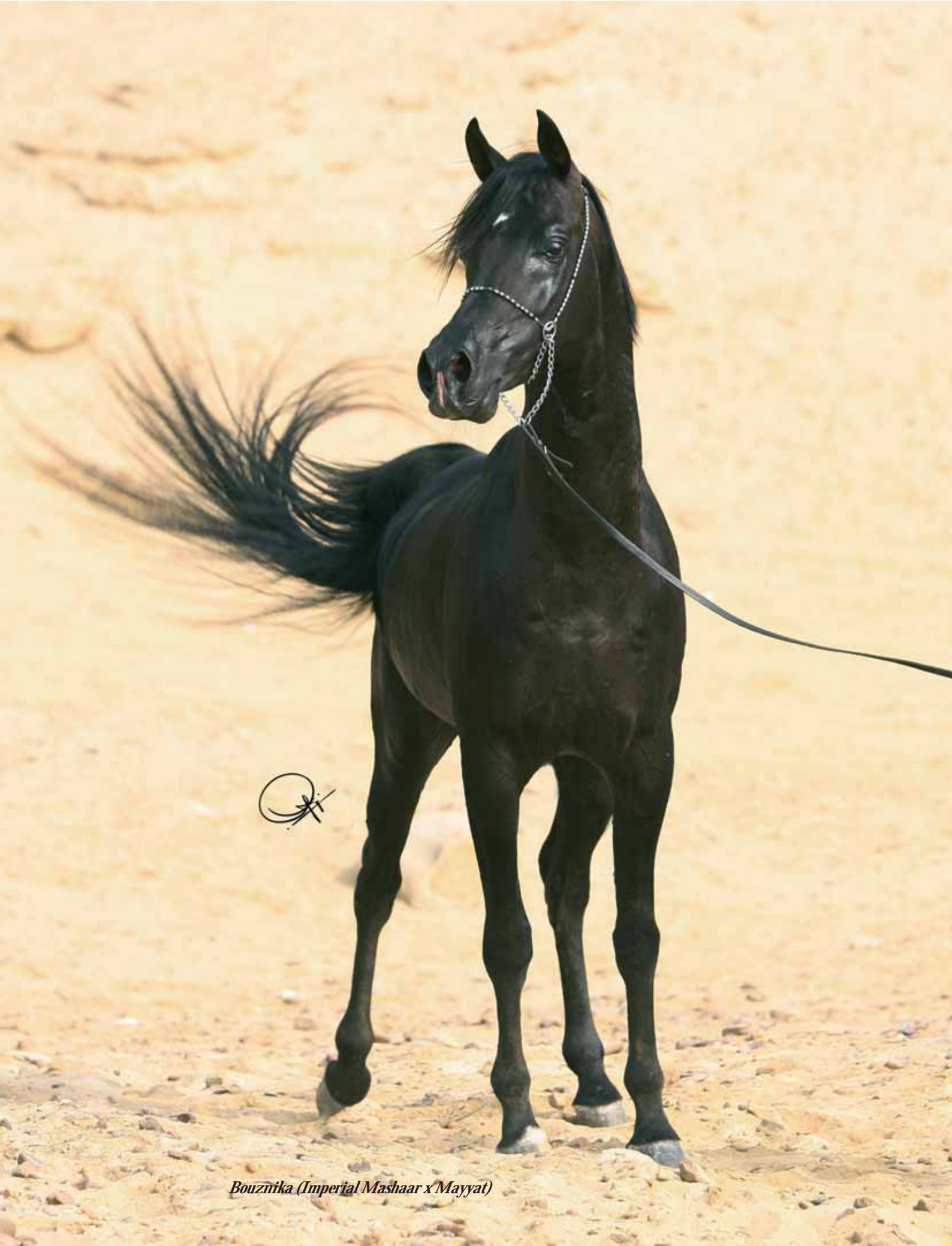
Bouznika (Imperial Mashaar x Mayyat)