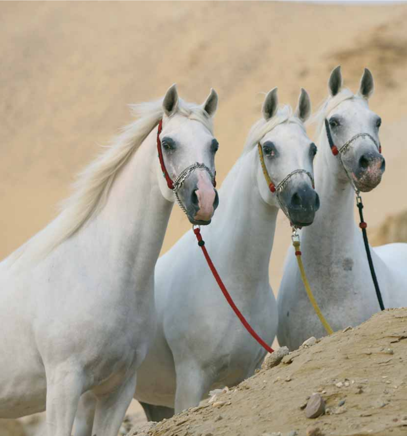
Kout El Kouloub - Granddaughter ^ Ghozlan - Great Granddaughter ^ Zahra RB

An outside stallion who factors importantly into the breeding program at Rabab is El Basha Sqr. (Imperial Madori x Alidaara) who has left Egypt for Saudi but left a strong pre-