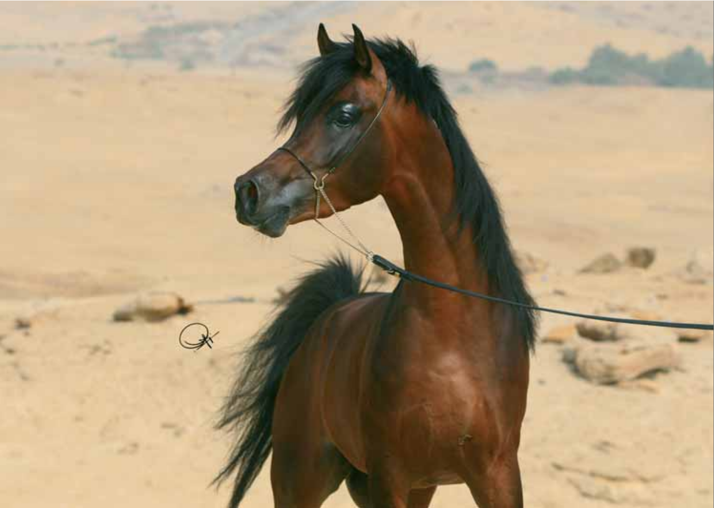
Mozahem (Shaikh Al Shamal x Nermein El Sheruk)