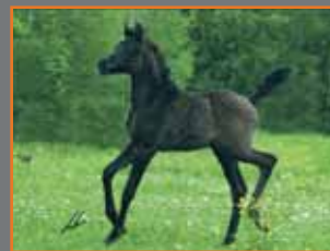
GR Meskarah (GR Amaretto x Meeskah Maisa)

still strongly represented in today's program. The magnificent grey mare, Kout El Kouloub (Ikhnaton x Ghadeer) '85, her famous stable mate, the dynamic chestnut mare, Sharbat (Raki x Wasfeya) '85, the lovely Egyptian-Spanish cross mare, Shaymaa (SEA Maddah x Bushret Kheir) '86 are all National and International Champions as well as being dams of multi champions.