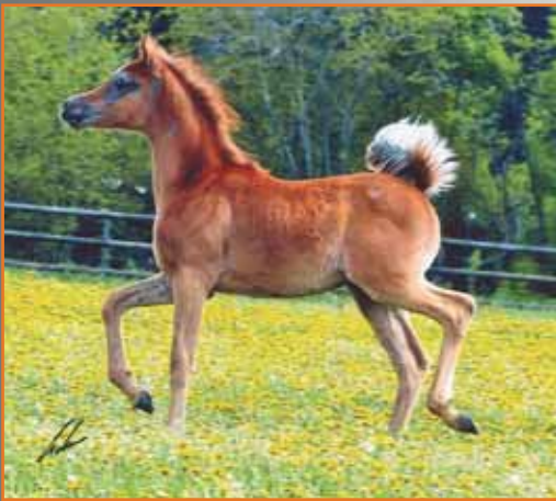
GR Lahari (Al Lahab x GR Marianah)

night blooming jasmine: all blooms with haunting essence that can take your mind on wonderful journeys. It is a time when you can find another world in the shadows before you. Imagine yourself on a moonlit night sitting in a fragrant garden at the edge of the desert not far from the monuments of ancient Egypt. A glim-