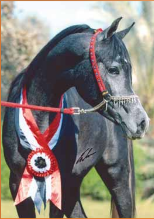
Morgan Al Najdiah – RB (Ibn El Basha x Bardeya)