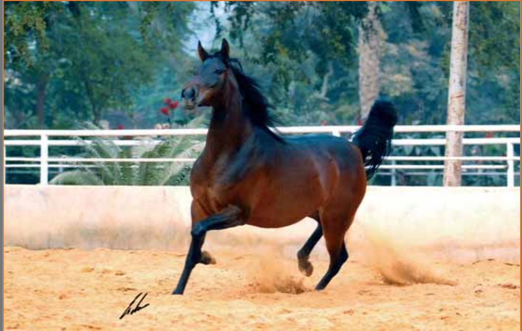
Bint El Basha (El Basha Sqr. x Bardeya)