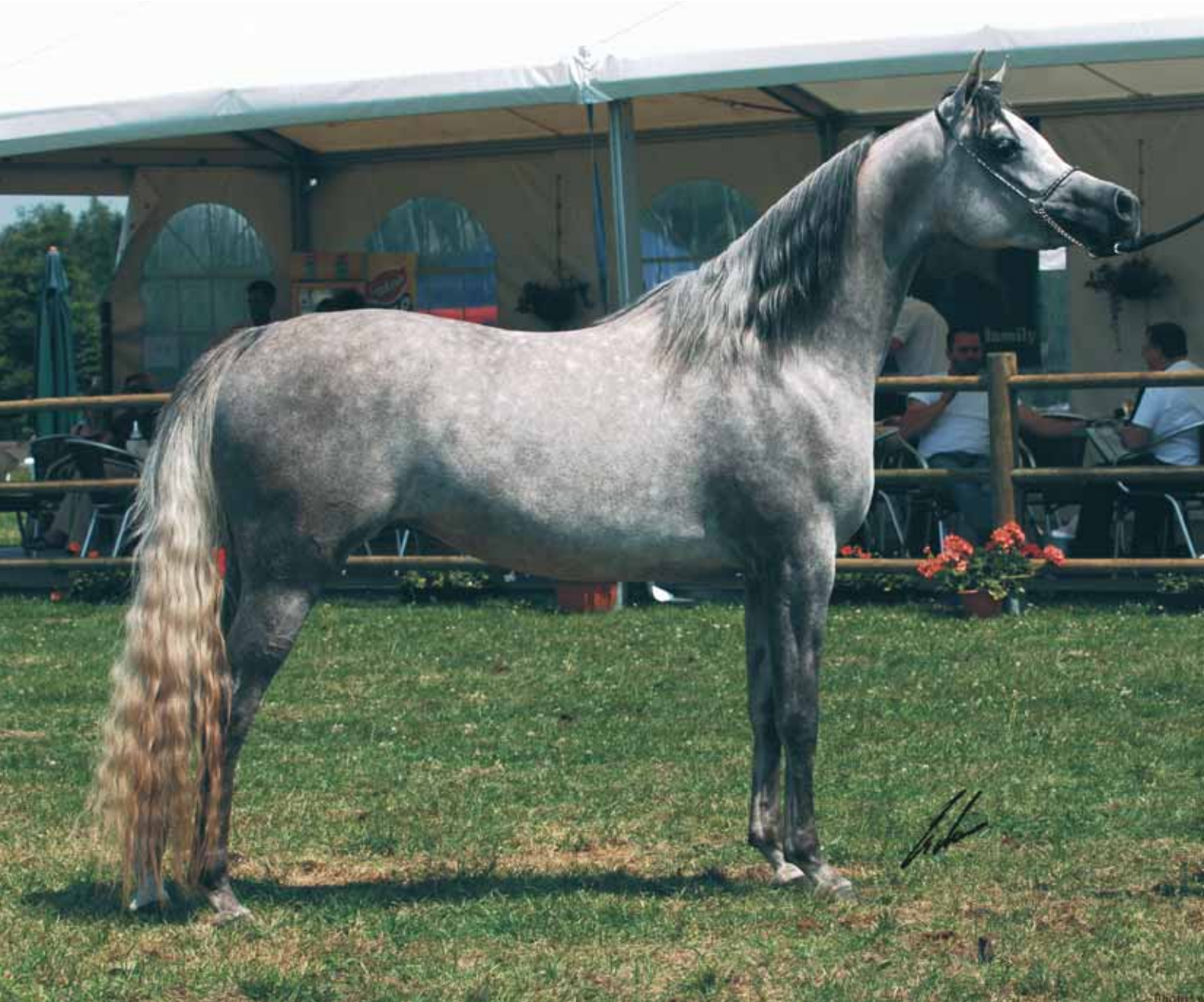
Mahala (Al Lahab x Mahasin II)

recent addition to the farm, the dappled bay colt Mozahem, by Shaikh Al Shamal out of Nermein El Sheruk is carrying lines that go back to Ruminaja Ali, Farazdac and Imperial Imdal. These are among the royalty of Arabian breeding all returning with great flourish to Egypt, the country of their predecessors.