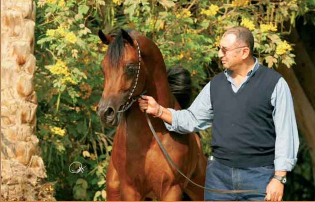
Kenz Noor (Imperial Madori x Naksh El Kouloub) with Khaled bin Laden