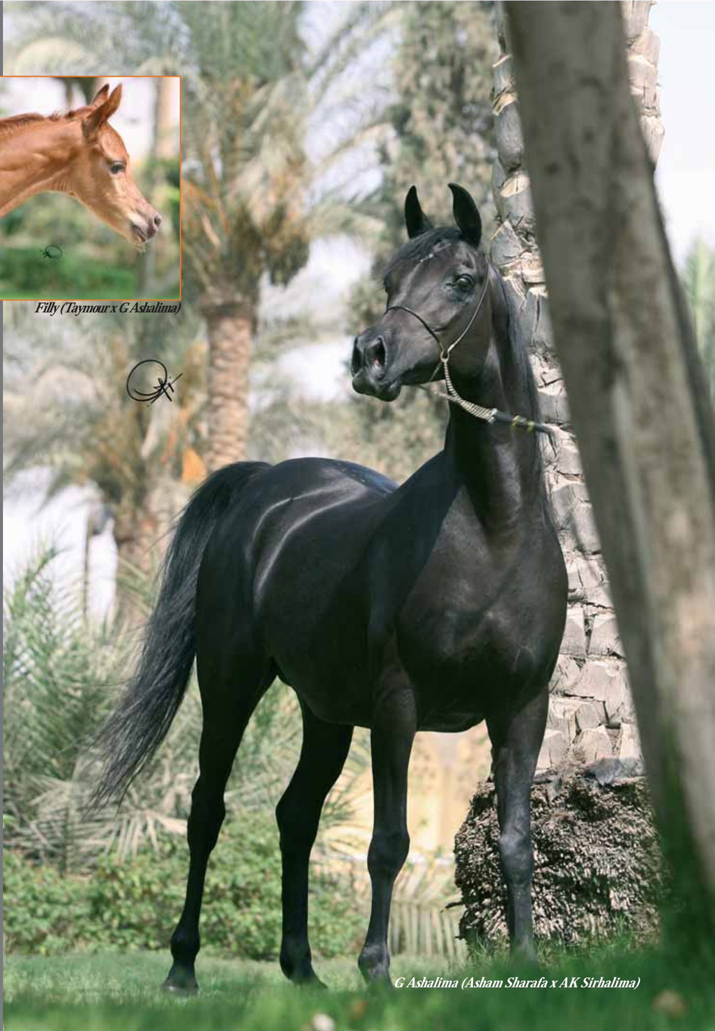
G Ashalima (Asham Sharafa x AK Sirhalima)