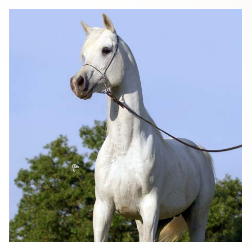
Frasera Rafis (Frasera Ramses Shah x Frasera Nefisa) Mare 2007