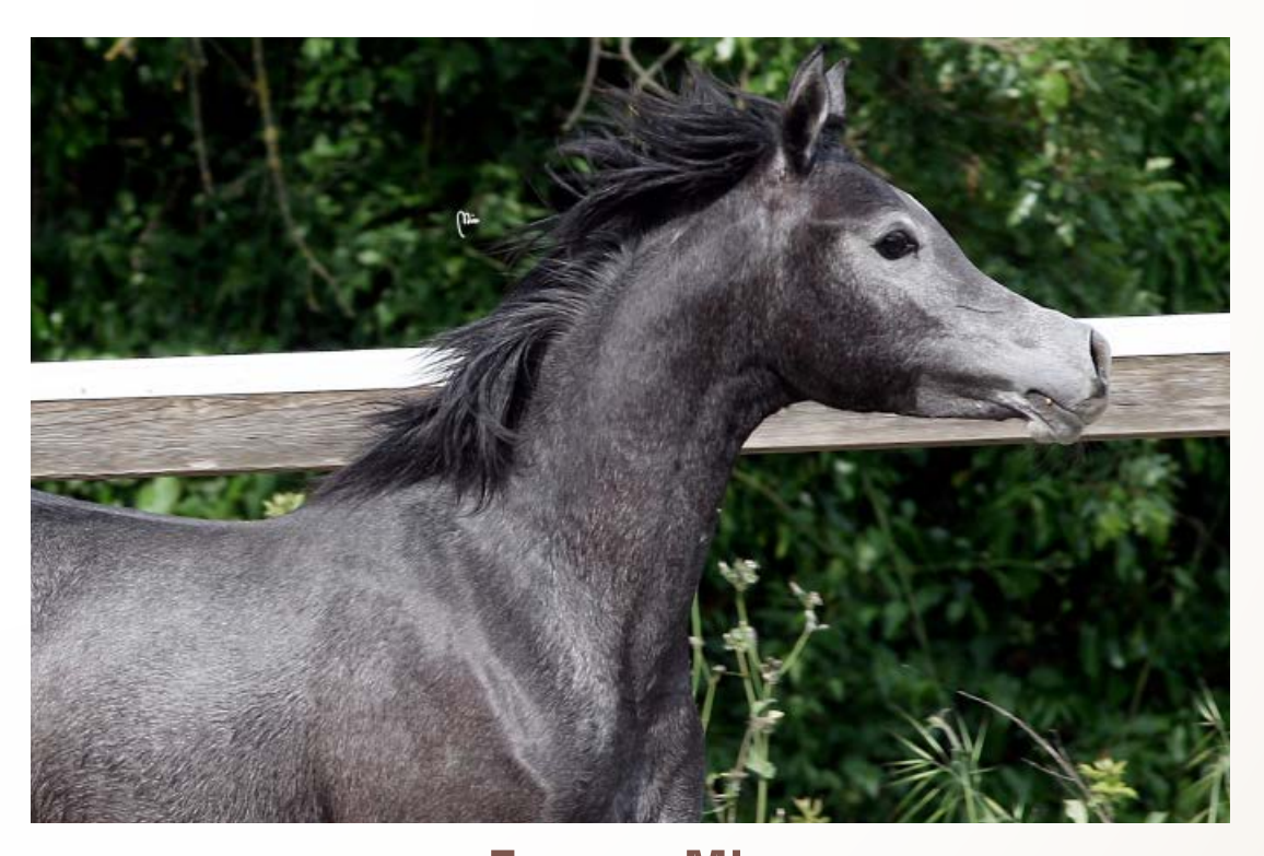
Frasera Mia (Frasera Ramses Shah x x Frasera Shahira) Filly 2013