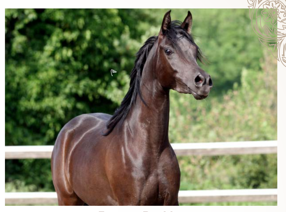
Frasera Rashira (Frasera Ramses Shah x Frasera Shahira) Filly 2012