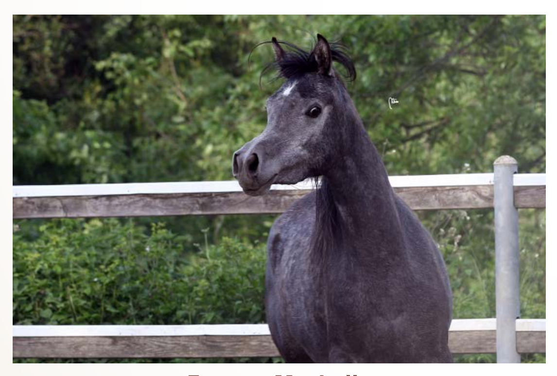
Frasera Mashalla (Frasera Ramses Shah x M B Madora) Filly 2001