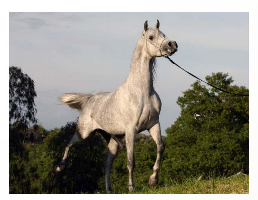
Frasera Ramsete (Frasera Ramses Shah x Frasera Shahira) Stallion 2008