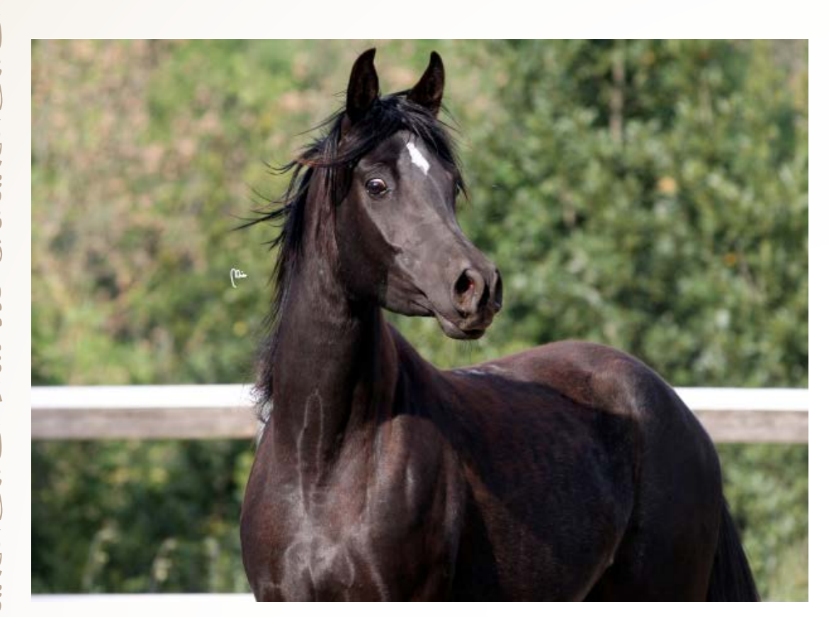
Frasera Farida (Frasera Ramses Shah x Frasera Hadiyra) Filly 2011