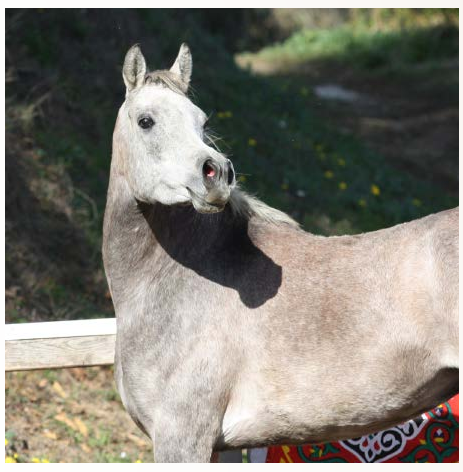
Frasera Madara (Frasera Ramses Shah x Mb Madora) Mare 2007