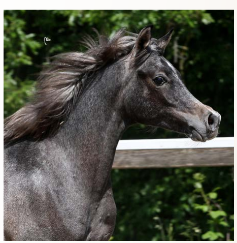
Frasera Amir Shah (Frasera Ramses Shah x Frasera Shailla) Colt 2013