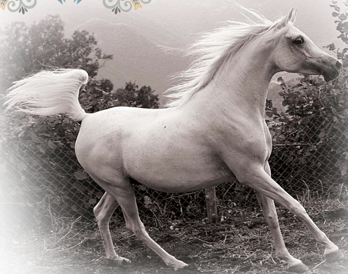
Farha Diba Le Soleil, mother of Amra Ayda Le Soleil proudly bred by Le Soleil and owned by Amra Arabians