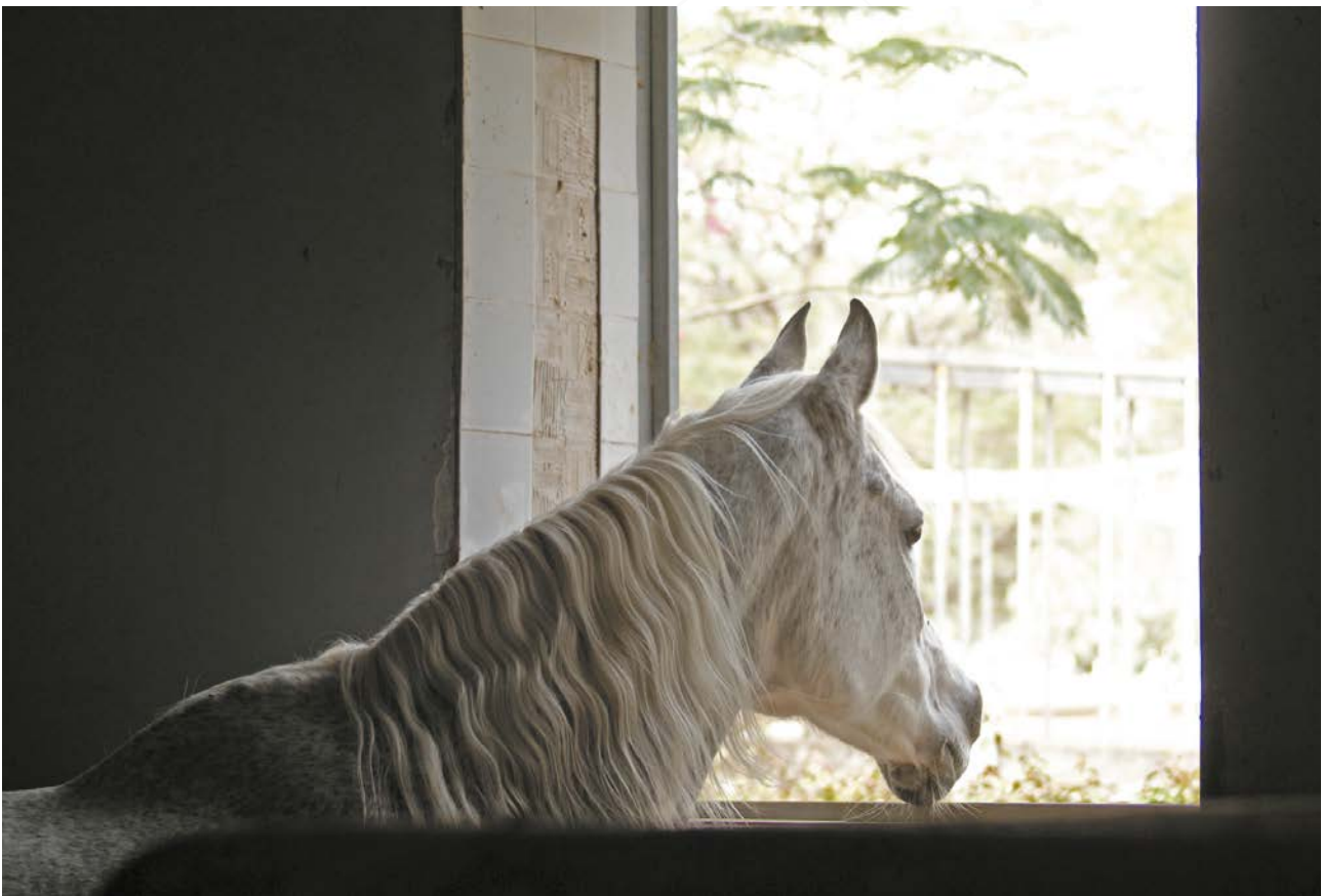
SAFI R AL RAYYAN (ASHHAL AL RAYYAN - RN FARIDA), AL RAYYAN FARM 2015