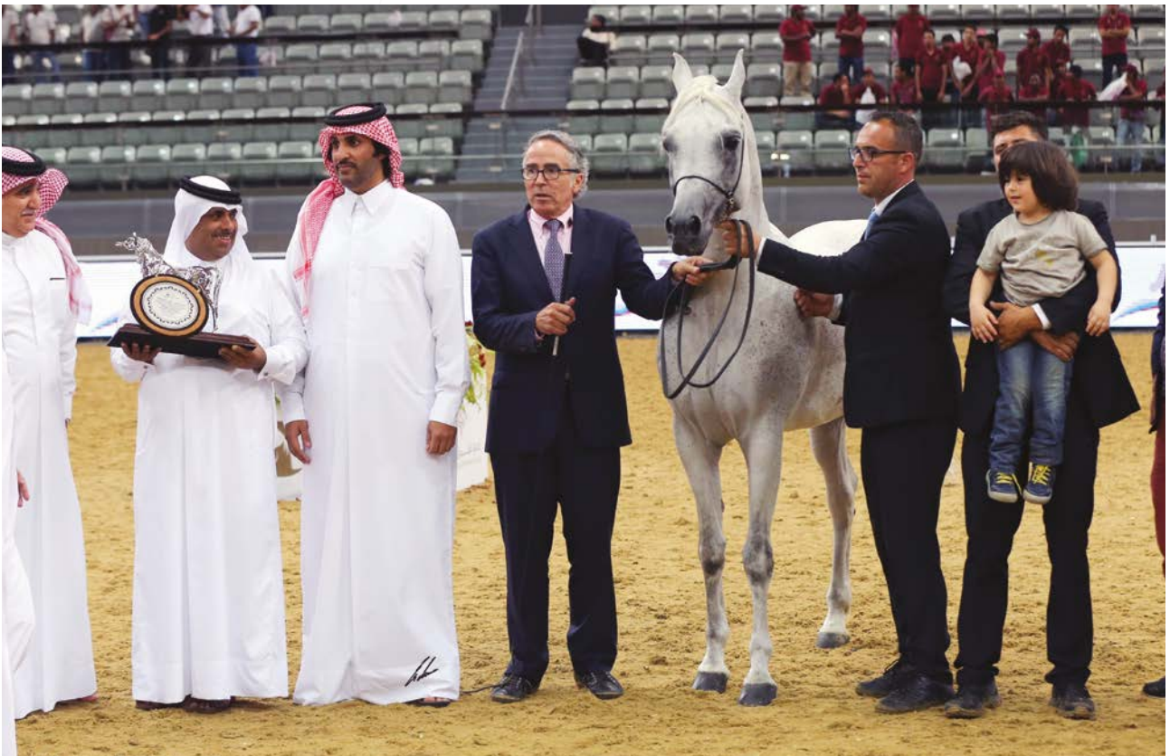
SAFIR AL RAYYAN (ASHHAL AL RAYYAN X RN FARIDA) SILVER MEDAL STALLIONS