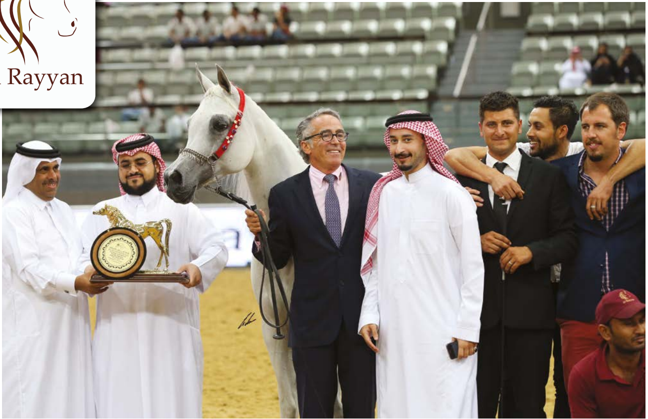
RAYYANA AL ALIYA (ASHHAL AL RAYYAN X ASRAR AL RAYYAN) GOLD MEDAL MARES