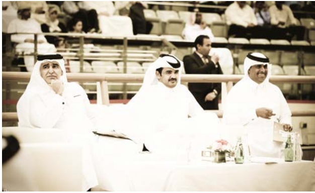
QATAR INTERNATIONAL STRAIGHT EGYPTIAN SHOW 2016