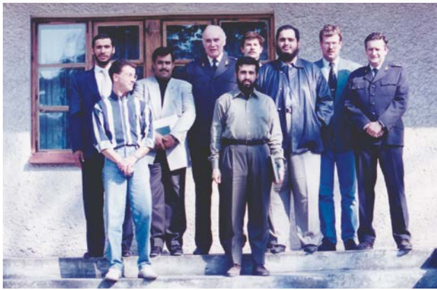
MICHAŁÓW STATE STUD, POLAND, 1994