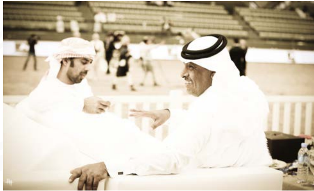
QATAR INTERNATIONAL STRAIGHT EGYPTIAN SHOW 2016