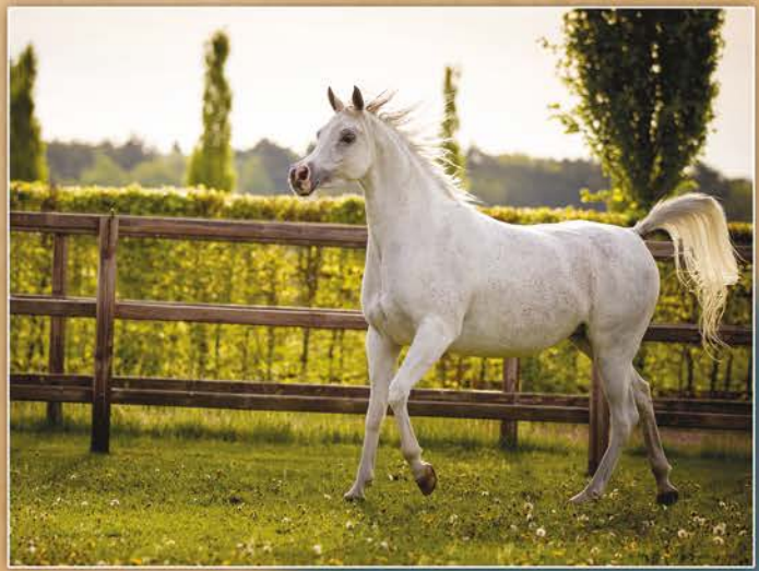
Last year Malaak blessed Sham Stables again with a filly; Madinah al Sham, sired by Ansata Nile Echo.

The first foal Malaak produced the gorgeous filly Malikat al Sham, sired by Rayyan al Naif. Malikat grew up into a beautiful mare with a very pretty face, a smooth body and decent movement. She is in foal to Najm al Rayyan for 2017.