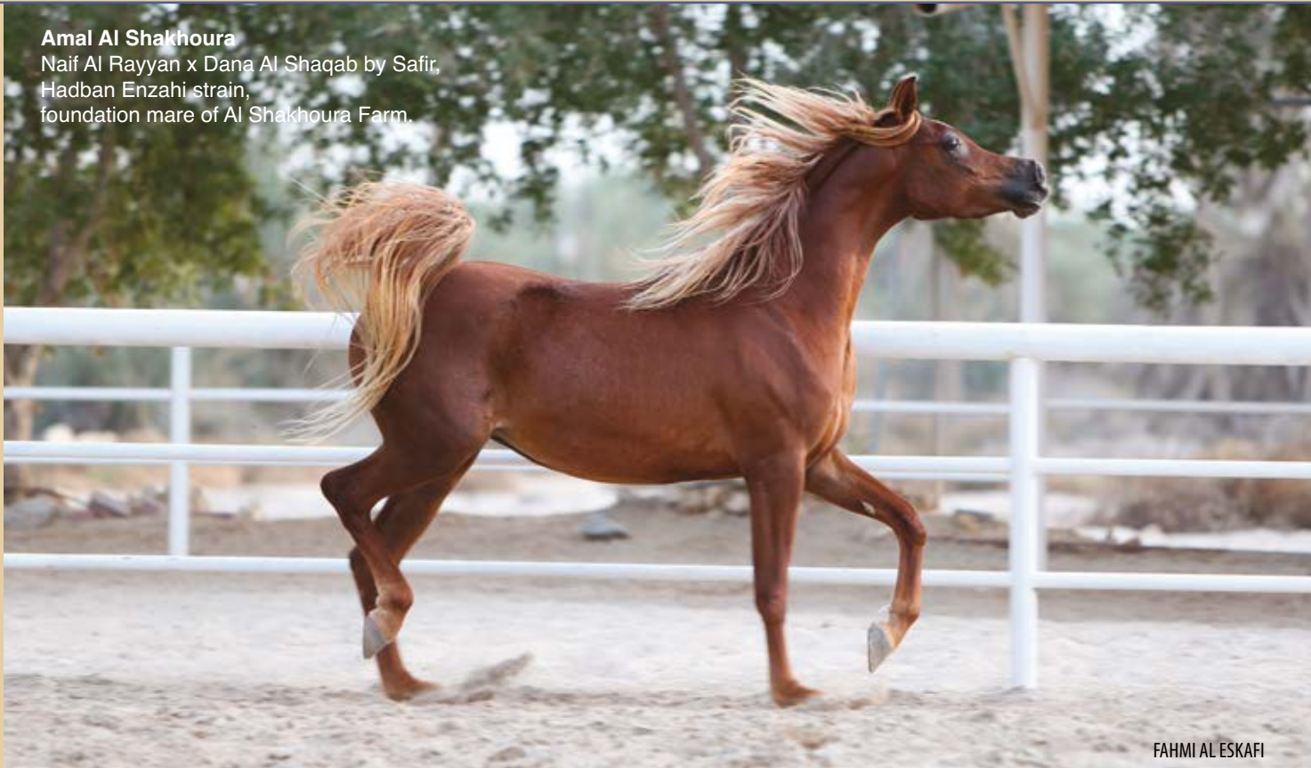
Amal Al Shakhoura Naif Al Rayyan x Dana Al Shaqab by Safir, Hadban Enzahi strain, foundation mare of Al Shakhoura Farm.