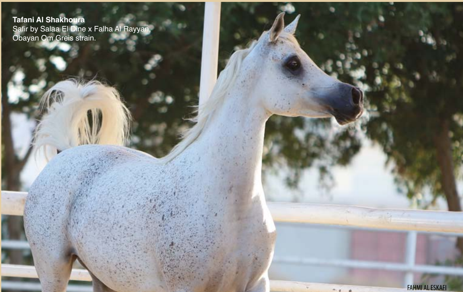
Tafani Al Shakhoura Safir by Salaa El Dine x Falha Al Rayyan, Obayan Om Greis strain.