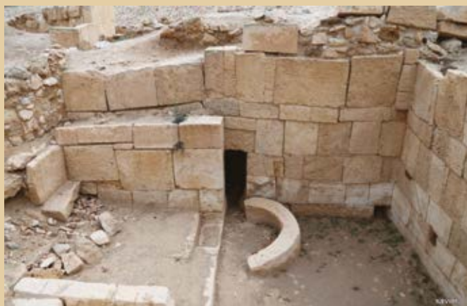
The Barbar Temple is an archaeological site, considered to be part of the Dilmun culture, dating back to 3000 BC. Al Shakhoura farm is in his neighborhood.

in 700 AC they were displaced by Arabians who brought Islam to the islands. Later on, it was Persians who had a strong cultural influence on the inhabitants and are well known for their mastery in breeding Arabian horses. Maybe this history is why today, Bahrain is known for its cosmopolitanism, as manifested in the shopping malls and a formula 1 racetrack; the sand beaches, museums and desert landscapes; as well as historic Souks, authentic Arabian houses, fortresses, and prehistoric burial mounds. In between all the ancient witnesses to Bahrain's stunning past, there are small Arabian villages to be found here and there, and in many of them there are horse lovers living who are successful breeders of Arabian horses.