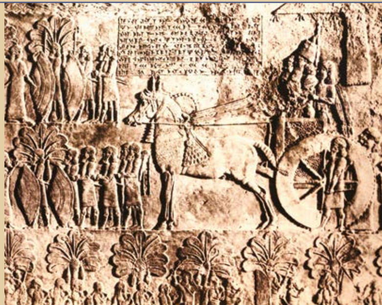
The Dilmun king Hundaru of Bahrain paid annual tribute. On this relief from the palace of Nineveh the Assyrian ruler is seen receiving booty from a captured city, including finest horses.