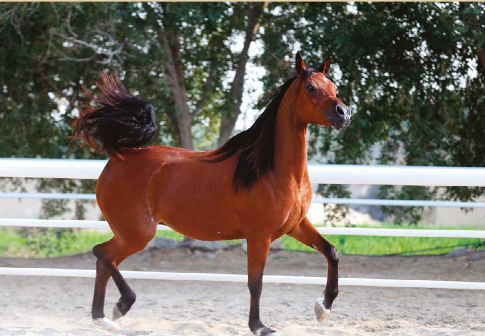
Salama Al Shakhoura Naif Al Rayyan x RN Ghazalla by Amir Al Badeia, Saglawi Jedran strain, foundation mare of Al Shakhoura Farm.