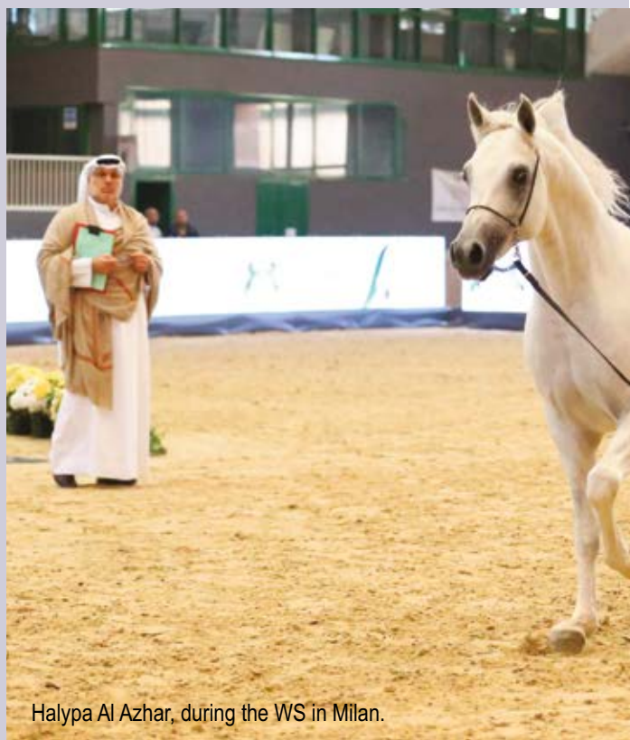
Halypa Al Azhar, during the WS in Milan.

Lorenzo: „No, the horses here are half Straight Egyptians, and half are show horses of mixed blood lines. However, there are not many breeders of Straight Egyptians who attend shows. Most of them wish to make sure that their horses will have a good life even during show training, so they bring them to us.“