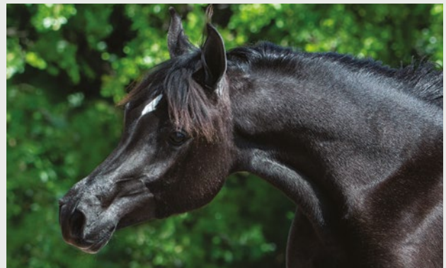
Farab Al Jood (Alixir x Fariba Magidaa) 2016 black straight Egyptian filly