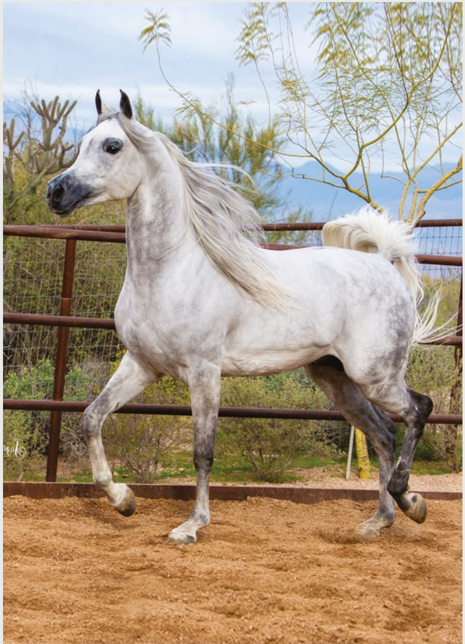
Malik El Jamaal (Ludjin El Jamaal x Pinga) 2010 grey purebred stallion