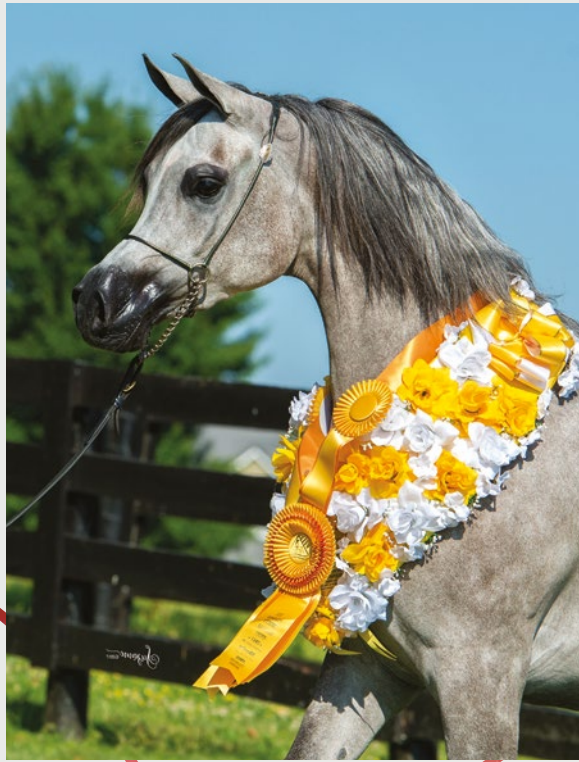
Maraam Al Jood (Marajb KA x RSL Faith by Alixir) 2014 grey straight Egyptian mare