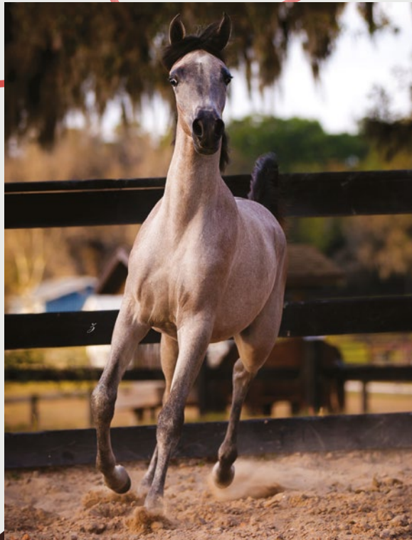
AJS Sigi's Belle (Marajb KA x Om El Badra) 2017 grey purebred filly