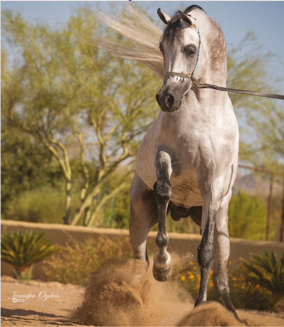
Destyned Valentino (DA Valentino x Fabrices Destiny) 2009 purebred stallion