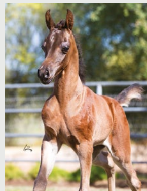
2017 colt (D Angelo x DD Crown Jewel). Bred and owned by Gemini Acres