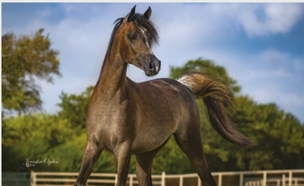
Malak Al Jood (Alixir x Miss Maggie Mae) 2015 grey straight Egyptian filly