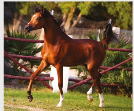
AJS Johara El Malik (Malik El Jamaal x La Dolce Julye) 2017 purebred filly