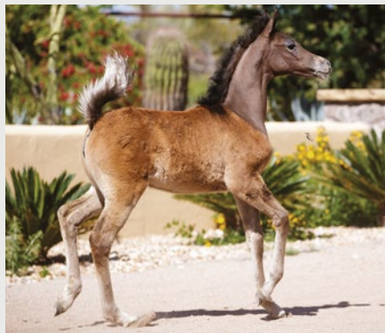
AJS Khamelia El Malik (Malik El Jamaal x Khaleesi SWF) 2017 purebred filly