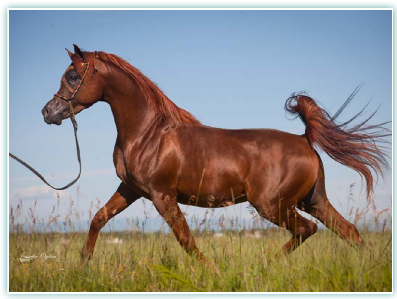
El Zilal Tamar