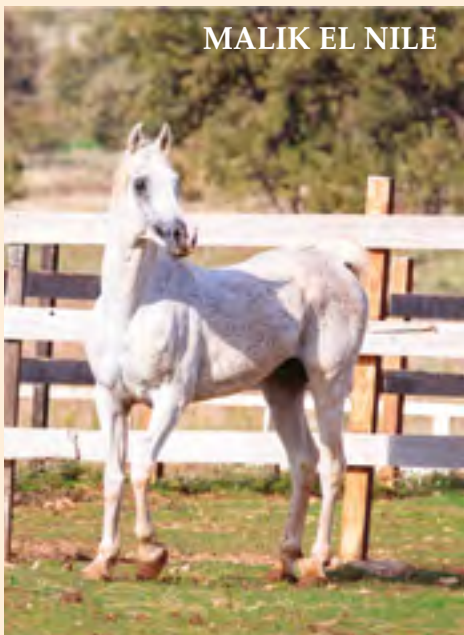
MALIK EL NILE