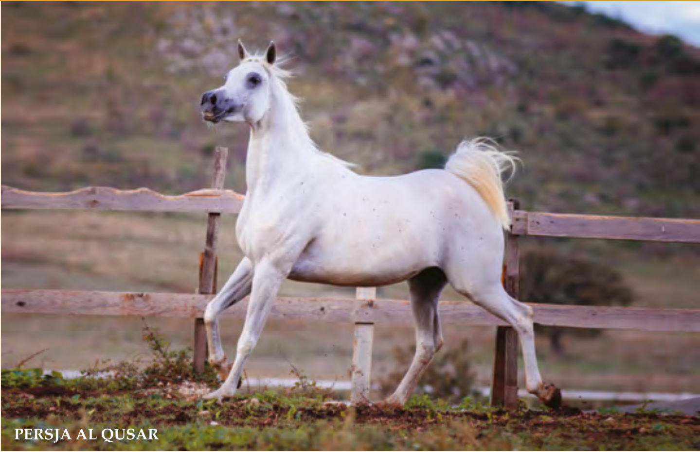
PERSJA AL QUSAR