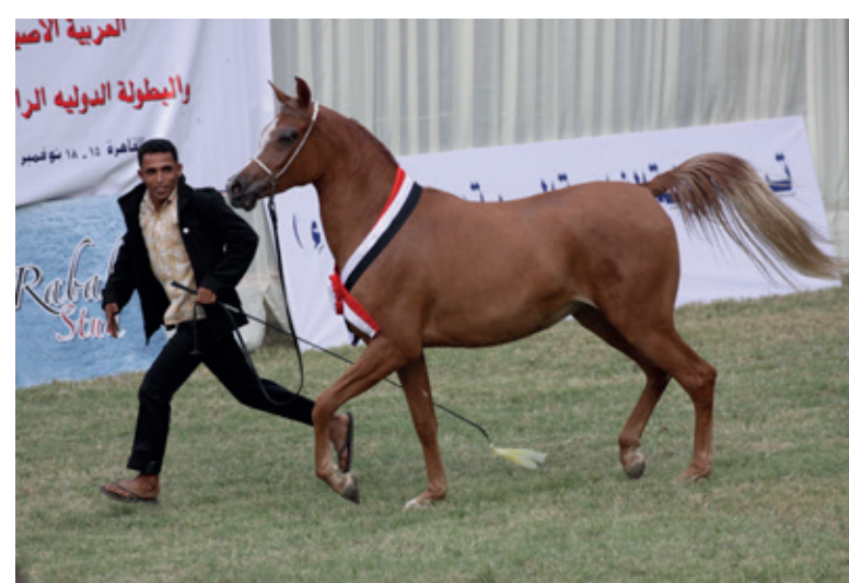
Molesta III (Amal Al Khaled x Mokesta II) owned by Al Amin stud and wining the fillies Gold championship at El Zahraa National Show