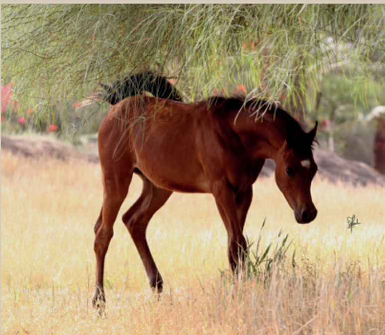
Zahia Eladiyat (NK Jamal El Dine x Eladiyat) and her daughter Zaytoona Eladiyat (NK Nabhan x Zahia Eladiyat)