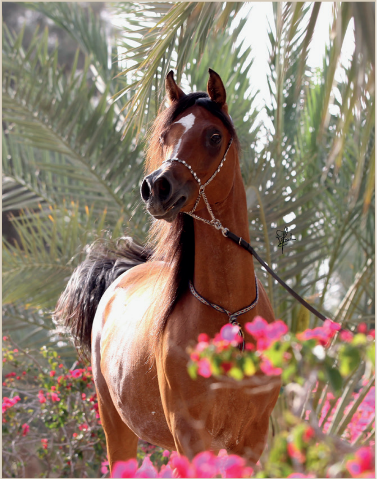
NK Lamees (NK Kamar El Dine x Munira Al Arabiya)