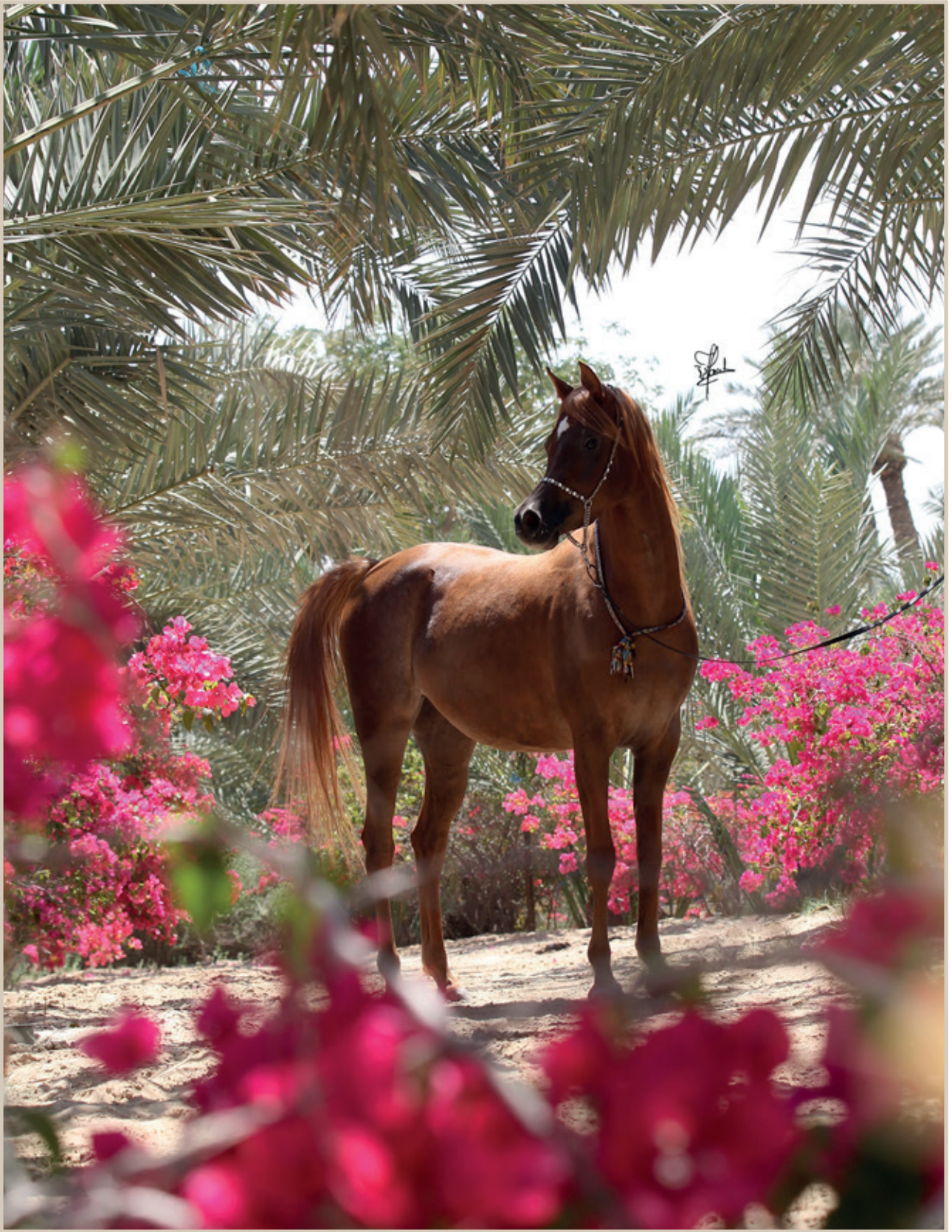
NK Laymounah (NK Nadeer x NK Leena)