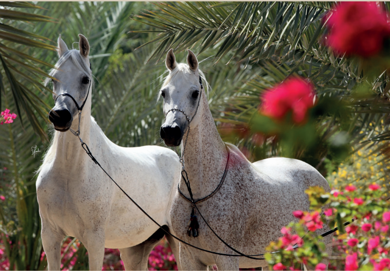
Zabia Eladiyat (NK Jamal El Dine x Zubaida Eladiyat) Amal Eladiyat (NK Jamal El Dine x NK Ahlam)

under construction and one of the most impressive community of Arabian horse studs cropped up in this area of Kuwait in a relatively short time.