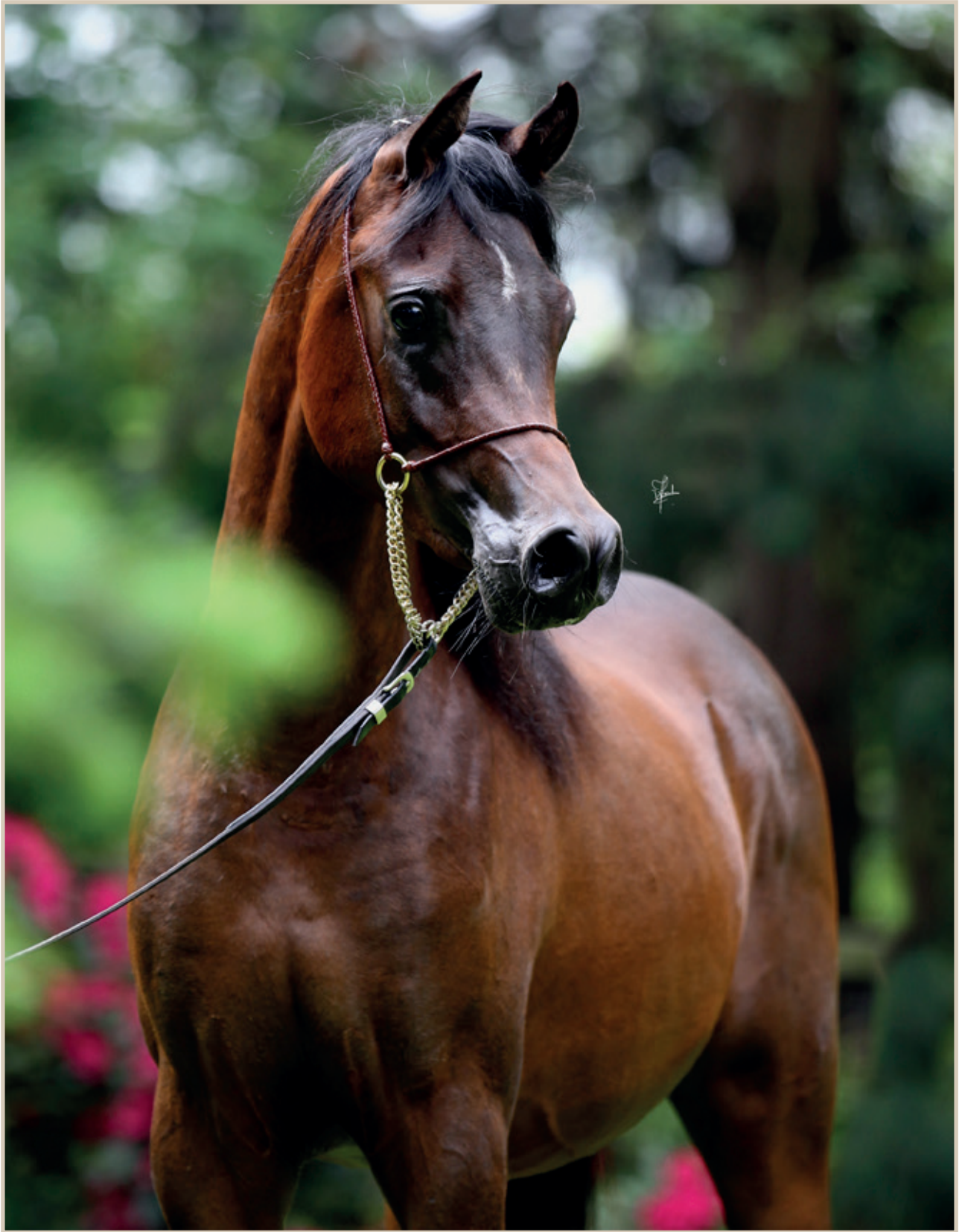
NK Nizam (NK Hafid Jamil x NK Nadeerah)