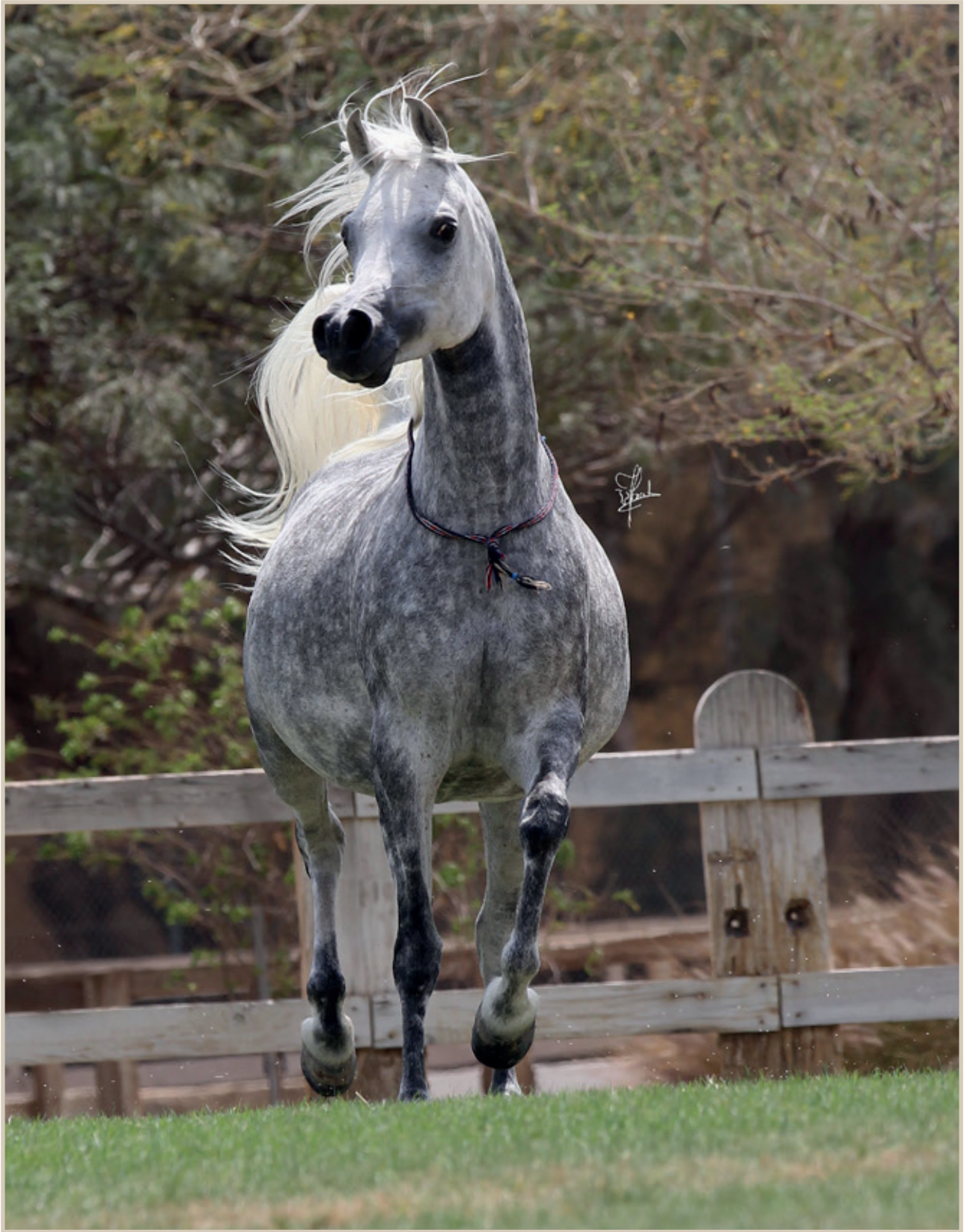
Badra Eladiyat (NK Hafid Jamil x NK Bint Nashua)