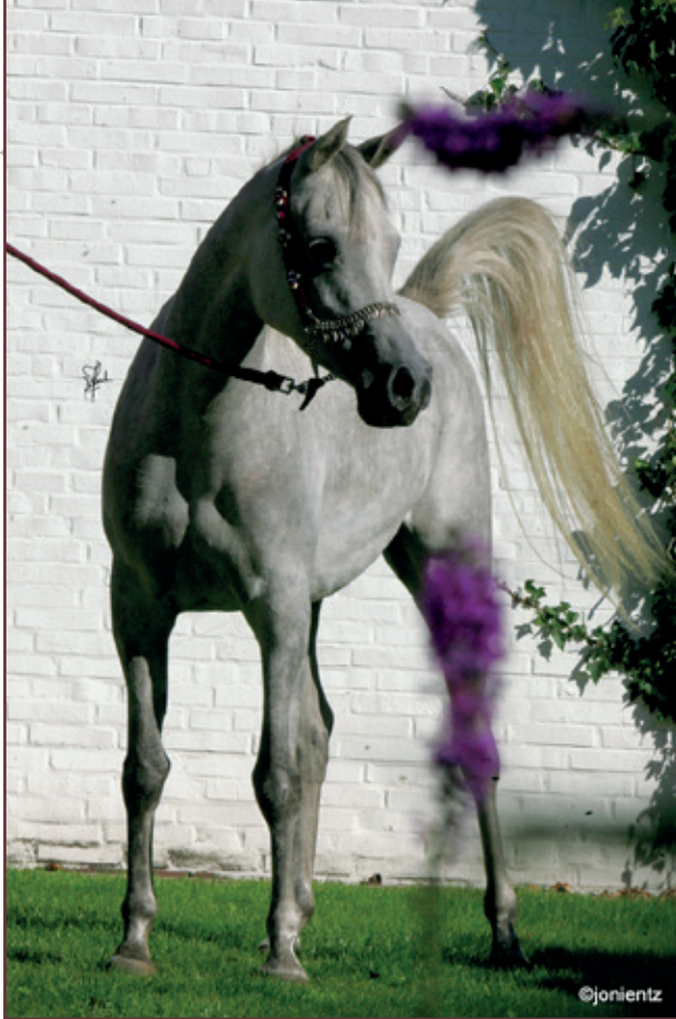
El Thy Kenana (Ajmal Tameen x El Thy Konouz by El Thy Mahfouz and El Thy Kamla)

people during the shows, and many of them were new to the field. They asked questions, and they really wanted to acquire information. There was nothing like a VIP area. Everybody was on equal standing with everybody else. Today, horses that are intended for shows need to work through lengthy and costly training. If you watch the visitors in the VIP area, you will see them engaged in animated conversation with not a lot of attention spared for watching the horses in the arena. If there is interest in horses, it's usually just in the horses owned by that person, and mostly restricted to those who produce a championships title for you. More often than not, the owners are not even there, sending their managers to accept any trophies.