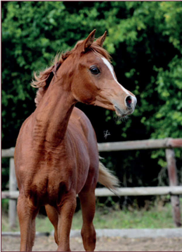
El Thay Mouna Al Ryah (Nader Halim x El Thay Mayassa by El Thay Mahfouz and El Thay Magidaa)