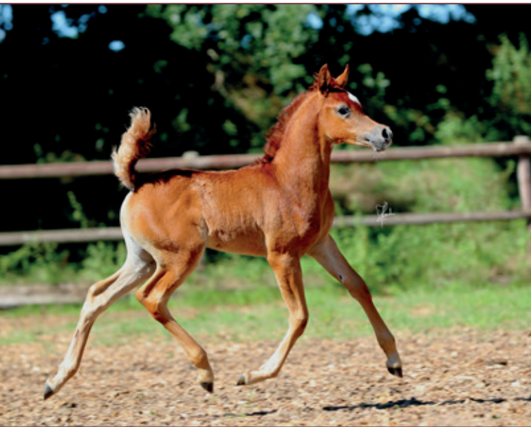
El Thay Komeira Al Sabah (NK Nabhan x El Thay Kateefa by El Thay Mahfouz and El Thay El Thay Khadija)