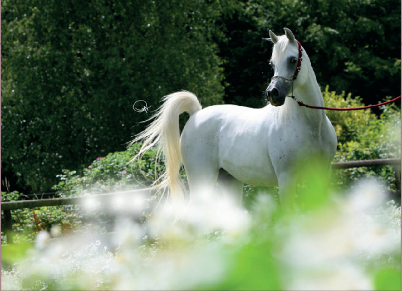
El Thay Kamla (El Thay Mashour x Kamla II by Ansata Halim Shah and Mona III) owned by Al Waab Farm, Qatar