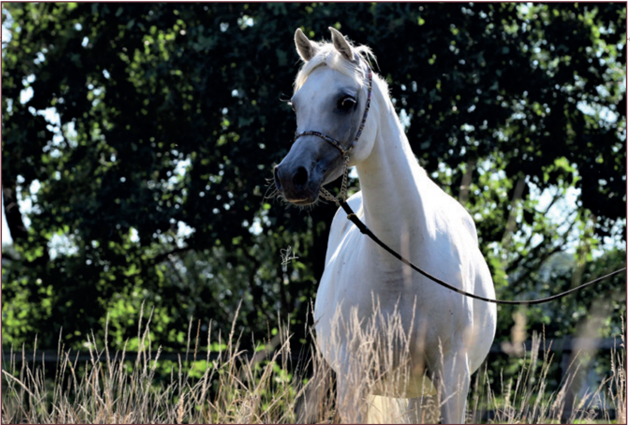
El Thay Mazyouna (El Thay Mahfouz x El Thay Malikah by Ansata Selman and El Thay Mashoura)