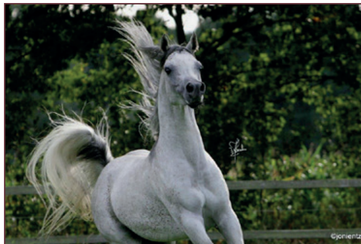
El Thy Karim Shah

In my opinion, it doesn't make sense to breed "show Egyptians". Show horses have been invented already!