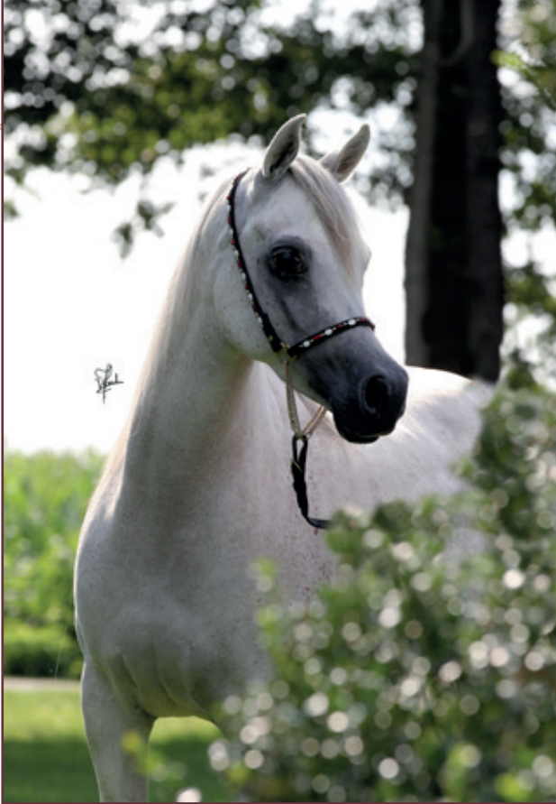
El Thay Kateefa Al Sabah (El Thay Mahfouz x El Thay Khadija by El Thay Mashour and Kamla II)