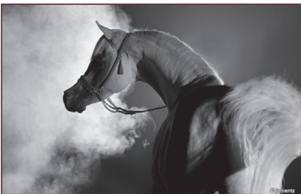
El Thay Mahfouz (Ansata Selman x El Thay Mahfouza by El Thay Ibn Halim Shah and El Thay Mansoura)

Genetically speaking, the stallion's pedigree should not be too far away from my mares' ancestry. My mares will produce just one foal per year which they will carry themselves, full term. And I just get five to seven foals per year anyway, so I like each of them to come close to what I imagined. In my experience, the probability to achieve that is highest in line breeding.