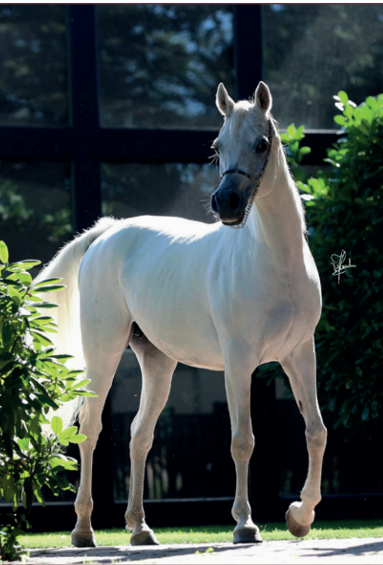
El Thay Malakah (El Thay Mashour x El Thay Mahfouza by El Thay Ibn Halim Shah and El Thay Mansoura)

However, today there is much more choice in horses, while the buyers are a completely different group now. Many are not able to assess a young horse and have no background knowledge regarding a horse's ancestry. So they prefer to buy a stallion that's all made, maybe has