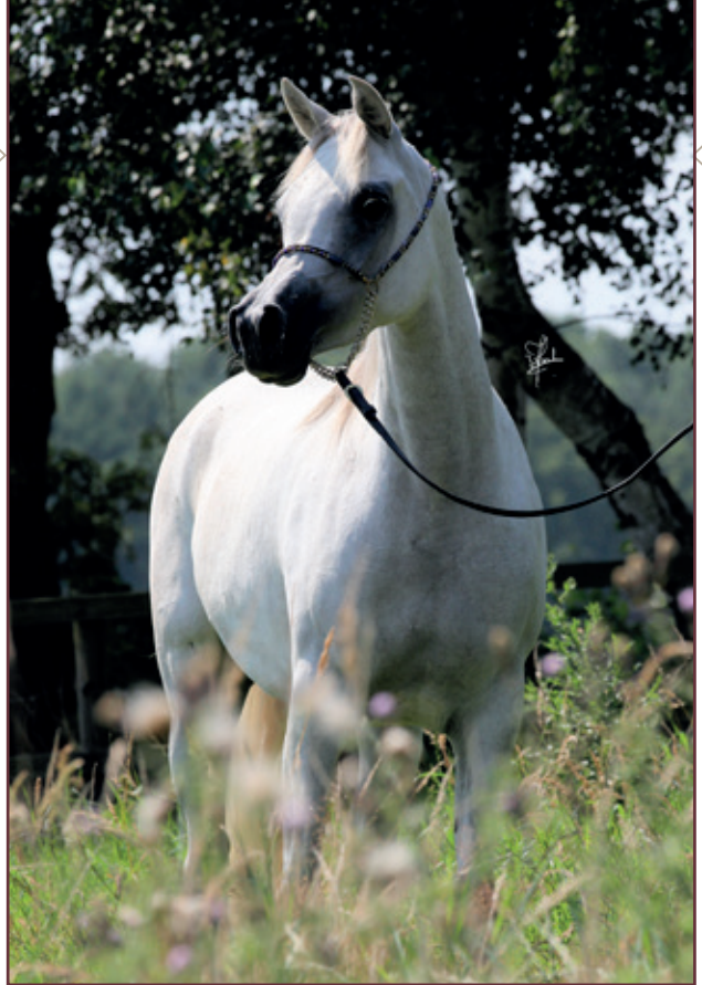
El Thay Kahila (El Thay Mahfouz x El Thay Kamla by El Thay Mashour and Kamla II)