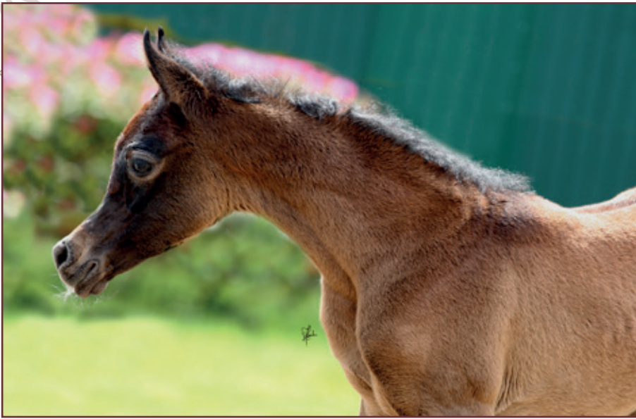
El Thay Kalilah (El Thay Karim Shah x El Thay Konouz by El Thay Mahfouz and El Thay Kamla)