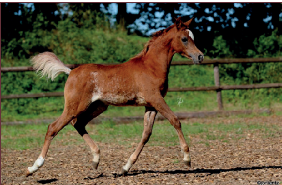
El Thay Kidounah Al Sabah (El Thay Kais Al Sabah x El Thay Kamria by Ansata Selman and Kamla II)