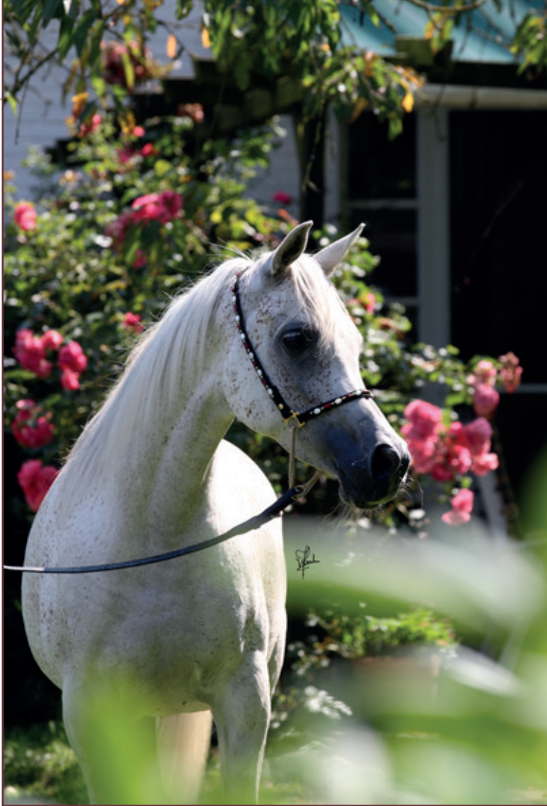
El Thay Kamria (Ansata Selman x Kamla II by Ansata Halim Shah and Mona III)

see those famous horses, of the ancient bloodlines, in their country of origin.