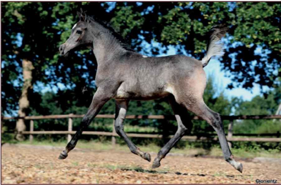
El Thay Kadira Al Sabah (El Thay Kais Al Sabah x El Thay Kenana by Ajmal Tameen and El Thay Konouz)