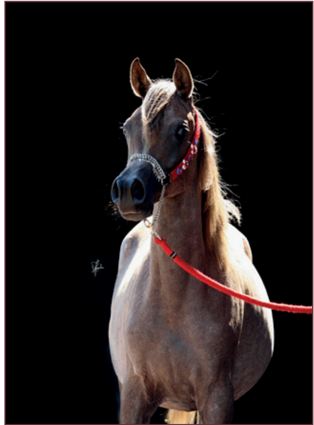
El Thay Kameelah (Nader Halim x El Thay Kareema by Ansata Selman and El Thay Kamla)

a new good home. Basically, however, everybody needs to decide for herself or himself how they will treat the animals they accepted responsibility for.