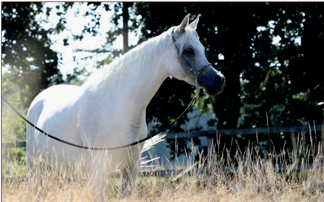
El Thay Munifa (El Thay Mahfouz x El Thay Malakah by El Thay Mashour and El Thay Mahfouza)

Cornelia Tauschke: I don't think globalization is the reason why everybody uses stallions that have come in from abroad. Ansata Halim Shah flew across the Big Pond even in 1983 in order to cover mares in Germany. At that time, „globalization“ was not even a term that was used in Arabian horse breeding. Of course you can obtain frozen semen from many well-known stallions all around the globe, but getting a valuable stallion to be stabled in your own stud, in order to cover your own mares and other people's mares naturally, that's a matter of trust. Which is what ought to be at the basis of the whole process.