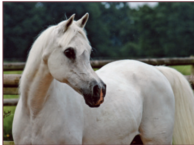
Kamla II (Ansata Halim Shah x Mona III by Hadban Enzahi and Mona II)