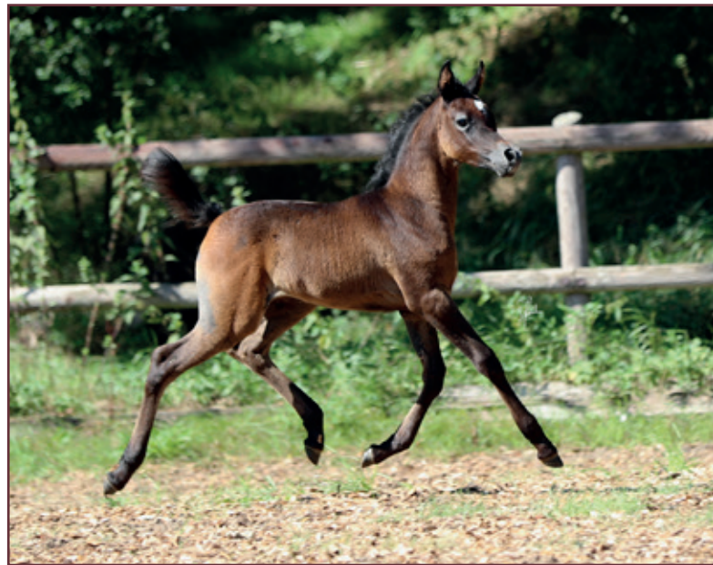
El Thay Kamala (NK Nabhan x El Thay Konouz by El Thay Mahfouz and El Thay Kamla)