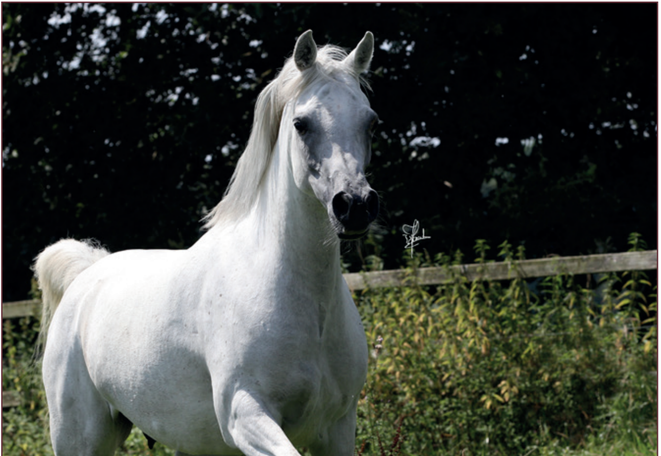
El Thay Konouz (El Thay Mahfouz x El Thay Kamla by El Thay Mashour and Kamla II)