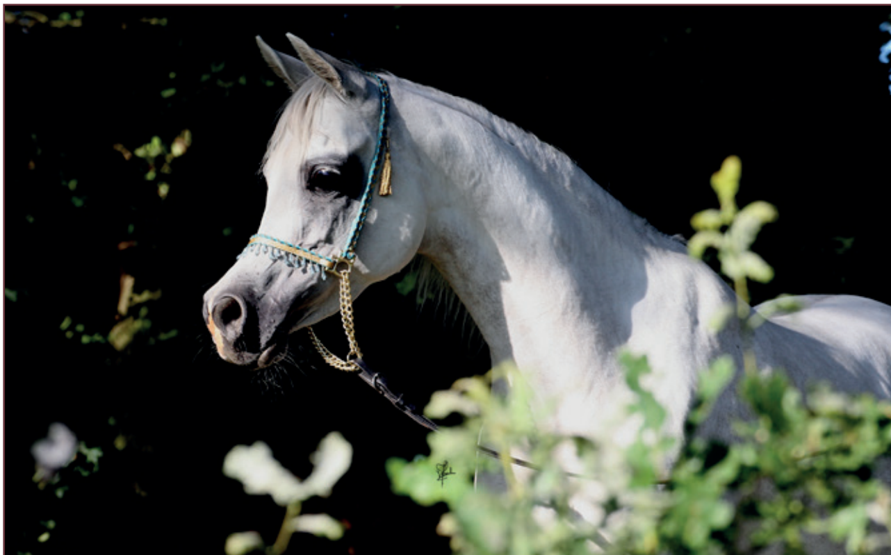
El Thay Toya (El Thay Mahfouz x El Thay Taqiyah by Ansata Selman and El Thay Tiffany)

The visitors that came to see the shows were actually interested in the horses, and we used to be addressed by