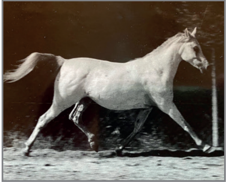
Momtaza (Sameh x Mamlouka by Nazeer and Malaka) bred by El Zahraa