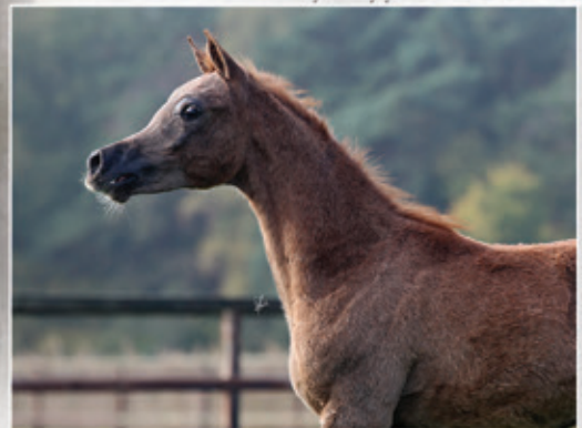
MORJAN AL SHAM by Ansata Nile Echo