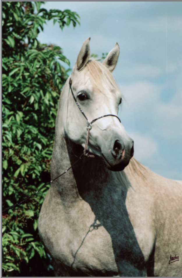
El Thay Bint Mofeedah (El Thay Ibn Halim Shah x Mofeedah by Hadban Enzahi x Malikah - back to Moheba, bred by El Zahraa