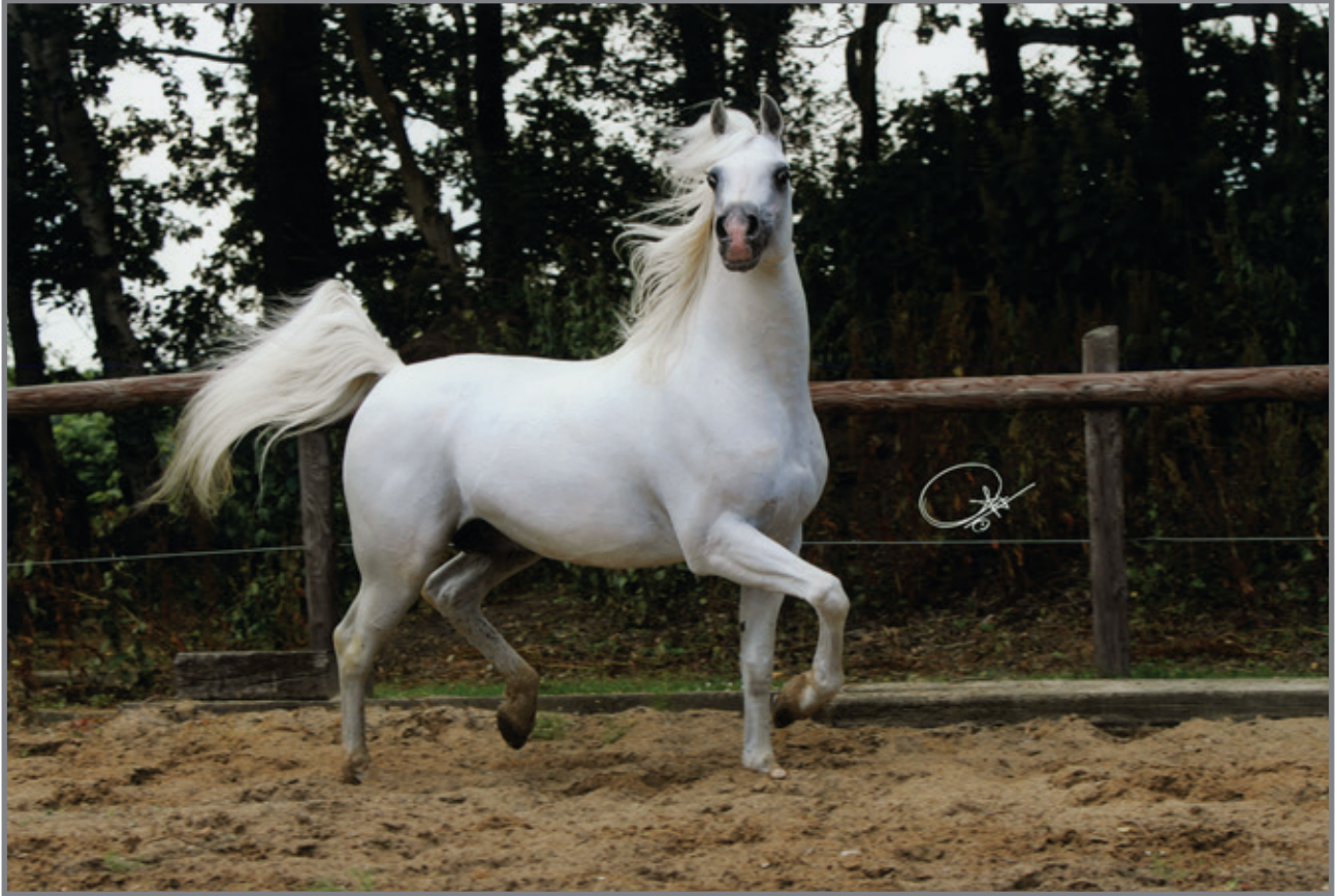
El Thay Mashour (Madkour I x El Thay Bint Kamla by El Thay Mansour and Kamla II) - he was awarded with the title 'Elite Stallion' by the German Arab Horse Society

century can be regarded as a time of transition. Some outside stallions were used for breeding, most notably the great Madkour I who nicked beautifully with the Kamla II family. His son El Thay Mashour (ouf of El Thay Bint Kamla by El Thay Mansour) was awarded a premium and later “Elite Stallion” and became one of the stud’s resident stallions, siring several broodmares who embody the special charm, attitude, and “El Thayeba type” which the stud has created and is well known