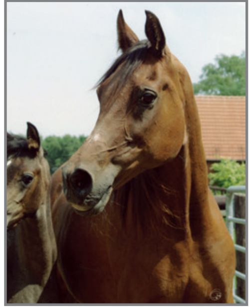
El Thay Maheera (Nizam x Mona II by Mahomed and Mahiba)

one of the most numerous in the stud today, besides having produced an impressive number of breeding stallions.