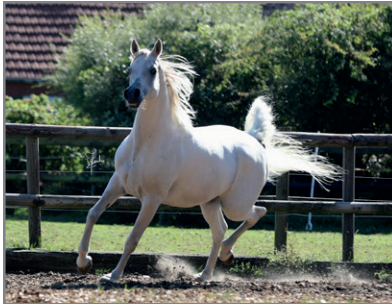
El Thay Malakah (El Thay Mashour x El Thay Mahfouza by El Thay Ibn Halim Shah and El Thay Mansoura)

Momtaza's family is represented by El Thay Malakah (El Thay Mashour x El Thay Mahfouza), her daughter