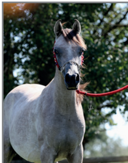
El Thay Mofida (El Thay Karim Shah x El Thay Mazyouna by El Thay Mahfouz and El Thay Malikah)