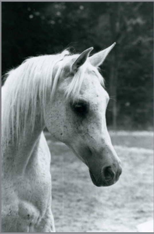
El Thayeba (Fayek x Mahdia) - The stud was named after her