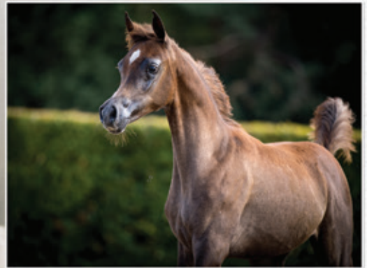
MALAK II AL SHAM by Ansata Nile Echo

forever remembered by her exceptional progeny at Sham Stables