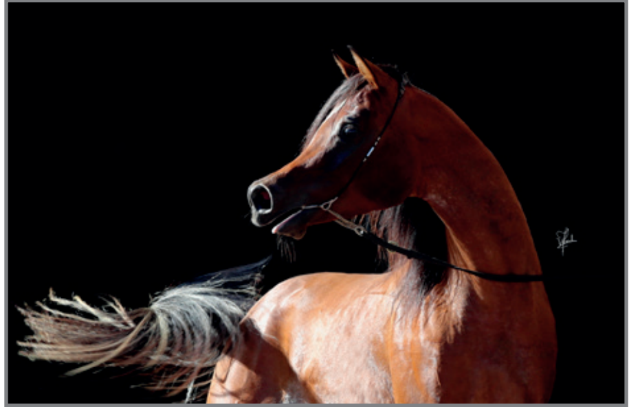
El Thay Kais Al Sabah (El Thay Karim Shah x El Thay Kateefa Al Sabah by El Thay Mahfouz and El Thay Khadija)

Just this spring, a very promising colt out of El Thay Toya and El Thay Kais Al Sabah was born: a sixth generation El Thayeba horse that combines all the foundation families.