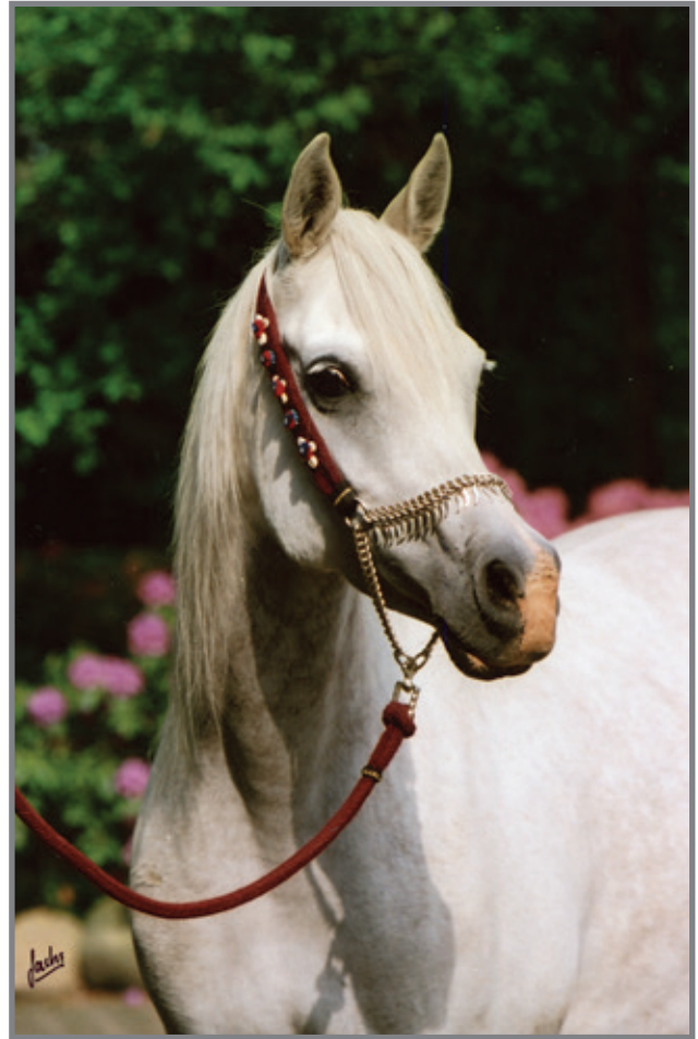
El Thay Mashoura (El Thay Mashour x El Thay Bint Mofeedah by El Thay Ibn Halim Shah and Mofeedah)