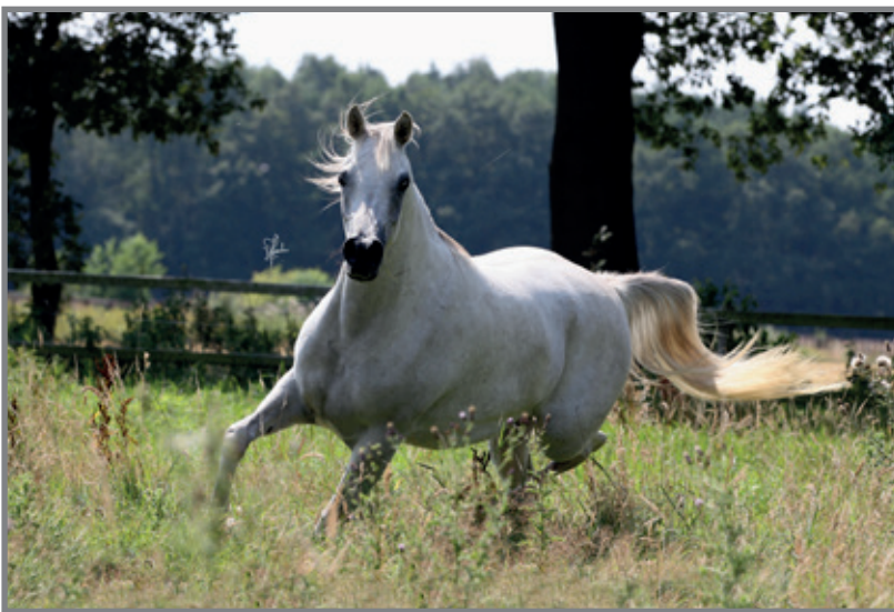
El Thay Kahila (El Thay Mahfouz x El Thay Kamla by El Thay Mashour and Kamla II)