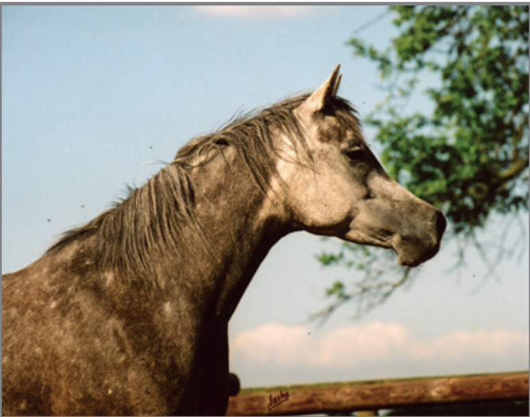
El Thay Mahfouza (El Thay Ibn Halim Shah x El Thay Mansoura by Machmut and Morawa)

including several treasured broodmares that have been retained.