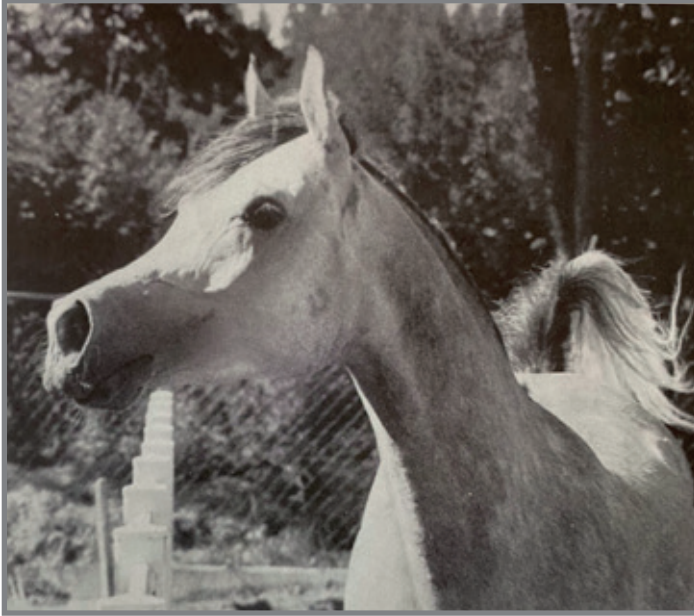
Mona II (Mahomed x Mahiba by Alaa El Din and Mouna) her dam was bred by El Zahraa