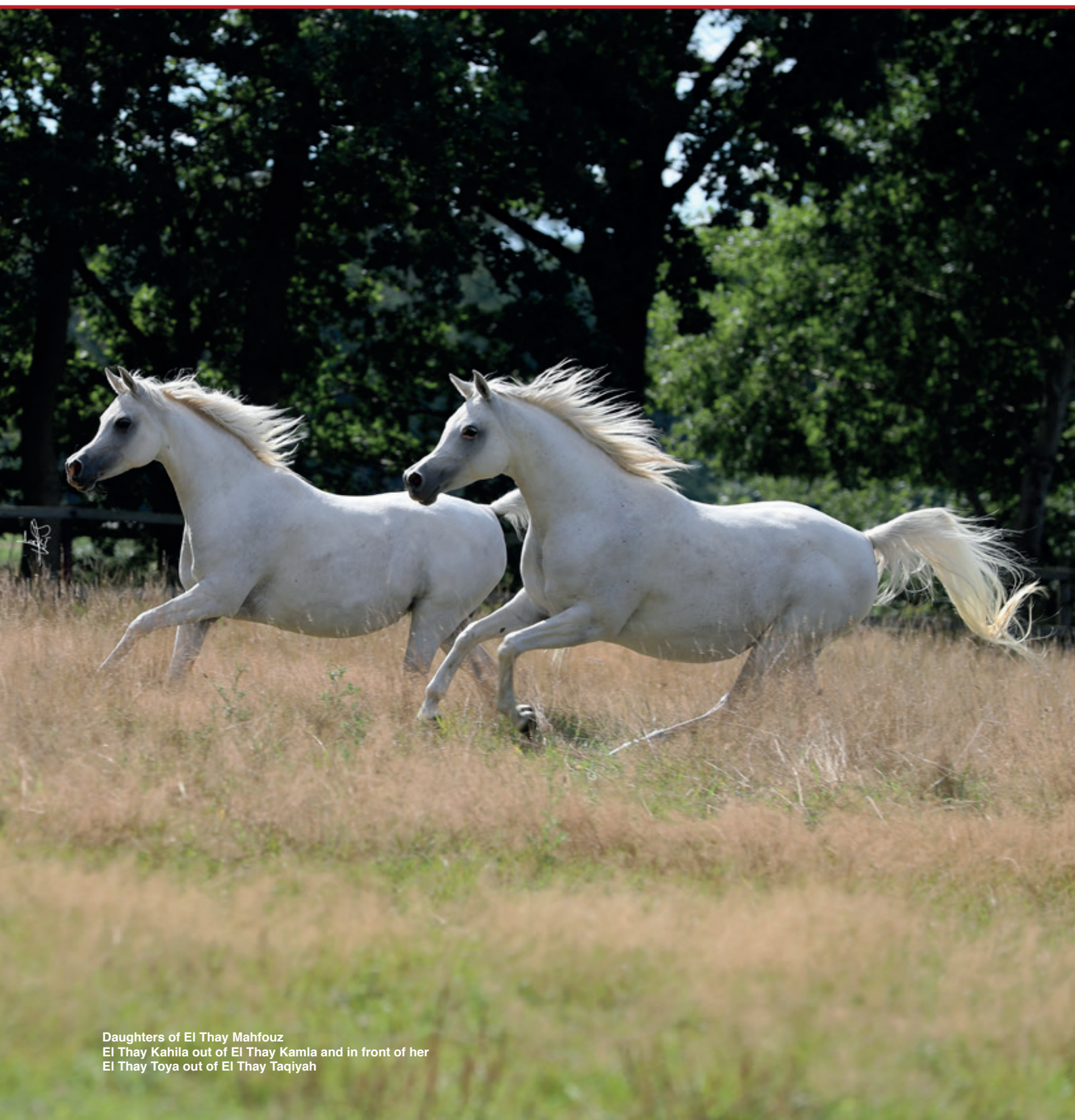
Daughters of El Thay Mahfouz El Thay Kahila out of El Thay Kamla and in front of her El Thay Toya out of El Thay Taqiyah