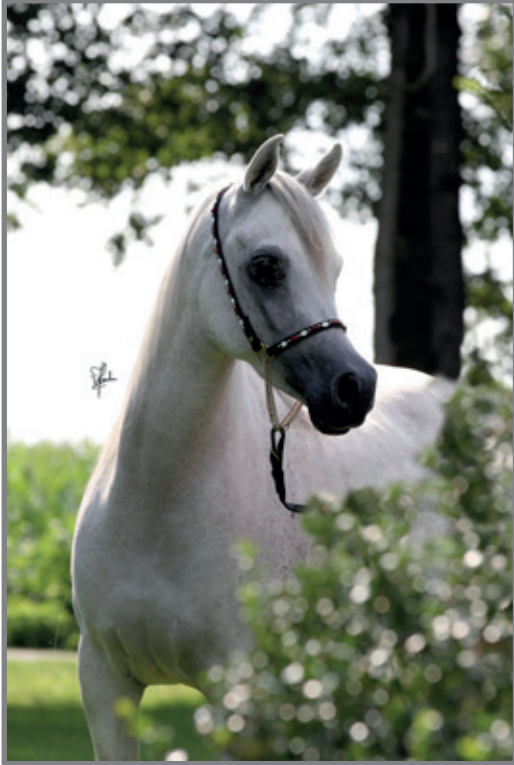
El Thay Kateefa Al Sabah (El Thay Mahfouz x El Thay Khadija by El Thay Mashour and Kamla II)