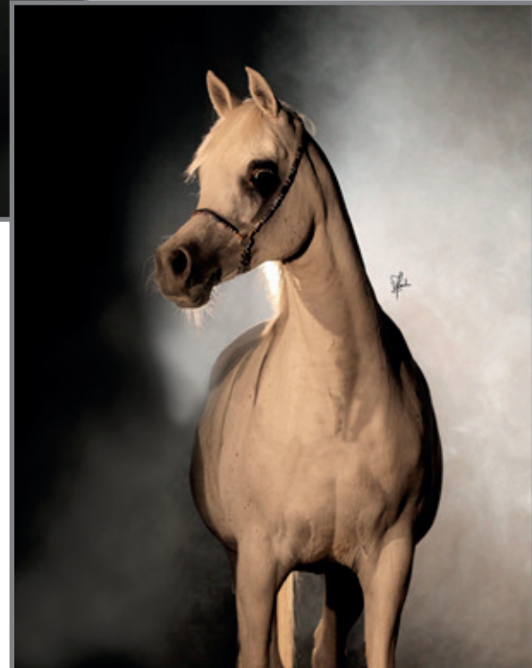
El Thay Konouz (El Thay Mahfouz x El Thay Kamla by El Thay Mashour)