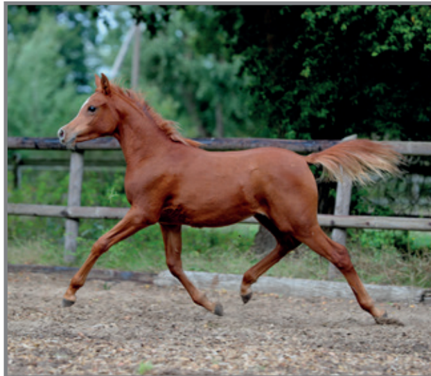
El Thay Mouna Al Ryah (Nader Halim x El Thay Mayassa by El Thay Mahfouz and El Thay Magidaa)

Ajmal Tameen is by Ansata Halim Shah's famous son Ansata Hejazi, while the sire of El Thay Mahfouz, Ansata Selman, is also a son of Ansata Hejazi. The