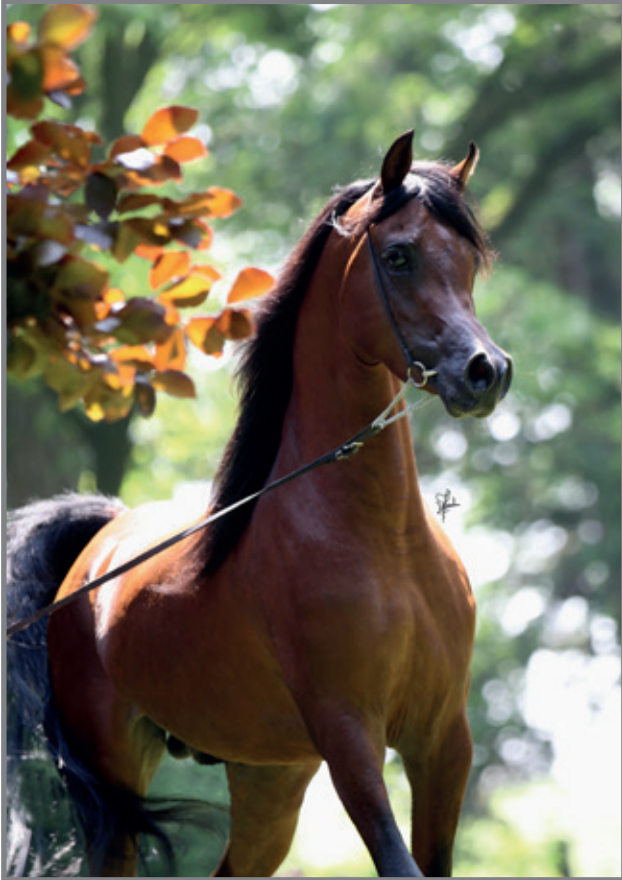
NK Nabhan (NK Nadeer x NK Nerham by Jamal El Dine x NK Nabeelah)

the yearling filly now representing the Mona II family. During the past two years the impressive stallion NK Nabhan (NK Nadeer x NK Nerham by Jamal El Dine and NK Nabeelah) and his exotic sire NK Nadeer (NK Hafid Jamil x NK Nadeera by Adnan and Nashua) have successfully been used. Two very fine and elegant fillies by NK Nabhan were born in 2020 out of El Thay Konouz (El Thay Mahfouz x El Thay Kamla by El Thay Mashour) and out of El Thay Kateefa Al Sabah (El Thay Mahfouz x El Thay Khadija by El Thay Mashour) – both mares are full sisters in blood. NK Nadeer sired a promising colt out of El Thay Munifa (El Thay Mahfouz x El Thay Malakah by El Thay Mashour), born in March 2021.