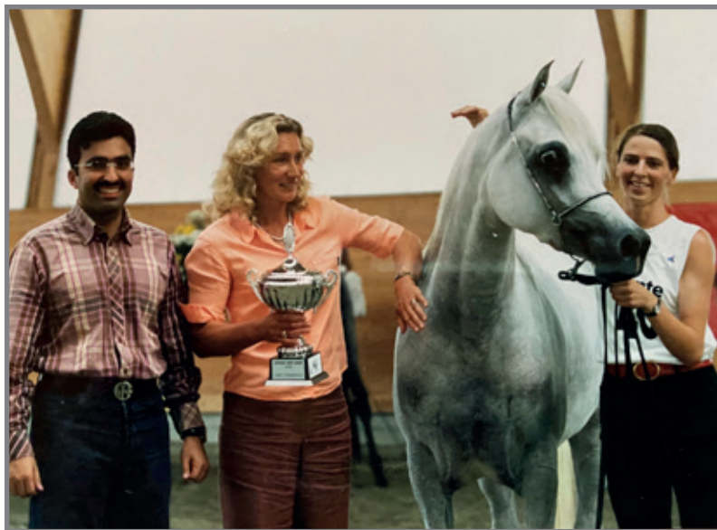
El Thay Bint Kamla (El Thay Mansour x Kamla II by Ansata Halim Shah and Mona III)