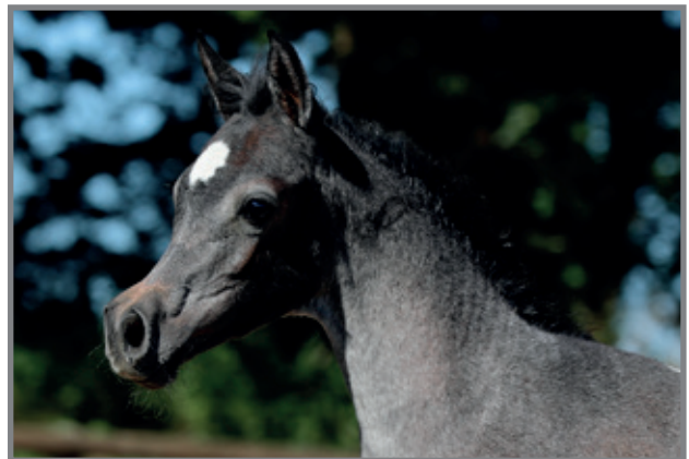
El Thay Kadira Al Sabah (El Thay Kais Al Sabah x El Thay Kenana by Ajmal Tameen and El Thay Konouz)