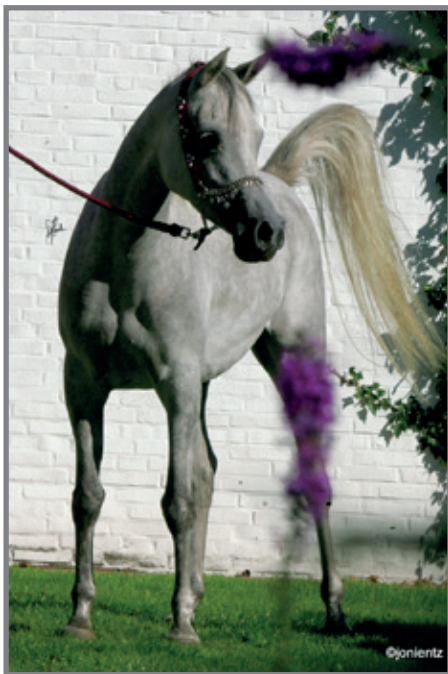
El Thay Kenana (Ajmal Tameen x El Thay Konouz von El Thay Mahfouz a.d. El Thay Kamla)

particular horse in the pedigree, one that I admire or prefer, in order to obtain offspring that is closely related to this particular horse. In my interpretation, this procedure allows many choices: from a very closely related horse in the first or second generation, to horses more distant, or even to horses far distant which are more or less re-introduced into the breeding line.”