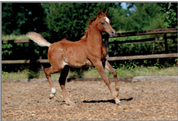
El Thay Kidounah Al Sabah (El Thay Kais Al Sabah x El Thay Kamria by Ansata Selman and Kamia II)