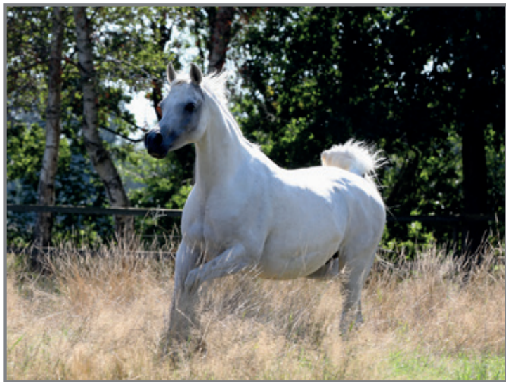
El Thay Munifa (El Thay Mahfouz x El Thay Malakah by El Thay Mashour and El Thay Mahfouza)