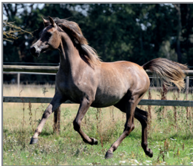
El Thay Kameelah (Nader Halim x El Thay Kareema by Ansata Selman and El Thay Kamla)