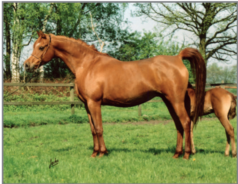
El Thay Mansoura (Machmut x Morawa by Nizam and Momtaza)