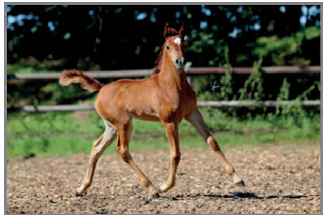
El Thay Kidounah Al Sabah (El Thay Kais Al Sabah x El Thay Kamria by Ansata Selman and Kamla II)