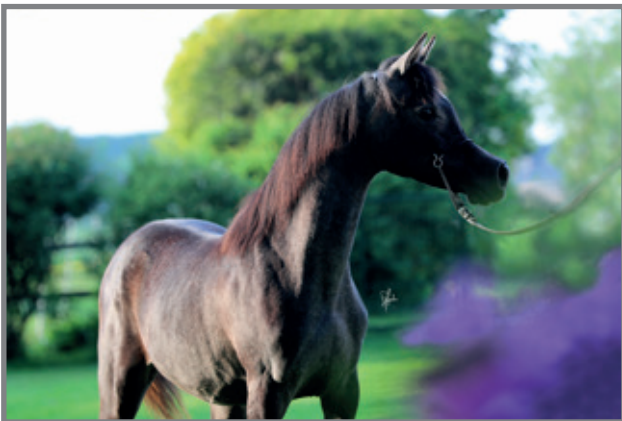
El Thay Kamala (NK Nabhan x El 50.Thay Konouz by El Thay Mahfouz and El Thay Kamla)