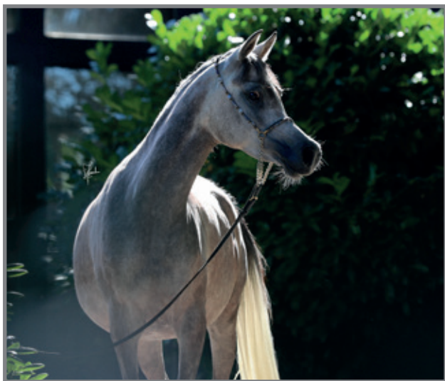
El Thay Minouah (Nader Halim x El Thay Mazyouna by El Thay Mahfouz and El Thay Malikah)

filly is also strongly linebred to Kamla II, who again is by Ansata Halim Shah, showing this stallion's strong influence at El Thayeba.