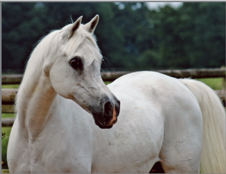
Kamla II (Ansata Halim Shah x Mona III by Hadban Enzahi and Moheba II) - back to Moheba, bred by El Zahraa