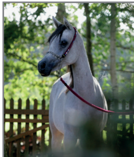
El Thay Marwa (El Thay Karim Shah x El Thay Malikah by Ansata Selman and El Thay Mashoura)