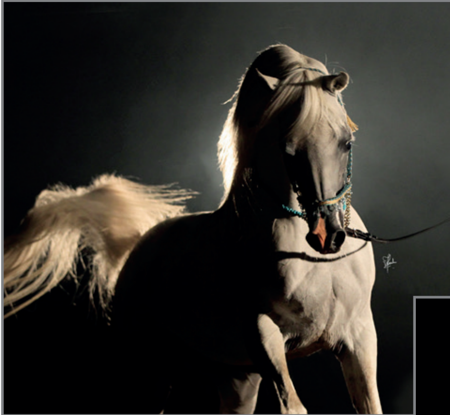
El Thay Mahfouz (Ansata Selman x El Thay Mahfouza by El Thay Ibn Halim Shah and El Thay Mansoura)