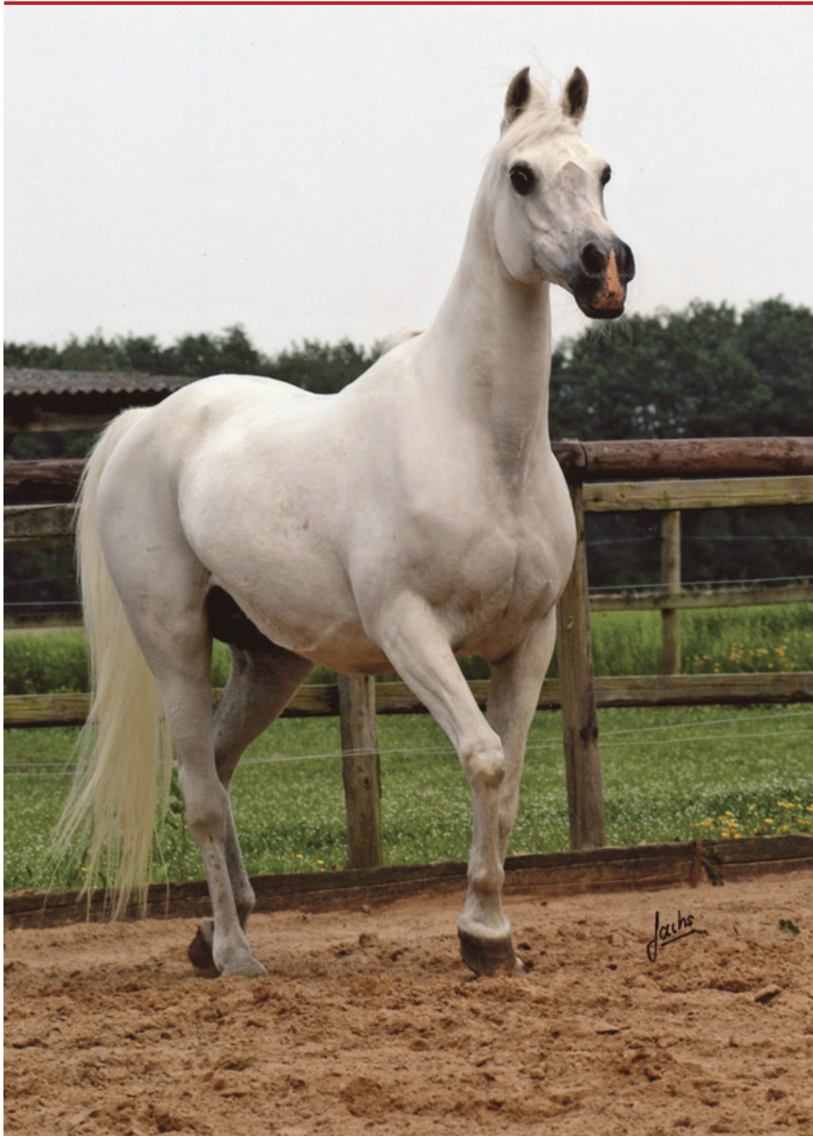
Kamla II (Ansata Halim Shah x Mona III by Hadban Enzahi and Moheba II) founded her own dynasty and became very important for the breeding program of El Thayeba Arabians