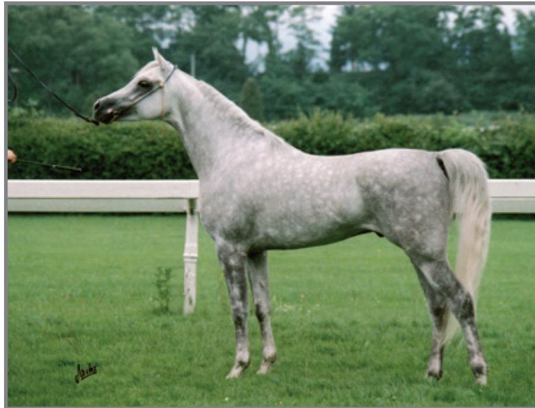
El Thay Ibn Halim Shah (Ansata Halim Shah x Mahameh by Ibrahim and Mona III)