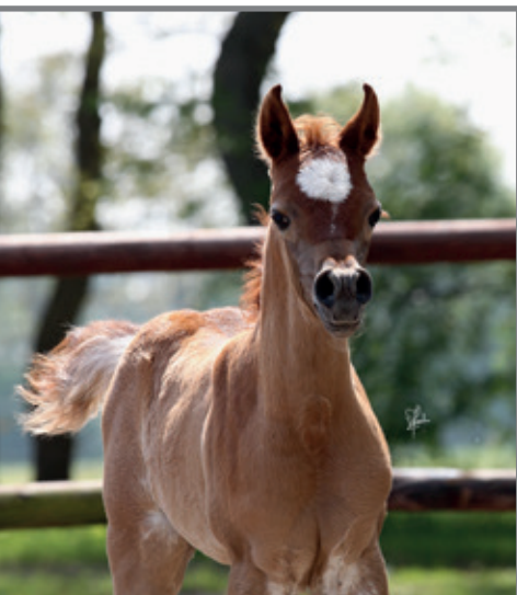
El Thay Malaki (El Thay Karim Shah x El Thay Munifa by El Thay Mahfouz and El Thay Malakah)

Thay Mahfouz), a very typey bay stallion with splendid movements. His first foals were born in 2020, among them a very fine filly out of El Thay Kenana. This filly is double Ajmal Tameen and double El Thay Mahfouz.