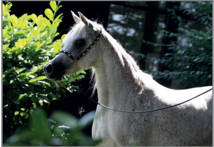
El Thay Kamria (Ansata Selman x Kamla II by Ansata Halim Shah and Mona III)

Madinah (by Ibn Galal), the dam of Imperial Madheen and Mesoudah - M, was a great mother of stallions. Her only daughter that was retained, El Thay Magidaa (by El Thay Mameluk), also produced a surplus of colts. Her best daughter, El Thay Mayassa, did the same and