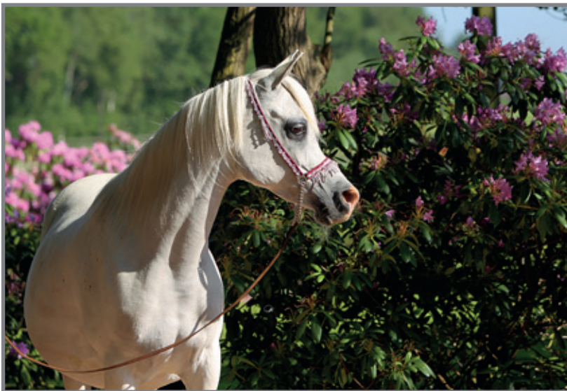
El Thay Malikah (Ansata Selman x El Thay Mashoura by El Thay Mashour and El Thay Bint Mofeedah)