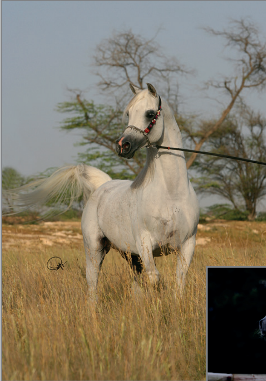
Ansata Selman (Ansata Hejazi x G Shafaria by Prince Fa Moniet and Ansata Sharifa)