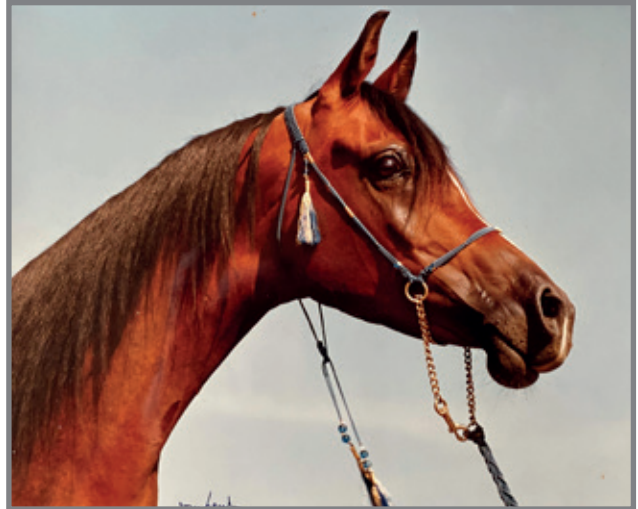
Taghreed (Shaarawi x Naama by Anter and Bint Maysouna) bred by El Zahraa

x Mahiba) and Tamara (Jamil x Taghreed), full sister to European and World Champion mare Tiffaha, who were later joined by Tamara's dam Taghreed (Shaarawi x Naama). Tamara's family still continues at El Thayeba today through one of its best mares, El Thay Toya.