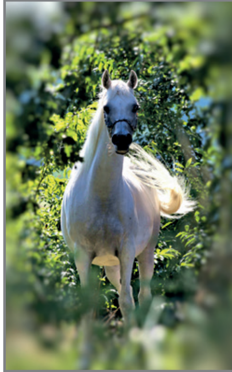
El Thay Mazyouna (El Thay Mahfouz x El Thay Malikah by Ansata Selman and El Thay Mashoura.

However, El Thay Mayassa, after being sold, suddenly switched to producing fillies, and one of her daughters, El Thay Mouna Al Ryah by Nader Halim has now returned to El Thayeba and it is hoped that she will be able to revive the family.