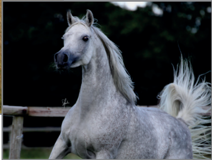
El Thay Kareema (Ansata Selman x El Thay Kamla by El Thay Mashour and Kamla II)