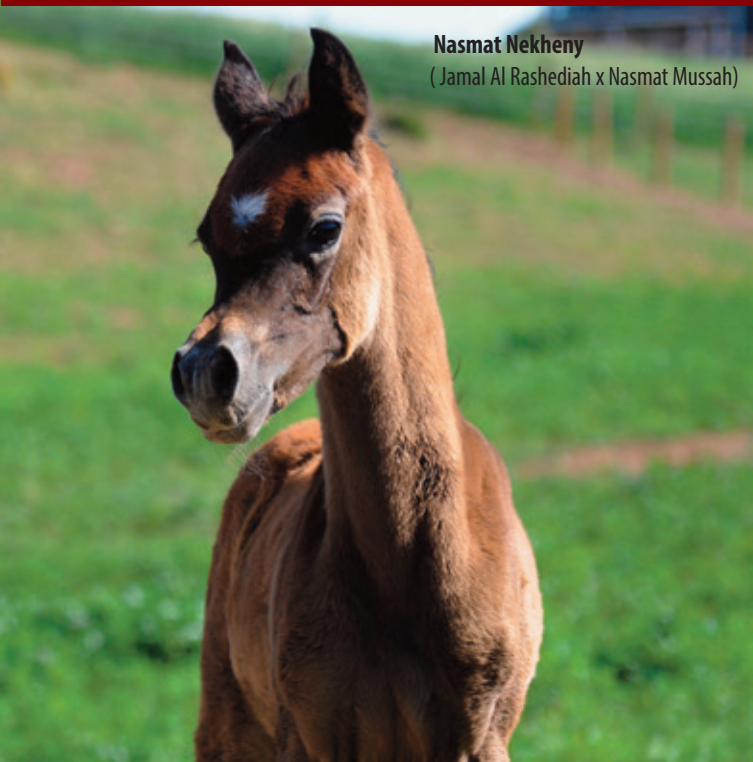
Nasmal Nekheny (Jamal Al Rashediah x Nasmal Mussah)