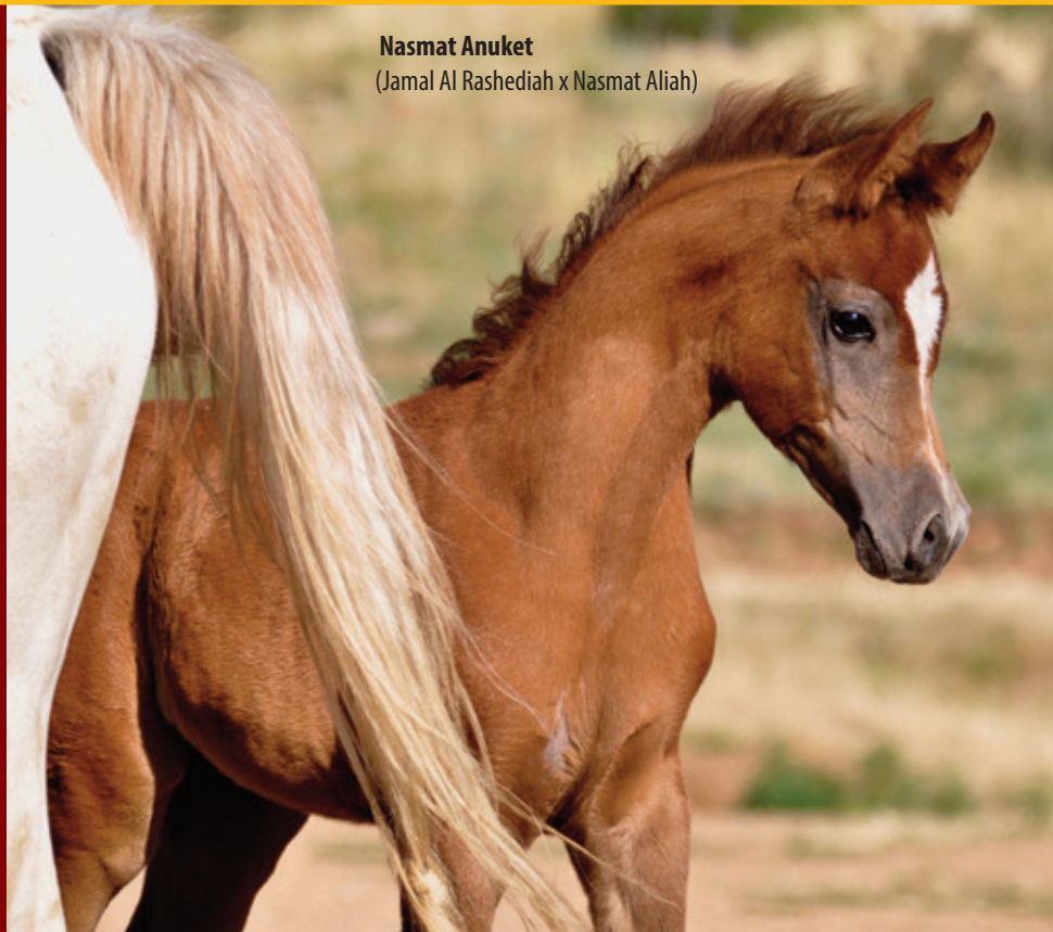
Nasmat Anuket (Jamal Al Rashediah x Nasmat Aliah)