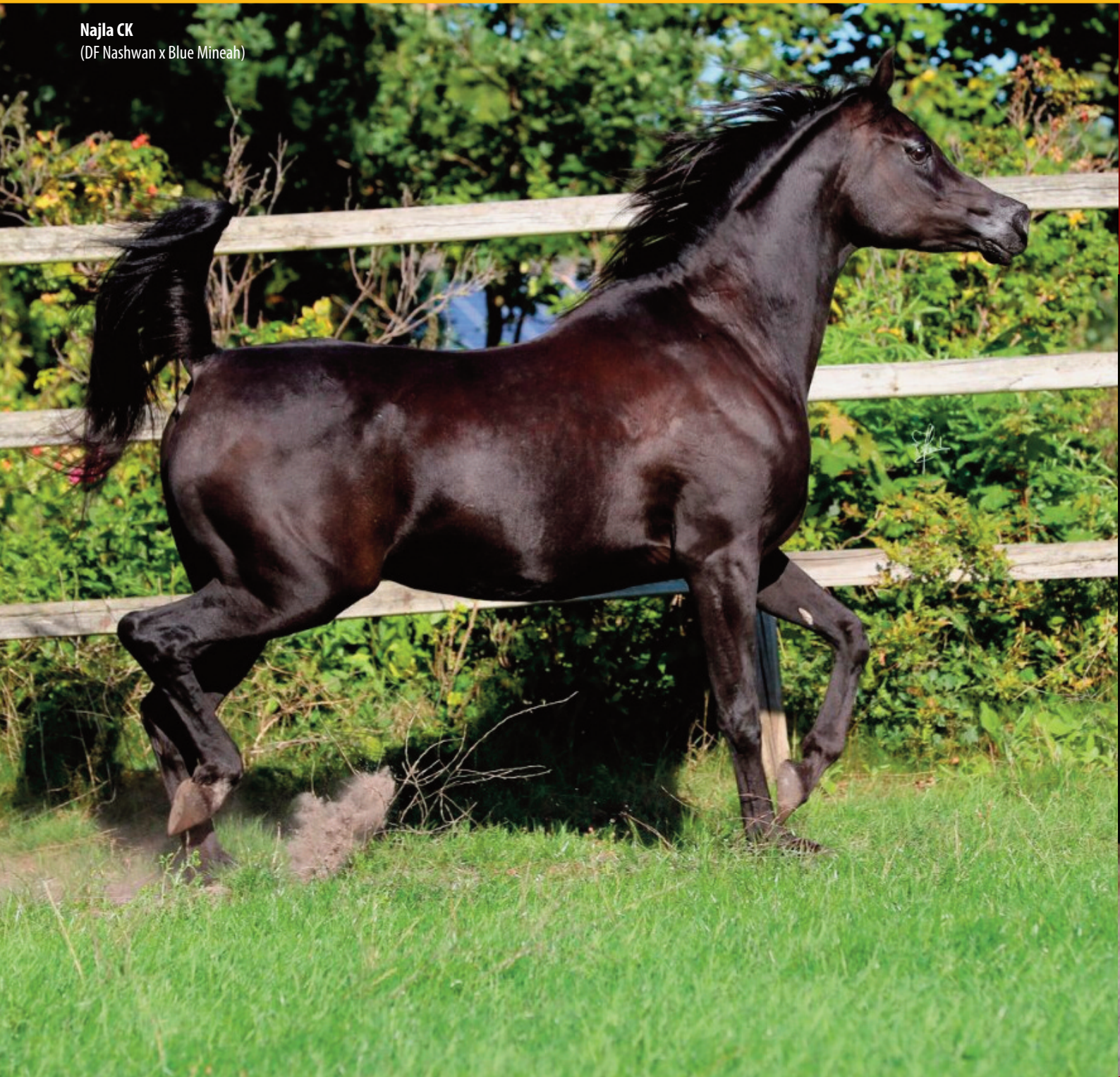
Najla CK (DF Nashwan x Blue Mineah)

a bit of a logistical issue for me, and I want to send the right mares of course. I bred my black DF Nashwan daughter to NK Nizam and waiting to hear on that breeding. My mare Nesma El Mabrouka by Ajmal Tameen has been bred to NK Jamal El Dine and I am waiting to hear if she will be pregnant. I also have used stallions such as DF Nashwan and DF Malik Jamil to try to incorporate some of the NK Hafid Jamil blood