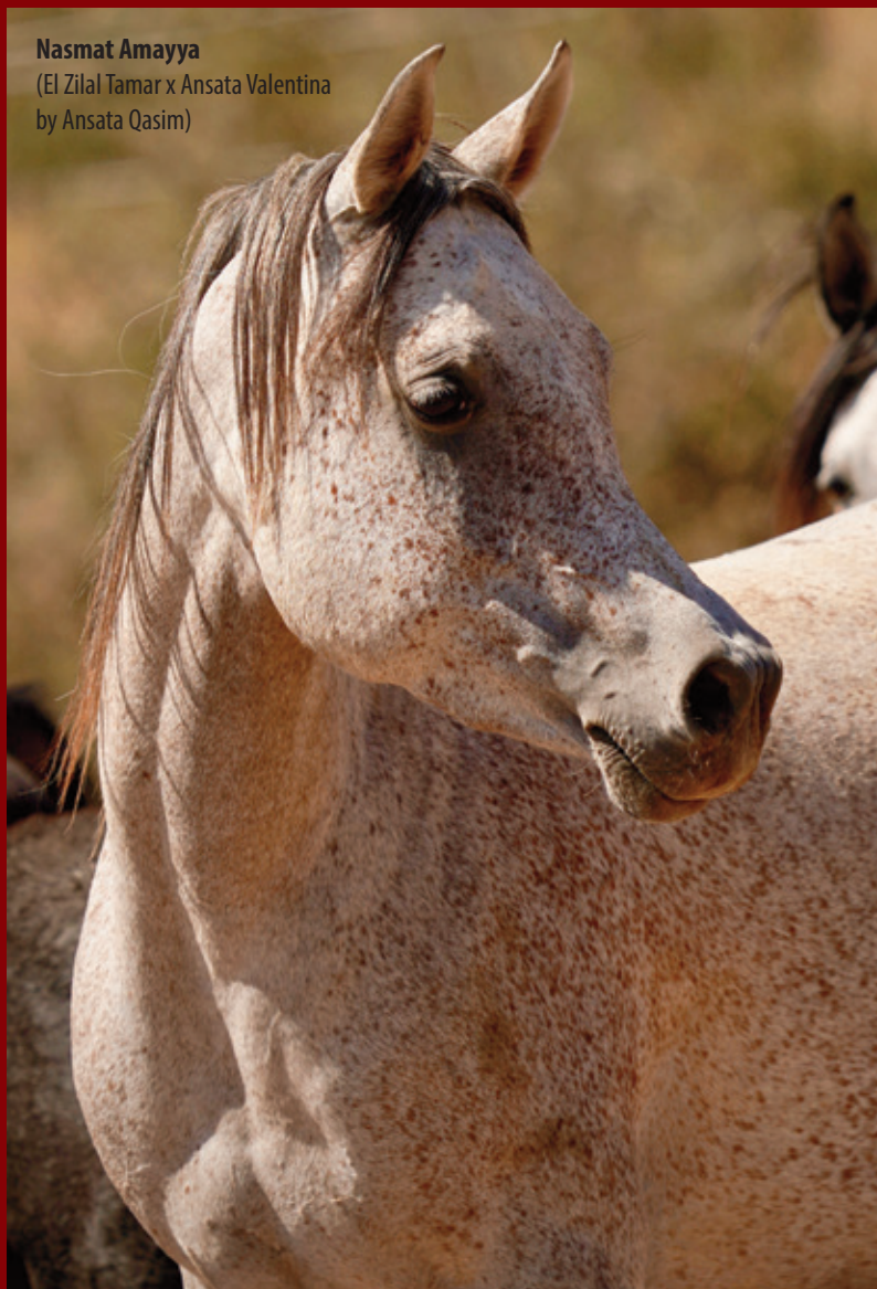
Nasmal Amayya (El Zilal Tamar x Ansata Valentina by Ansata Qasim)

produces a certain type with some of the closer Ansata blood, and produces beautifully with more open Straight Egyptian pedigrees mares. Between outside breedings and breedings here at home, Jamal had nine offspring in 2021, five fillies and four colts. I will be preparing frozen semen from Jamal to ship to Israel and South Africa in the coming months.