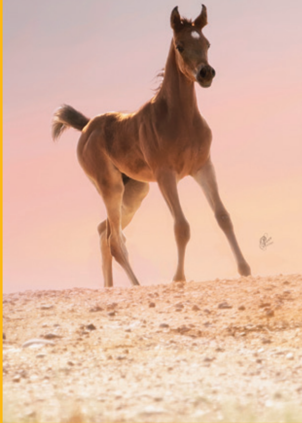
Nasmat Nemty (NK Nabhan x Al Ilah Taghria)