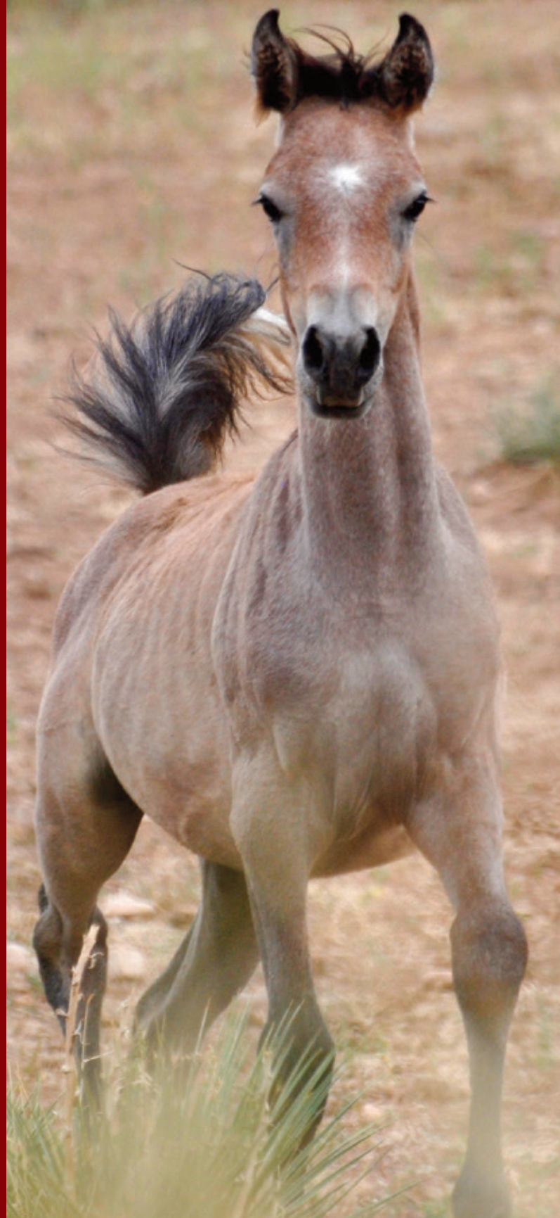
Nasmat Nekheny (Jamal Al Rashediah x Nasmat Mussah)

Having said that about shows, I loved the Noble Festival 4 years ago in Holland, it was an amazing way to see the visions of different breeders and display their work. It was nice to see the different but signature looks each breeder was representing. I would love to have a showcase like this in the USA for breeders.