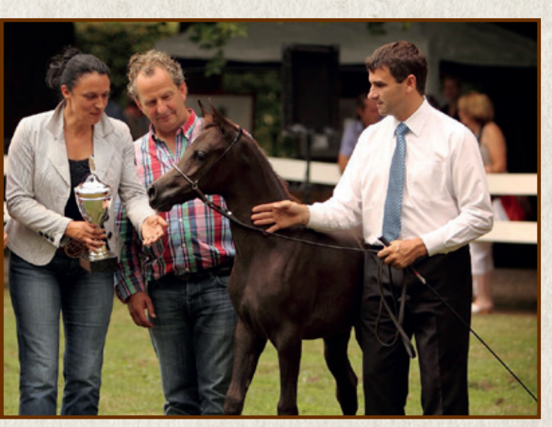
La Diva Nile-La (Ansata Nile-Echo x CD Anasta) as foal at the Egyptian Event Lanaken in 2012.