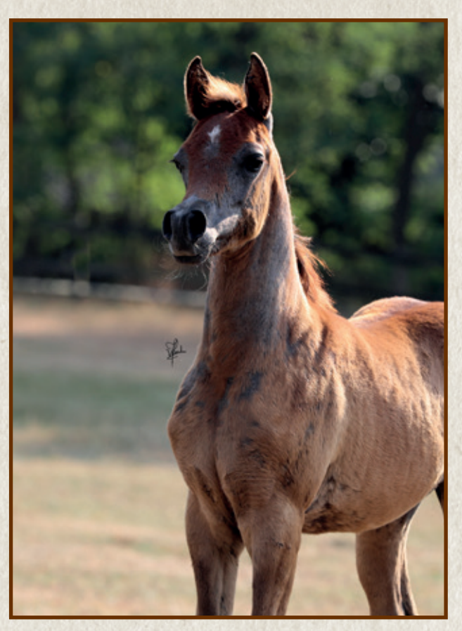
Al Qusar Madiba (NK Nizam x Masarah Al Qusar).

Paul: "There is no real reason to do embryo transfers. We breed in generations and want to be able to judge the result of each mating accurately and also learn from it for the future. In my opinion, industrialized animal reproduction has no place in our breeding. It is not about producing a lot of horses for the market, but about selective breeding of chosen horses that are worth the good reputation of the Arabian. We have the responsibility for that when we have Arabian horses in our stables and breed with them."