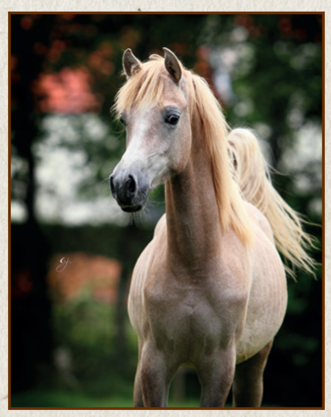
La Diva Baha ( Shael Dream Dessert x CD Anasta) went to China.