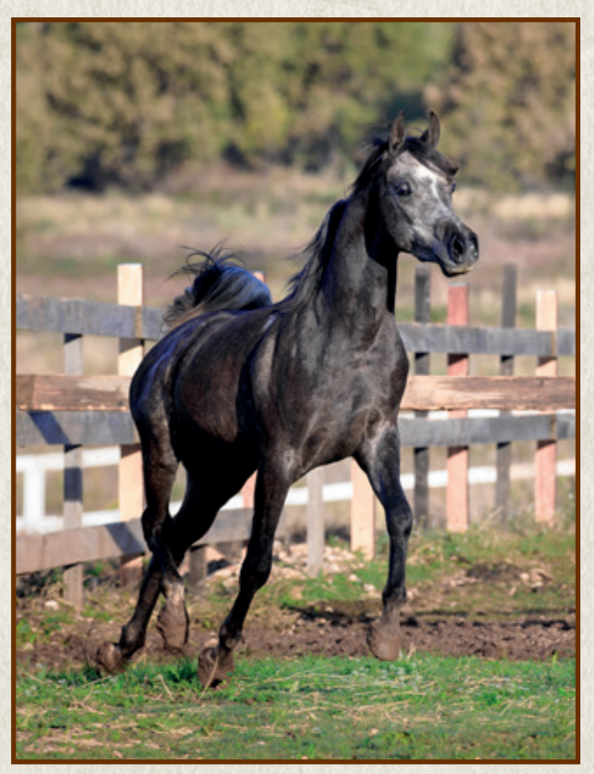
La Diva Omar (Ansata Nile-Echo x CD Anasta) went to DG Arabians Albania.