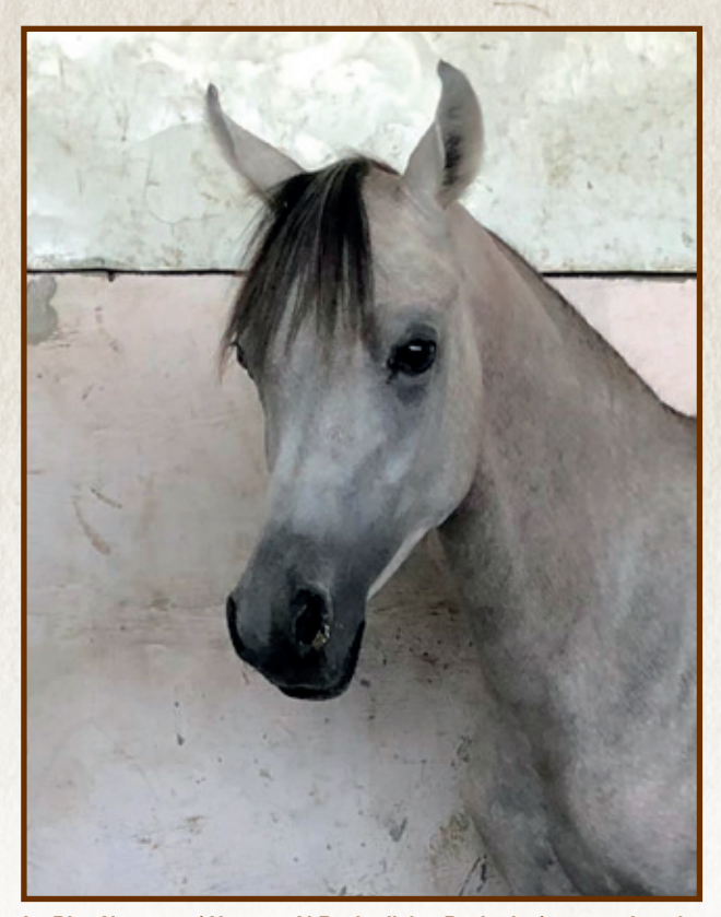
La Diva Naseema ( Naseem Al Rashediah x Pashmina) went to Israel.