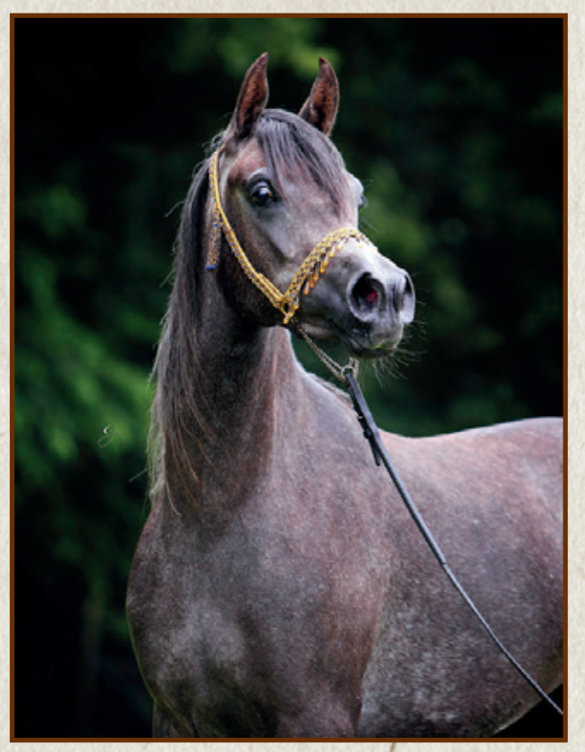
La Diva Safina (Ansata Nile-Echo x CD Anasta) went to Saudi Arabia.