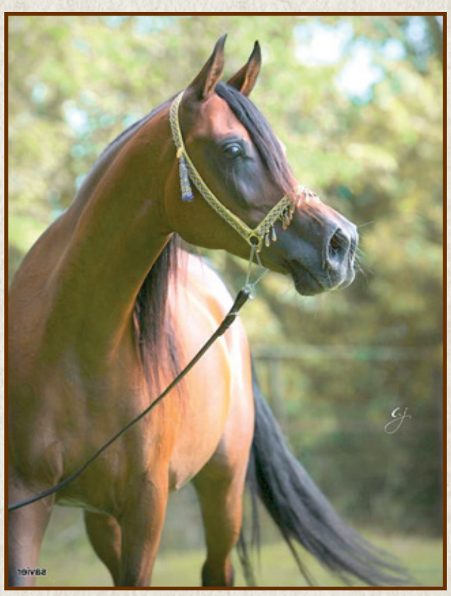
CD Anasta (Safeen x Qublah).