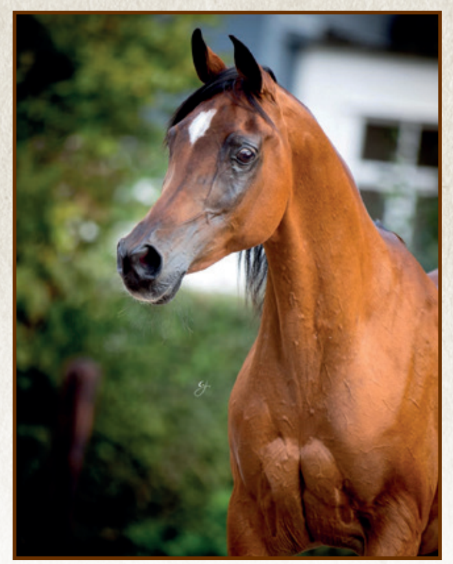
Pashmina (Salaa El Dine x A Little Passion).