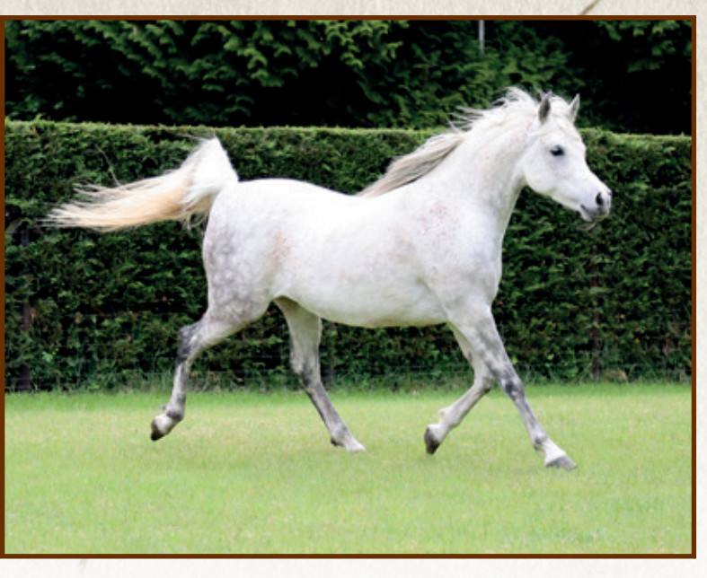
La Diva Nile-La (Ansata Nile-Echo x CD Anasta).