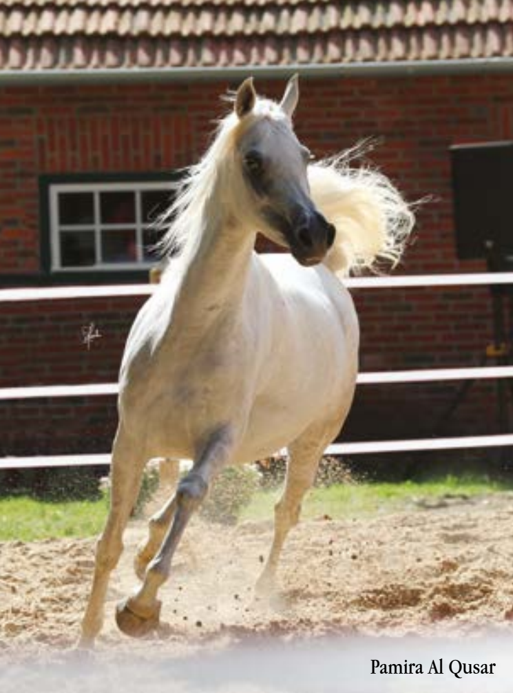
Pamira Al Qusar