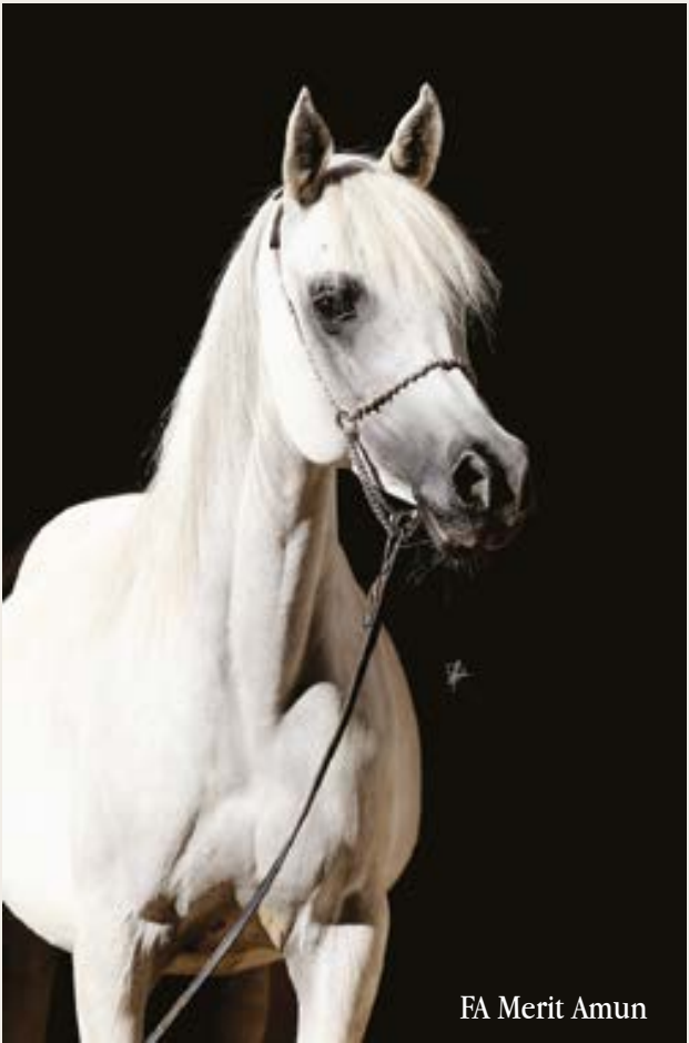
FA Merit Amun