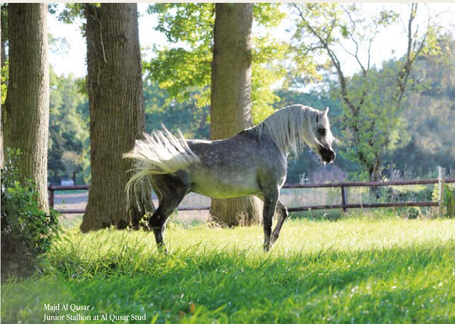
Majd Al Qusar Junior Stallion at Al Qusar Stud