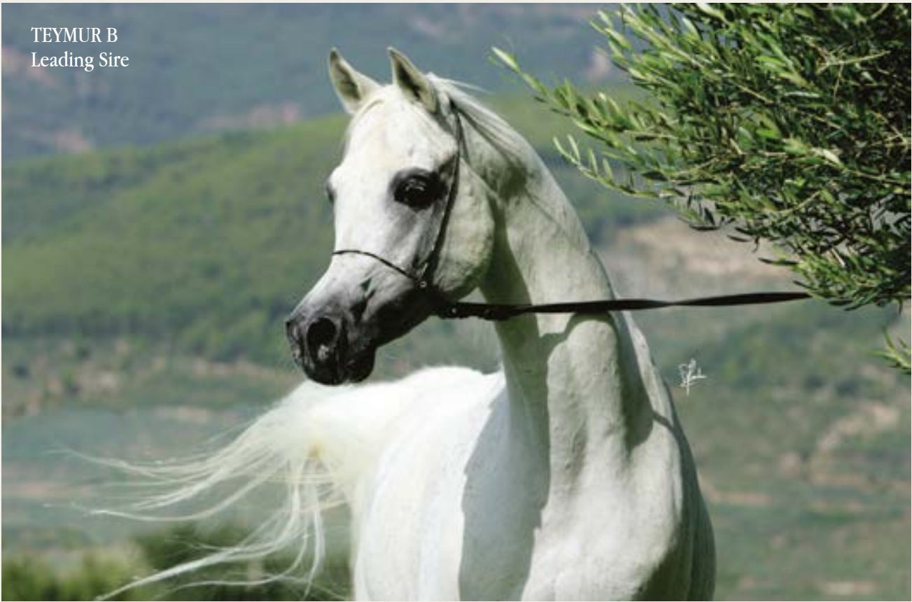
TEYMUR B Leading Sire