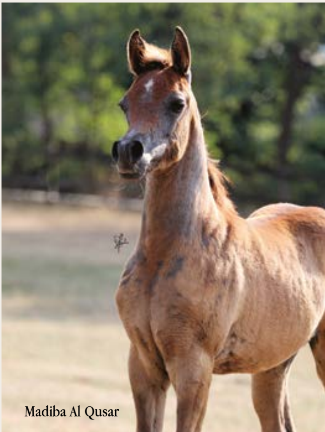
Madiba Al Qusar