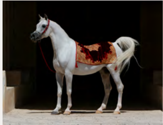
Al Adeed Al Shaqab

Ansata Hejazi (by Ansata Halim Shah) produced International Champion Jalila Al Rayyan and two full brothers. First son being Farres Al Rayyan who has two daughters of breeding age at Al Rayyan: Rubi Al Rayyan and Menouah Al Rayyan.