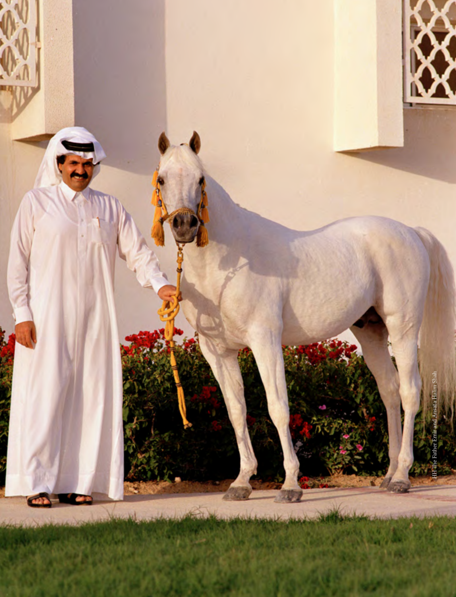
HH The Father Emir and Ansata Halim Shah