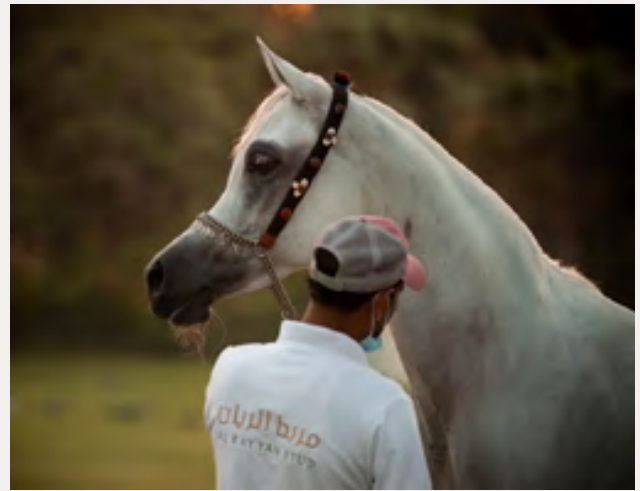
Sudari Al Rayyan