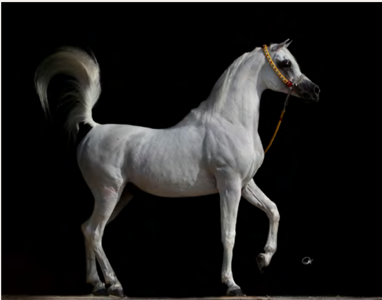
Ashhal Al Rayyan

THE MOST CONSIDERABLE SUCCESS FOR THE BREEDING PROGRAM OVER THE FOLLOWING DECADE 2000 – 2012, WAS CROSSING BACK TO ANSATA HALIM SHAH WITH DIFFERENT DAM LINES.