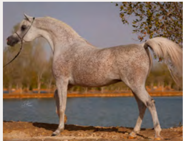
Fares Al Rayyan

Second son being Ansata Selman left one good-producing daughter named Mamlukah Al Rayyan. Ansata Nile Echo (Ansata Hejazi x Ansata White Nile), owned by Al Naif Stud, sired Wadha Al Rayyan, Furat Al Rayyan and Lamaar Al Rayyan.