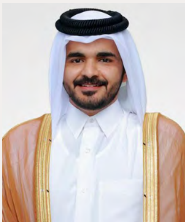
HE Sheikh Joaan bin Hamad Al Thani