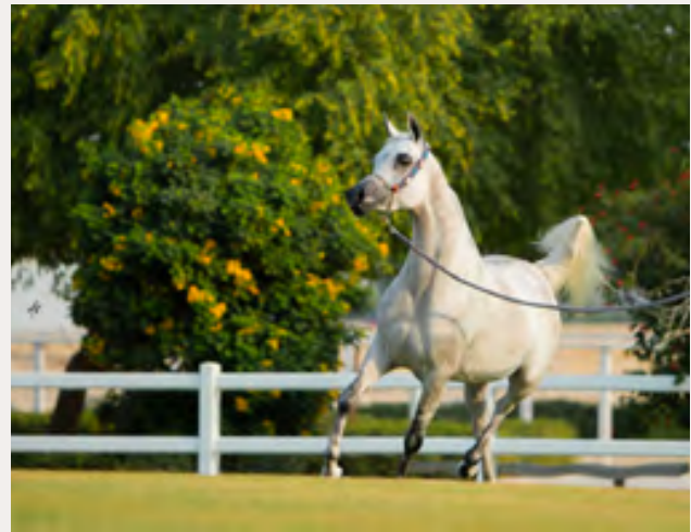
Amjaad Al Rayyan

has three daughters at the farm: Marwa Al Rayyan (by Sinan Al Rayyan), Hilalah Al Rayyan (by Farhoud Al Shaqab) and Ameera Al Rayyan (by Al Adeed Al Shaqab), in addition to Marwa's daughter Amani Al Rayyan (by Farhoud Al Shaqab).