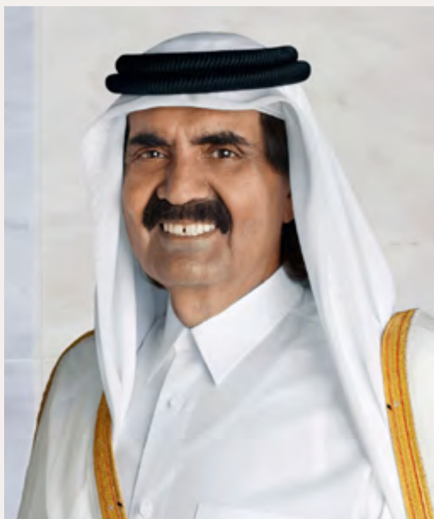
HH The Father Amir Sheikh Hamad bin Khalifa Al Thani

Those who think they know a story often only know its end. To get to the heart of it, however, you must start at the very beginning, therefore I will begin with the history of Al Rayyan.