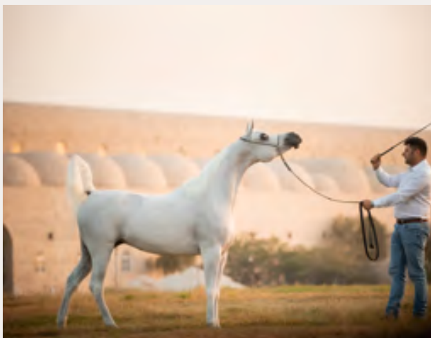
Menouah Al Rayyan