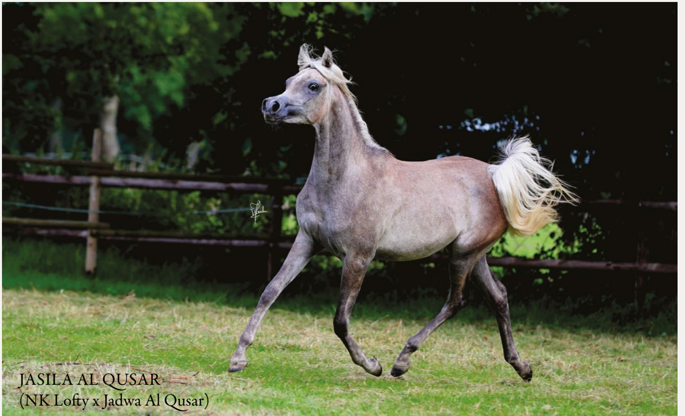
JASILA AL QUSAR (NK Lofty x Jadwa Al Qusar)