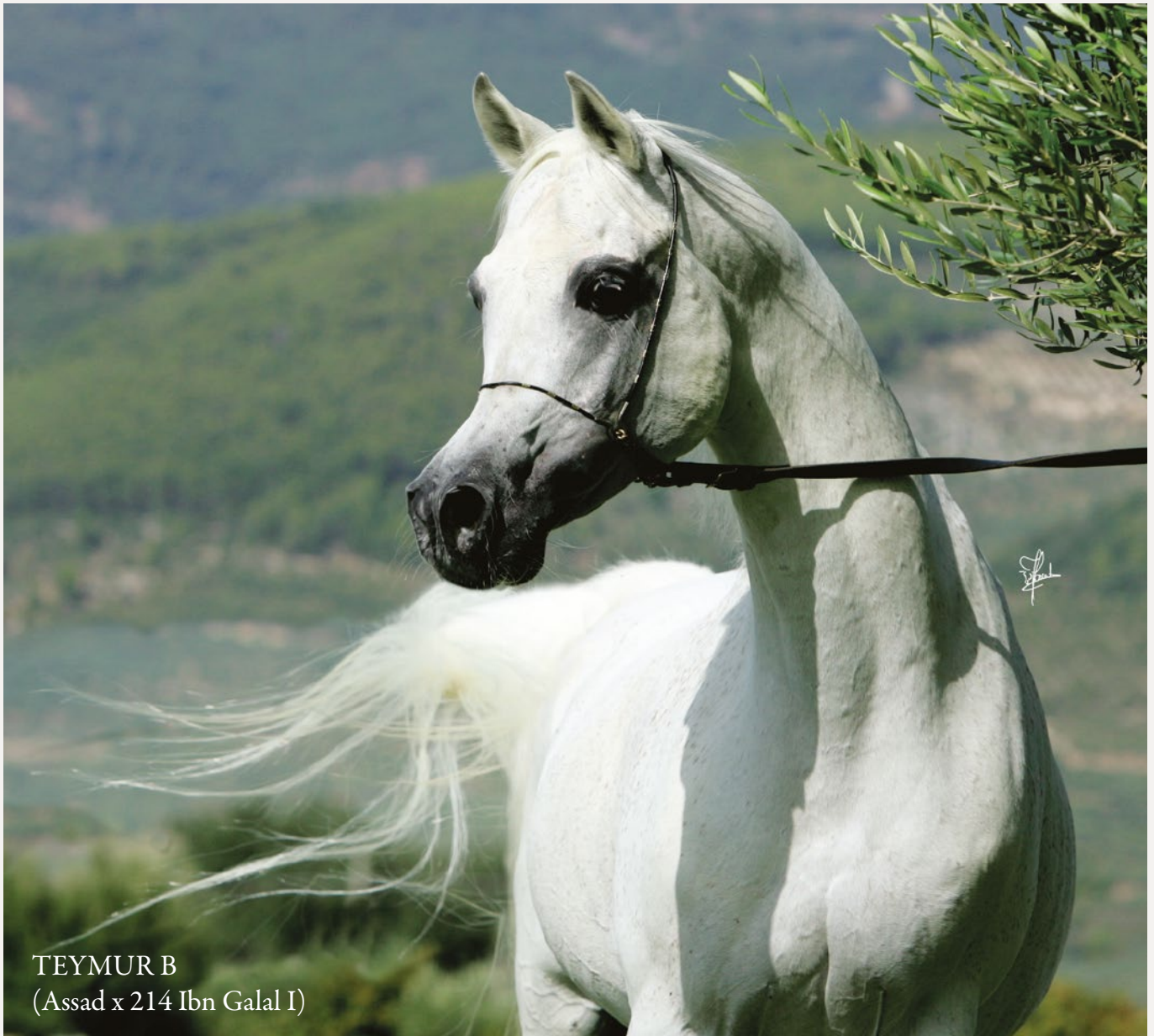
TEYMUR B (Assad x 214 Ibn Galal I)

Teymur B, a stallion from the Dahman Shahwan line, went back to the famous Tamria (Tuhotmos x Kamar), who had been imported from the Egyptian State Stud El Zahraa and established one of the most successful mare lines in the Hungarian State Stud.