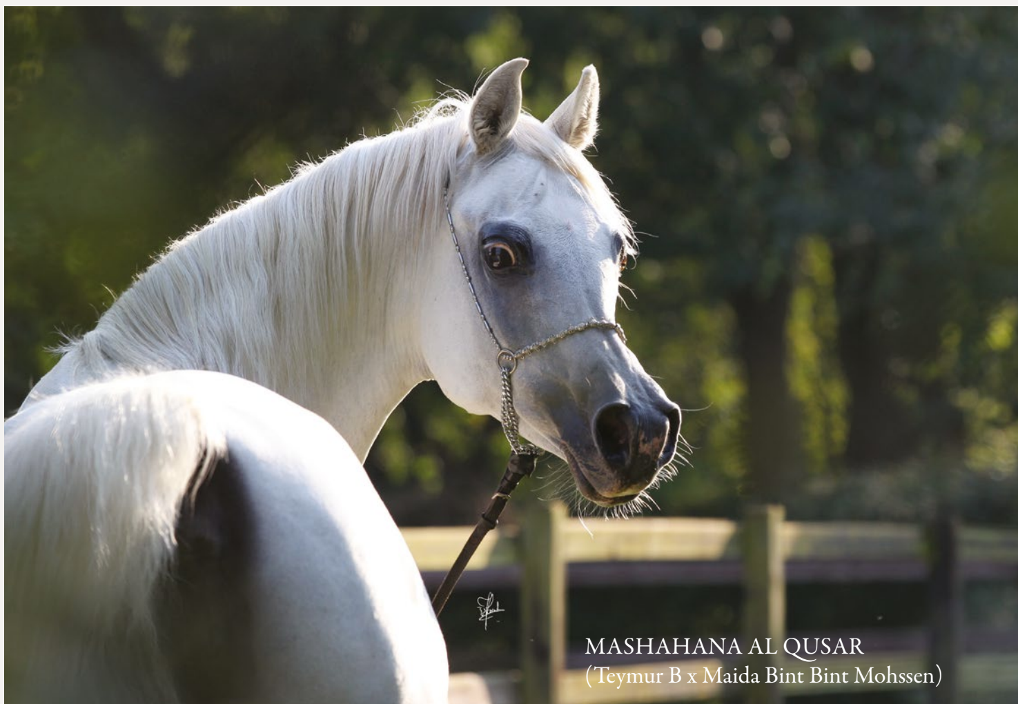
MASHAHANA AL QUSAR (Teymur B x Maida Bint Bint Mohssen)