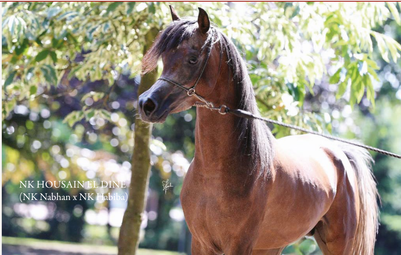
NK HOUSAIN EL DINE (NK Nabhan x NK Habiba)