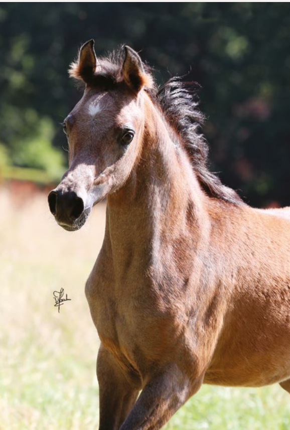
AUTHENTIC NADIRAH (Majd Al Qusar x FA Nefilim)