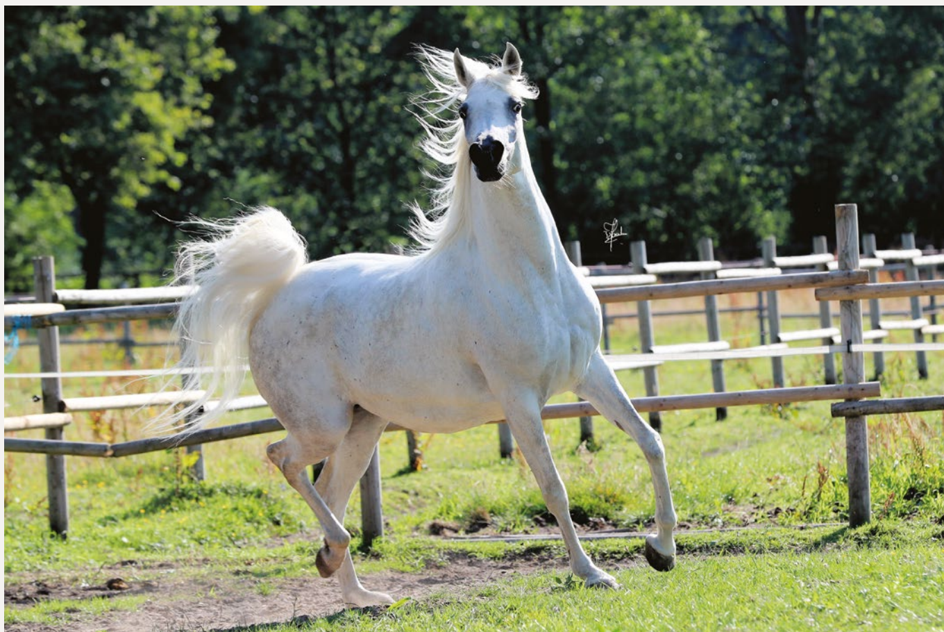
PAMINA AL QUSAR (Teymur B x Ansata Princessa)