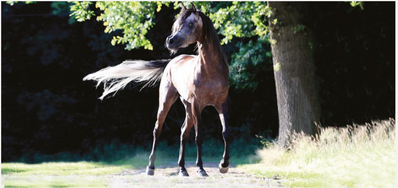
NK HOUSAIN EL DINE (NK Nabhan x NK Habiba)