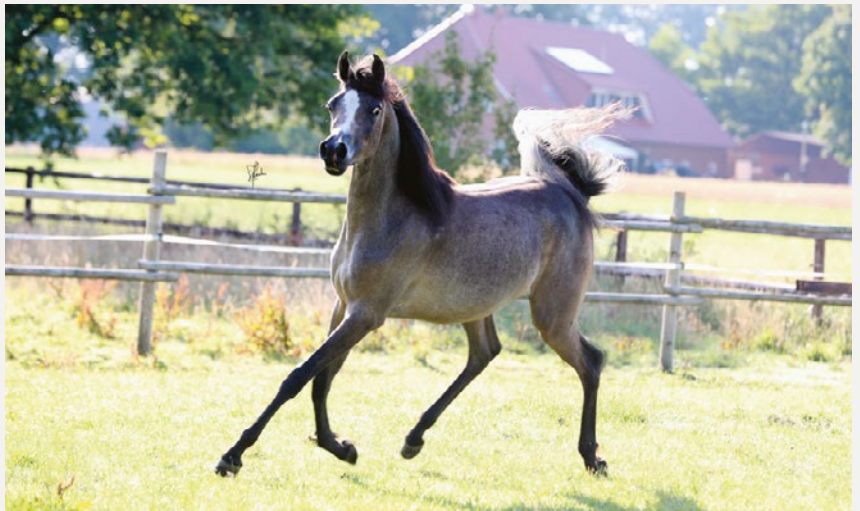
NK LUNAA (Majd Al Qusar x NK Lilly)