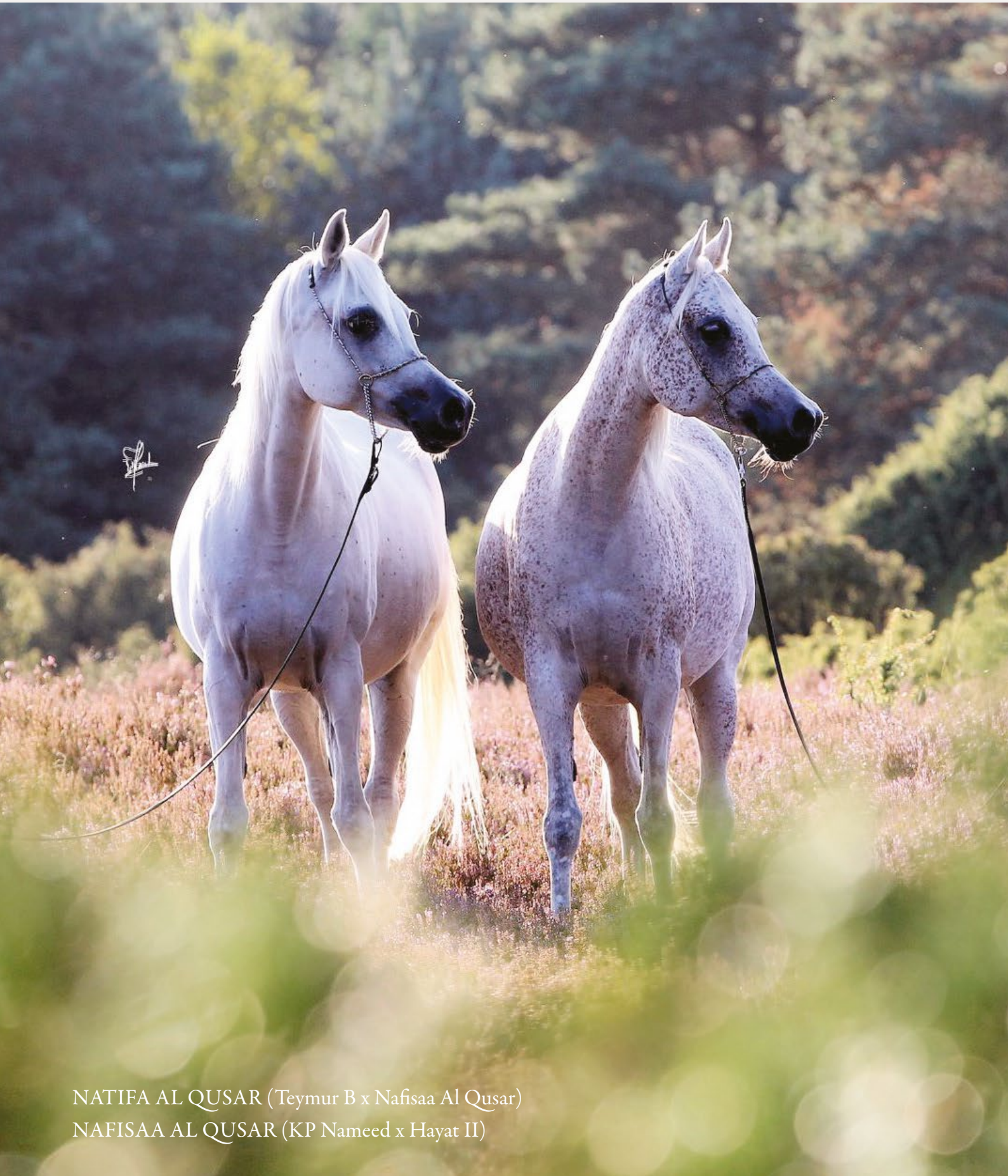
NATIFA AL QUSAR (Teymur B x Nafisaa Al Qusar) NAFISAA AL QUSAR (KP Nameed x Hayat II)