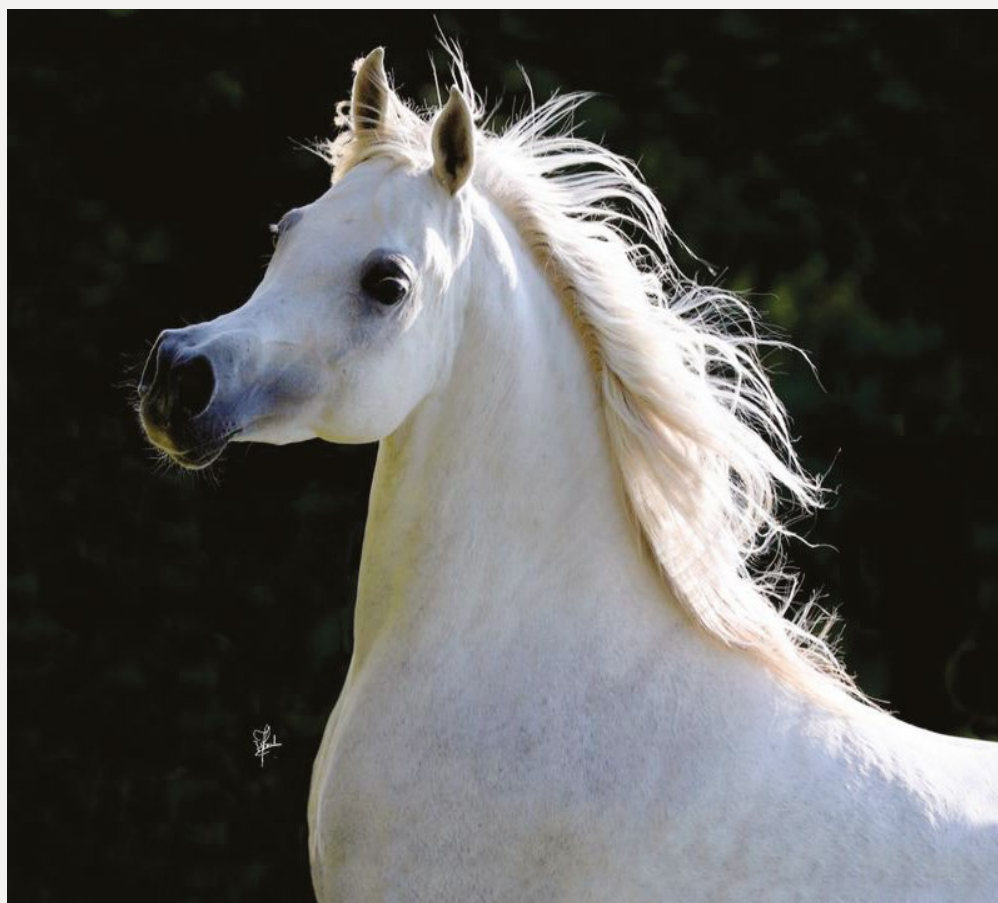
FA NEFILIM (FA Medu Neter x Nadirah El Shah) started another DS mare line in the stud through AK Nawal