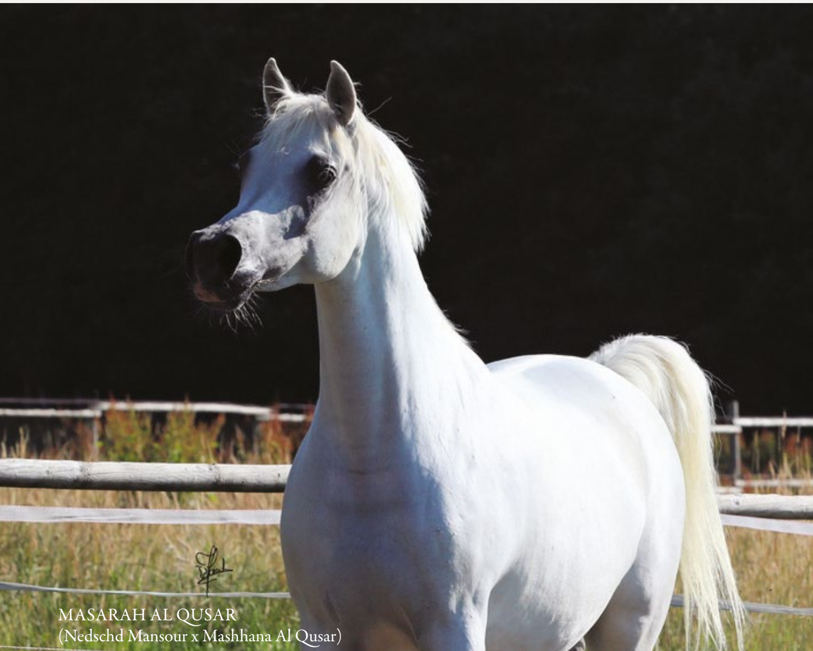
MASARAH AL QUSAR (Nedschd Mansour x Mashhana Al Qusar)

foundation mares from the Ansata breed were added, such as Ansata Queen Nefr and the Ansata Ibn Halima granddaughters Bagdady and the black G Ashalima. Not only the Dahman Shahwan line of Tamria, also the Saklawi Jedran Ibn Sudan line became part of the breeding concept through the mares El Thay Bint Maheera and Naafisa. Both had their origin in the Ansata breeding and their 4th generation offspring can be seen at the stud today.