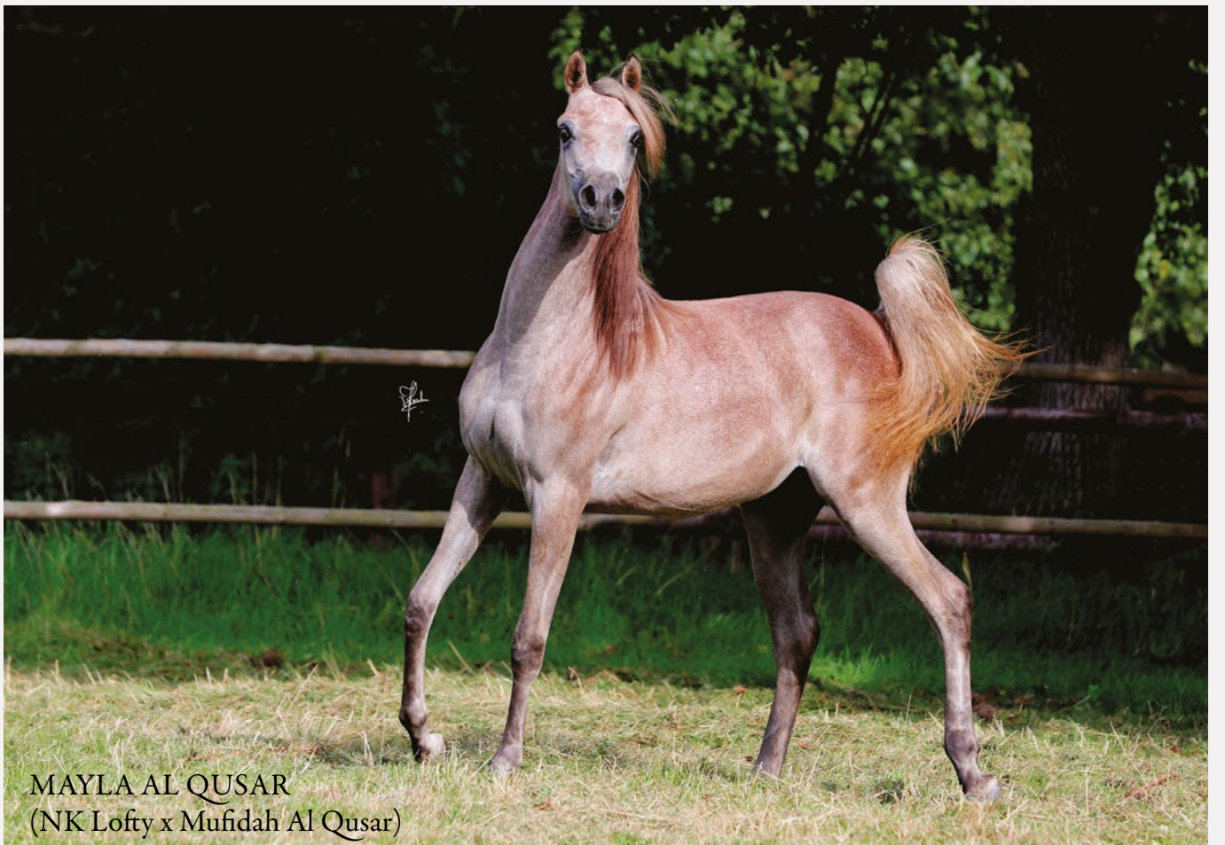
MAYLA AL QUSAR (NK Lofty x Mufidah Al Qusar)