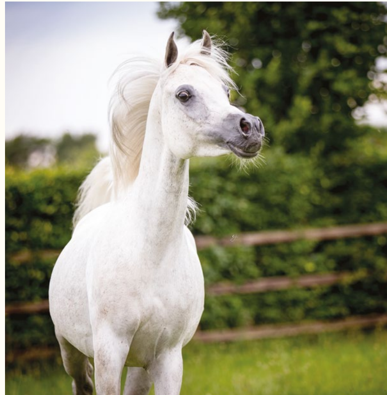
SERENE ISIS (Ibn Nejdy x Serene Carima by Salaa El Dine)