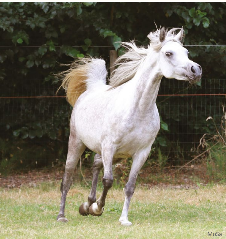
LA DIVA NILE-LA Ansata Nile Echo x CD Anasta)