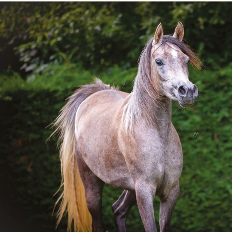
AL QUSAR MADIBA (NK Nizam x Masara Al Qusar)

possible in breeding. It is more important to create a typey overall picture than to breed only extreme heads with long necks. In addition, the loving and