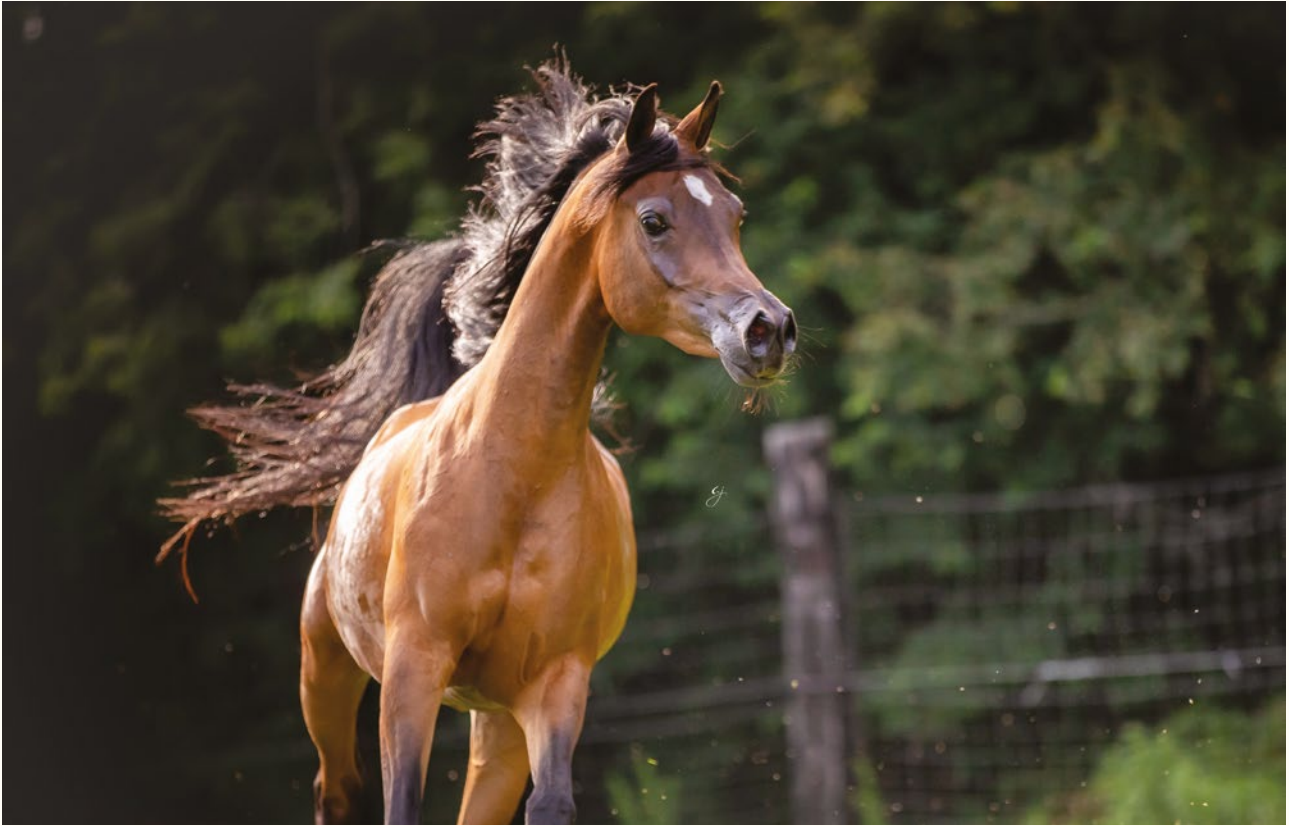
GJ AMIRA DEENAA (Naseem Al Rashediah x Pashmina)

co-operative character of most Straight Egyptians plays a major role, which we want to preserve. Overall, our Arabians should be beautiful but have the character of a Bedouin Arabian that you could take into your tent during a sandstorm without panicking.