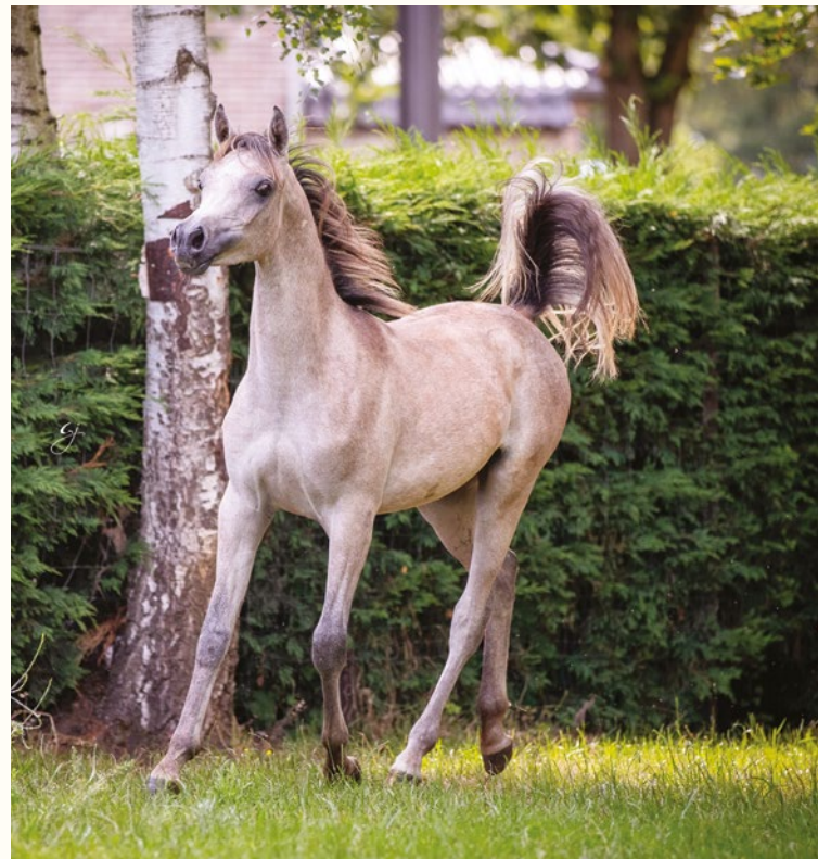
LA DIVA KALIL (Al Ghazi Al Rashediah x El La Diva Nile-la)