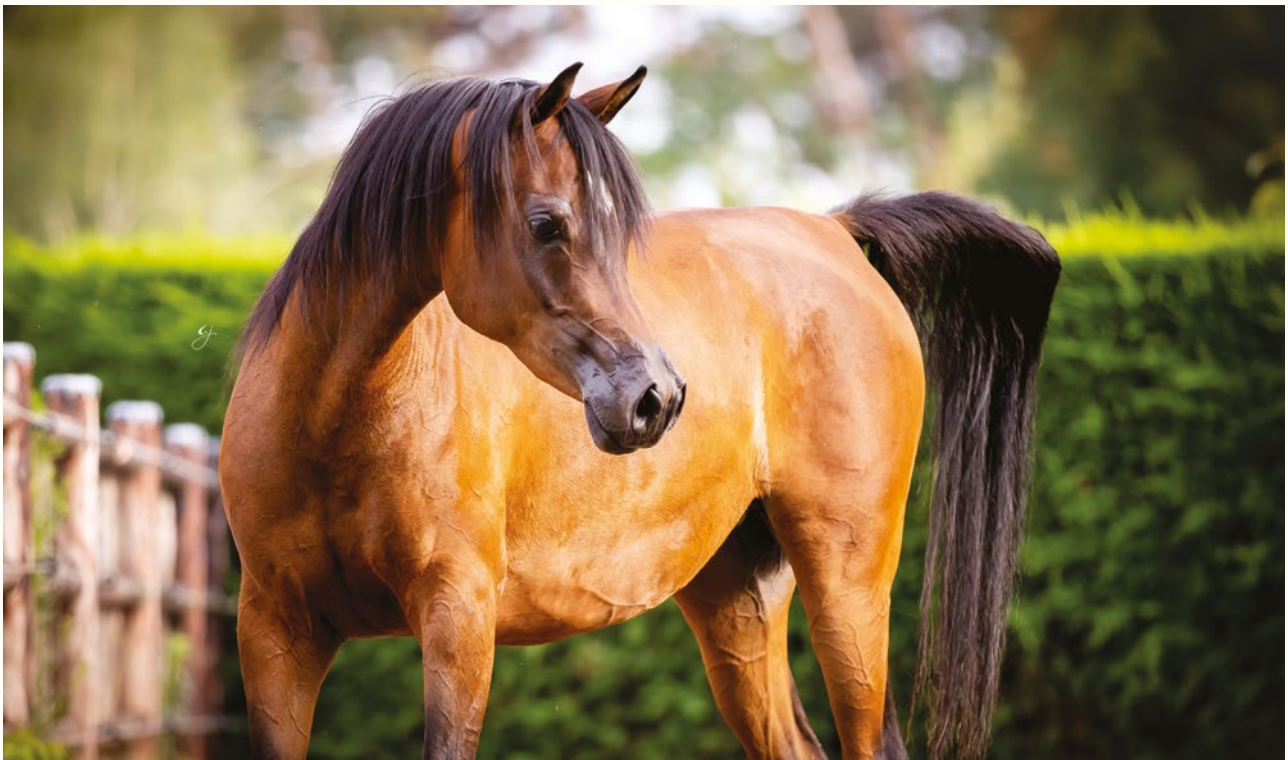
GJ AMIRA DEENAA (Naseem Al Rashediah x Pashmina)