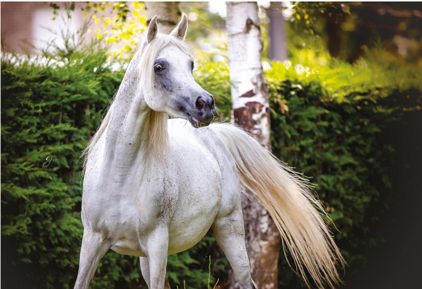
LA DIVA NILE-LA (Ansata Nile Echo x CD Anasta)

Paul: The invention of frozen semen catapulted Arabian horse breeding into the middle of the globalised world. Stallions could be used from anywhere. There was hardly any experimentation with own horses, because the superiority of the global show champions was too great. In principle, the whole reproduction process has changed. This also includes embryo transfer and in-vitro reproduction. Today it seems as if nothing is impossible any more. There is a technical or hormonal solution for every problem with mares or stallions. This is very expensive today, because nature has been largely replaced by veterinary medicine in breeding over the last 20 years.