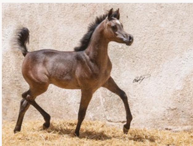
FADEL AL HAMD out of Fayrouz Al Hamd