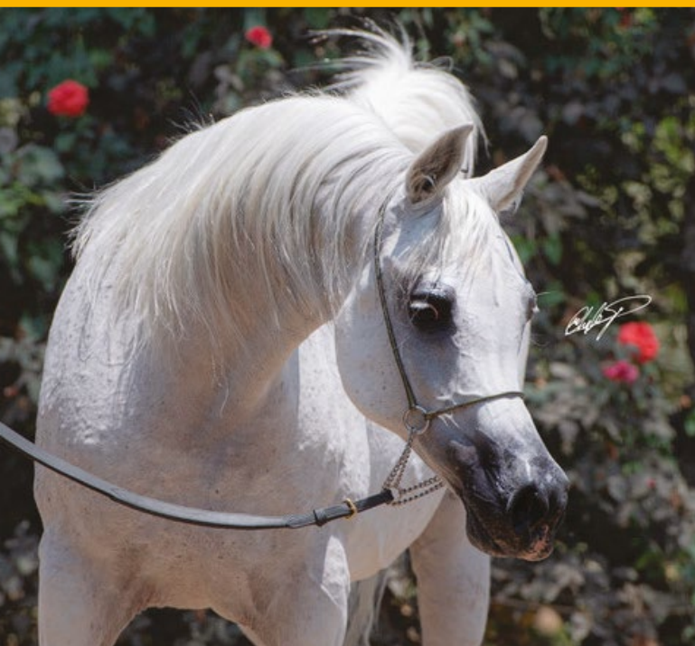
ZOMORODA AL HAMD (Ibn El Basha Hamadan A x Shahd Al Hamd)