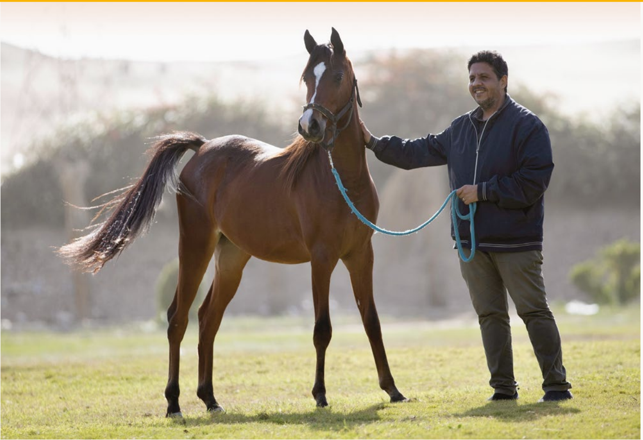
GHAZAL AL-HAWADY (Deffaf EAO x Gharam Alhaday)

practices, emerging technologies, and the ongoing efforts to preserve the purity and qualities of the SE Arabian breed. Advancements in genetic research and reproductive technologies may play a role in shaping the future by allowing breeders to make more informed decisions and maintain the authenticity of SE bloodlines. Additionally, the dedication of breeders and organizations to uphold the standards of SE breeding will likely continue to influence the breed's future positively. For the most accurate insights, consulting experts in SE Arabian horse breeding and staying updated on industry developments is recommended.