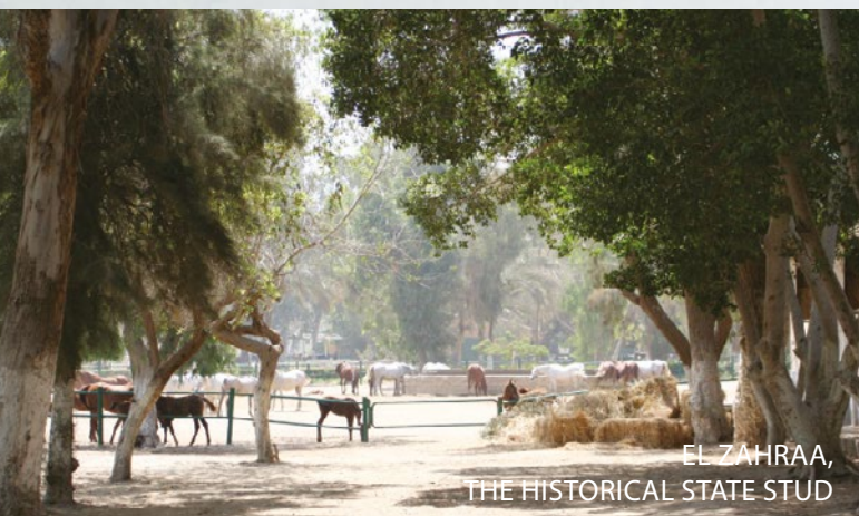
EL ZAHRAA, THE HISTORICAL STATE STUD

At the beginning of the nineteenth century, another chapter has begun in horse breeding with Muhammad Ali Pasha, the founder of Modern Egypt and the Dynasty which ruled Egypt from the beginning of the 19th century until the middle of the 20th century. Muhammad Ali Pasha, knowing well the strength and power of Arabian horses as an important war instrument, decided to build the finest Arabian horse breeding program Egypt had ever experienced. He imported around 1100 Arabians from the best horses of the Arabian Peninsula and stabled them at Shoubra stables. Abbas Pasha, grandson of Muhammad Ali Pasha, followed the same concept of his grandfather and succeeded to make his own collection of finest Arabian horses from the desert of Arabia. His horses were very well kept in palaces and became legendary horses to the