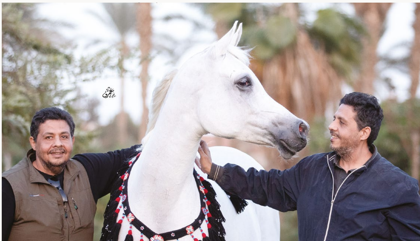
TEE EL GAMIL (Yannah x Tabark Elgabry)

Firstly, preserving the purity of the Egyptian lineage and ensuring its continuity reflects a