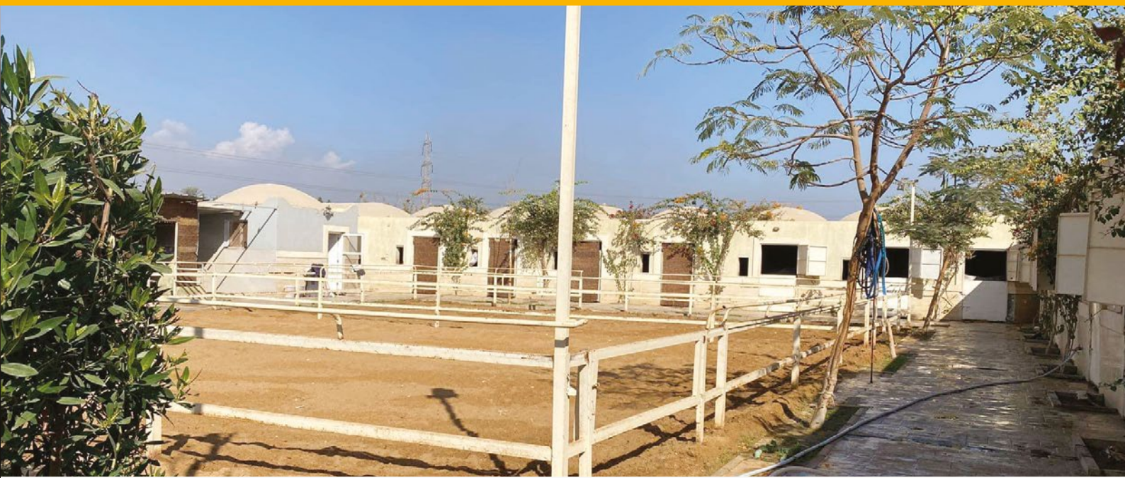
AL HAWADY farm