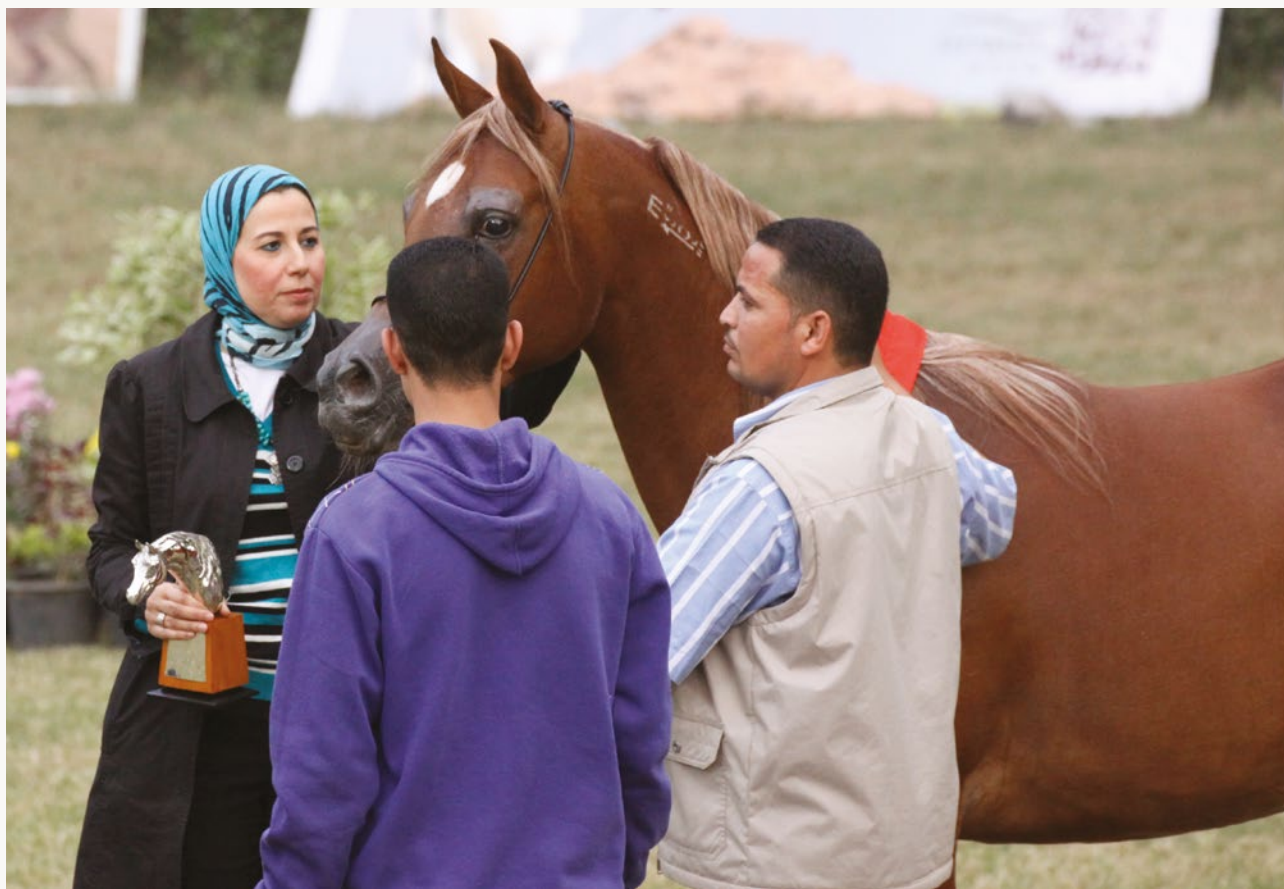
FAYROUZ AL HAMD (Anubis Ra Al Qusar x Belkis Al Hamd), crowned Reserve National Champion at the EAO Show 2010

My goal is to preserve and maintain the natural beauty, type consistency and the overwhelming quality of Straight Egyptian Arabian horses. In any breeding decision,