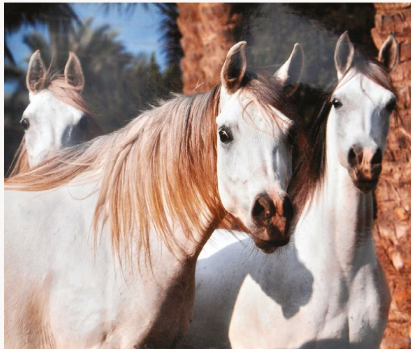
A group of mares at Hamdan Stables