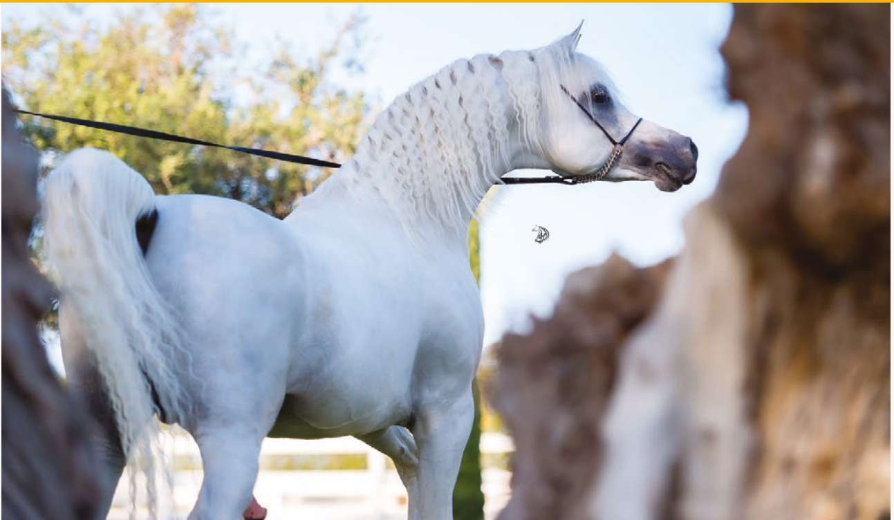
SEIF SAKR (Ansata Marengo x Sara Sakr)