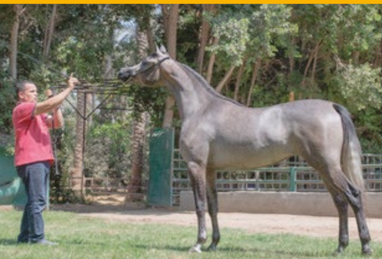
SAFERAT AL HAMD (Sultan Badrawi x HF Emeera Isis)