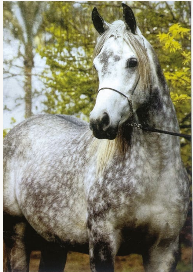
MAGDA ( Ibn Rashid x Manshouda)