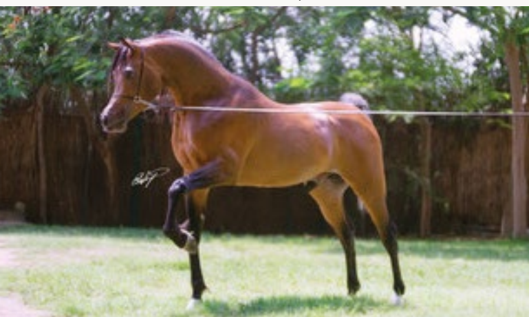
SALMAN AL HAMD, Reserve Champion at Rabab show 2014

then you are on the right track and you will be willing to take more risks.