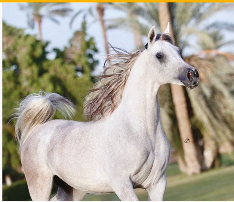
WAAD AL-HAWADY (Ashiek Zeina x Warda Rabab)

proportioned bodies. Consequently, our plan relies on selecting mares that possess these key traits through research and observing their offspring with various stallions, paying attention to the most inherited characteristics. When we find the suitable mare, we purchase her and choose the appropriate stallion to achieve the vision's goals.