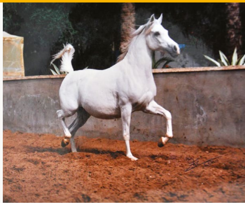
OM EL FETOUH HAMDAN (Fateh EAO x Yosr Hamdan)

It is always very challenging to find good