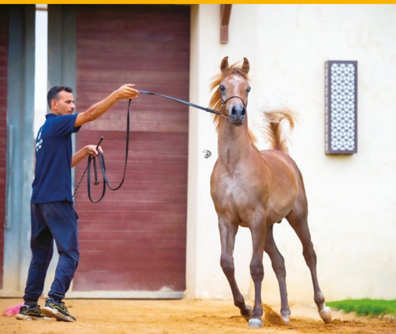
HASSIB DORRA (Seif Sakr x Nadrah Al Rayyan Misr)