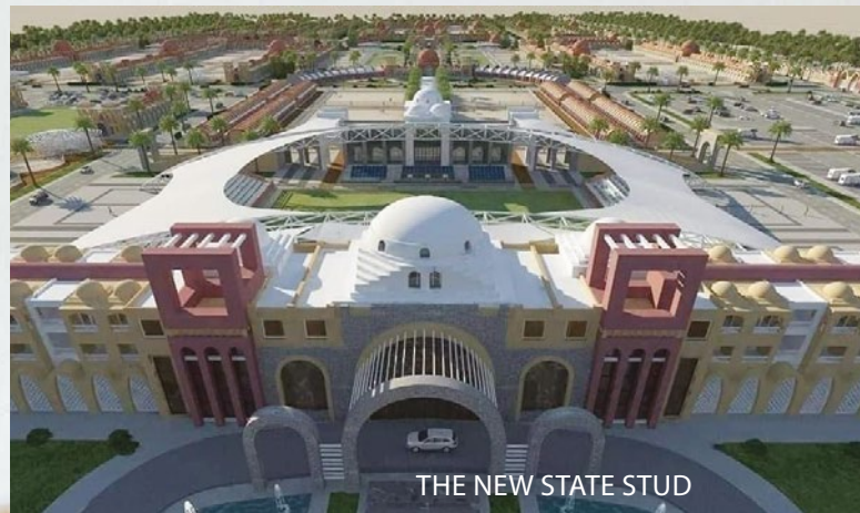
THE NEW STATE STUD