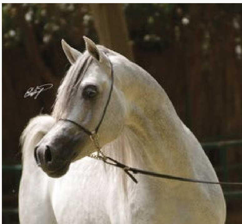
SHAHRAYARAL HAMD (AN Mayrak x HF Emeera Isis)

Do you breed horses mainly for show purpose? How do you select your breeding stallions?