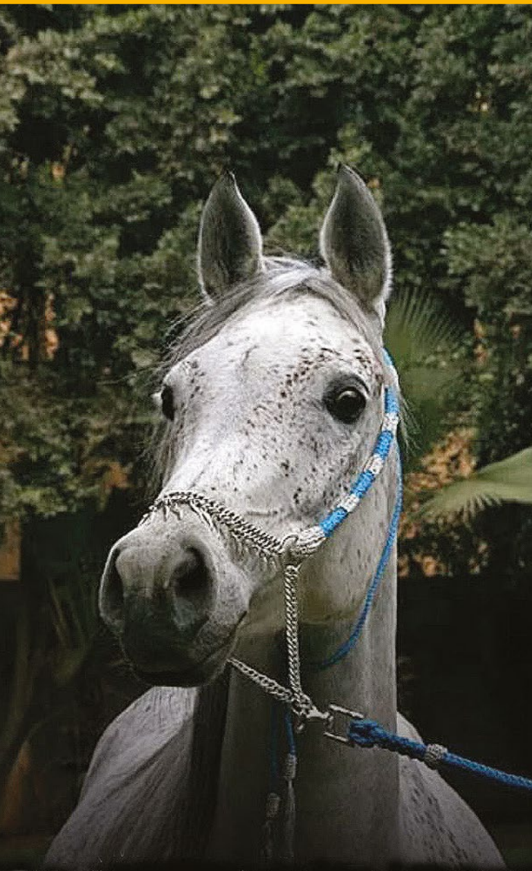
BINDJI (Messaoud x Bukra Bint Salam)