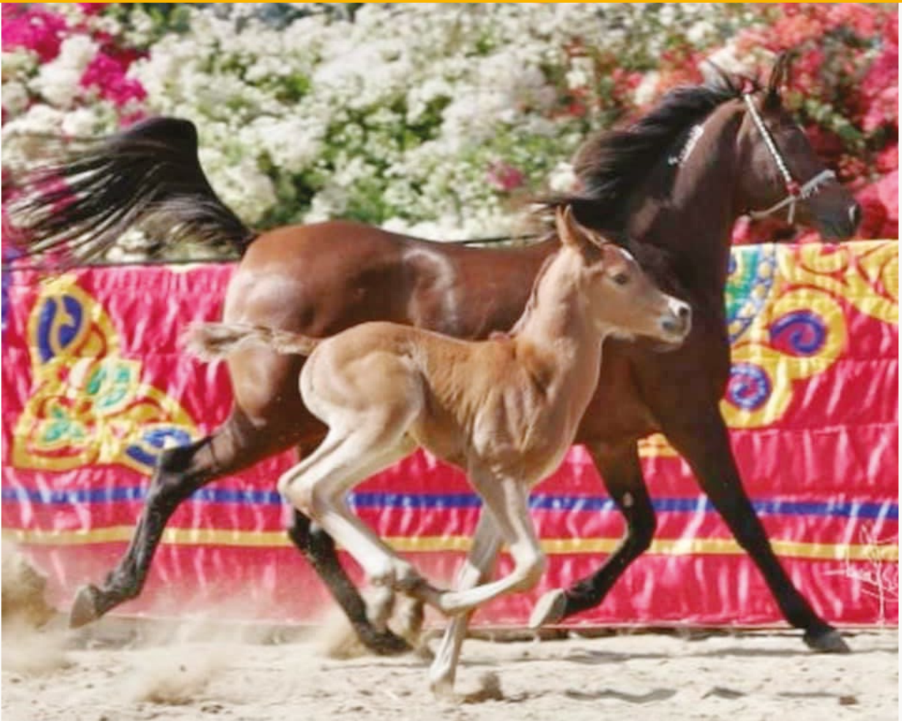
AMAL HAMDAN (Omayr EAO x Alyassoub Hamdan)