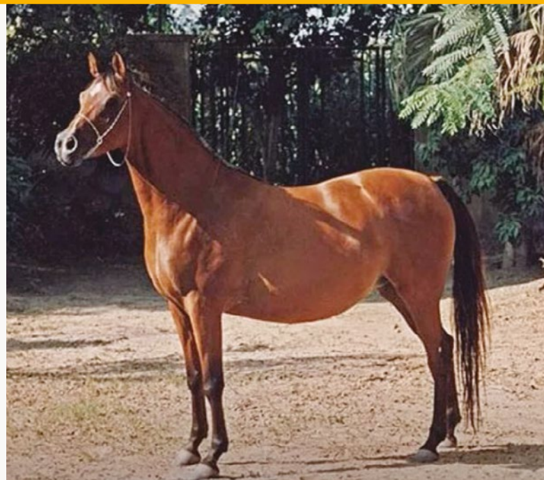
LAHLOUBA (Dorian Shah El Shams x Lolowah)

illness. It can also mean to breed them away from another group of horses as well as it can mean to make some improvements in the bloodlines. Hence, the term preservation can still have a variety of significance but in all cases it implies for sure the necessity to adopt breeding techniques allowing to reassure that the intended herd of horses continue to exist in a healthy and sound manner. Good