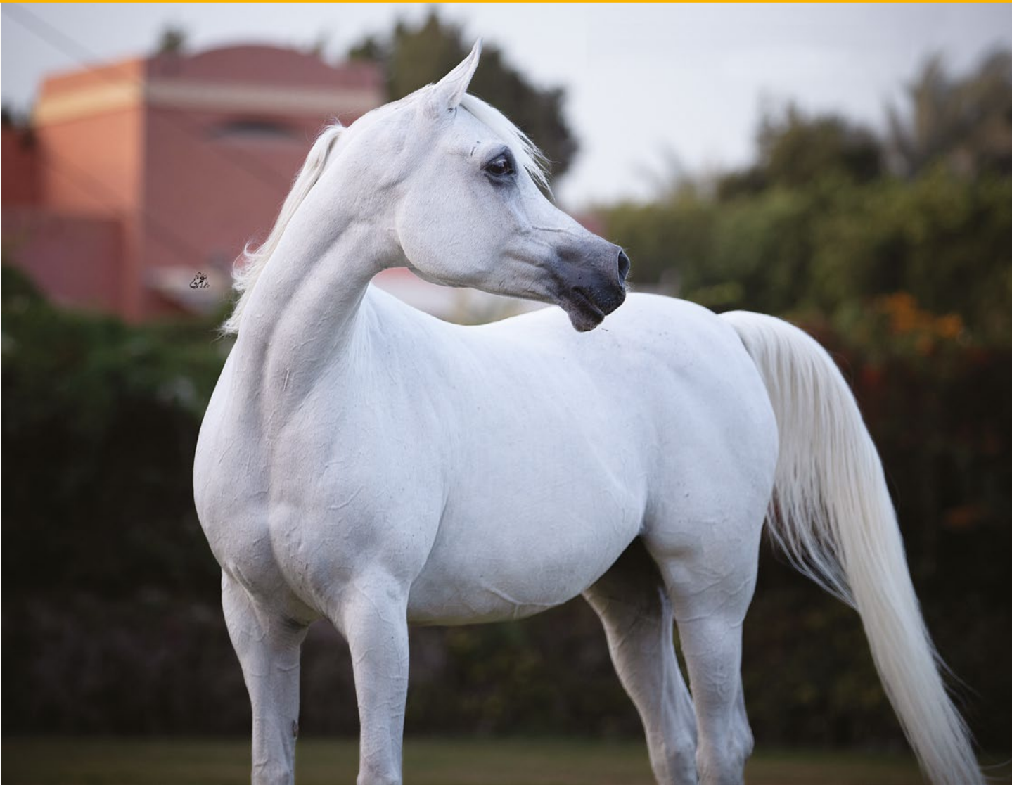
TEE EL GAMIL (Yannah x Tabark Elgabry)

commitment to the heritage of these horses. Secondly, aiming for high-quality Arabian horses with robust bodies and enhancing their aesthetic qualities to compete globally demonstrates a dedication to excellence in international shows.