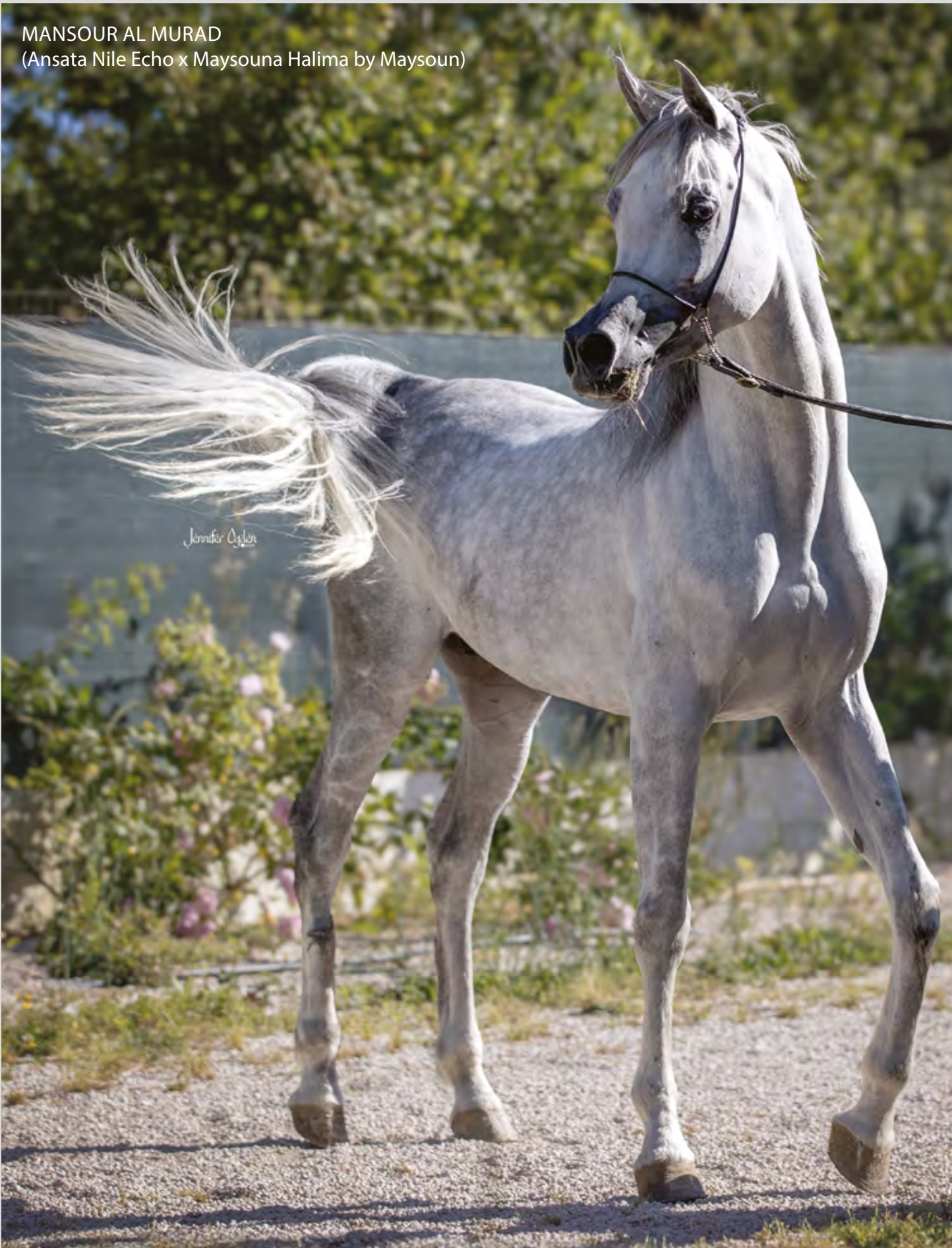
MANSOUR AL MURAD (Ansata Nile Echo x Maysouna Halima by Maysoun)