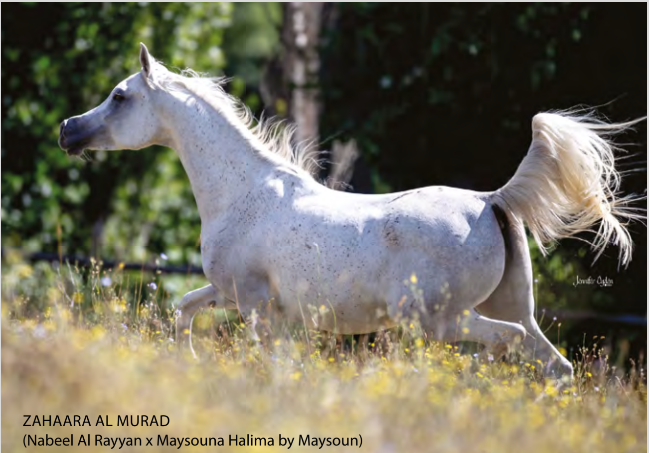
ZAHAARA AL MURAD (Nabeel Al Rayyan x Maysouna Halima by Maysoun)