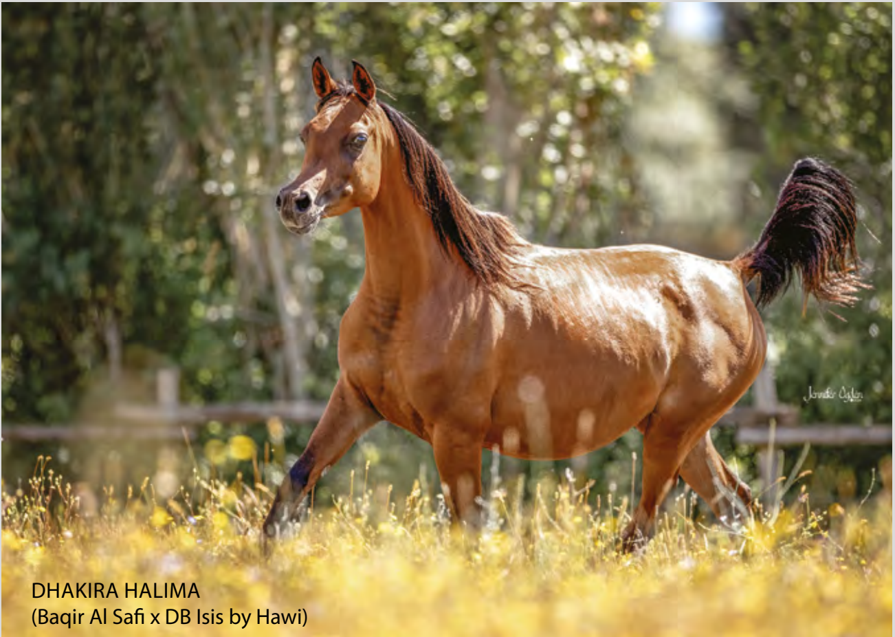
DHAKIRA HALIMA (Baqir Al Safi x DB Isis by Hawi)