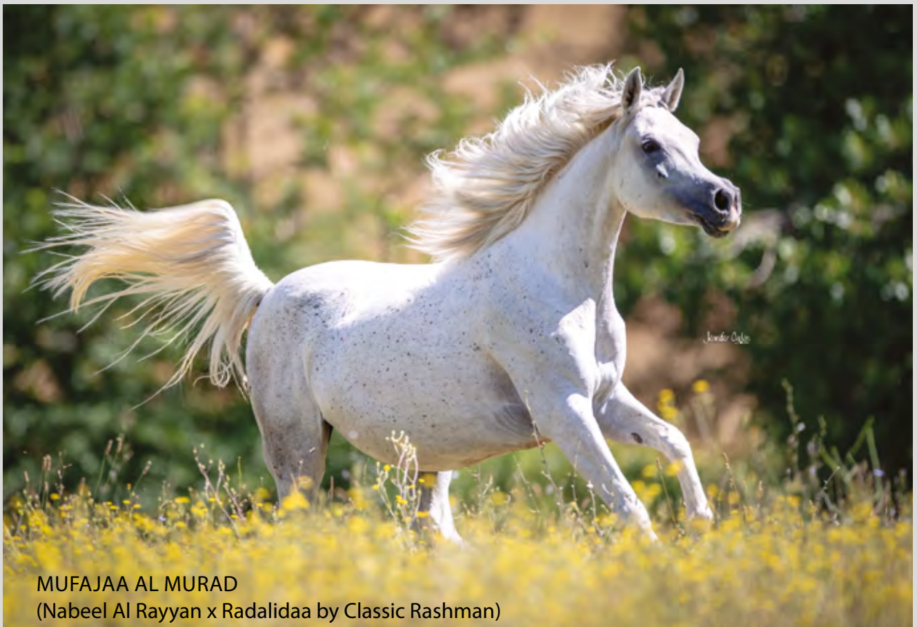
MUFAJAA AL MURAD (Nabeel Al Rayyan x Radalidaa by Classic Rashman)