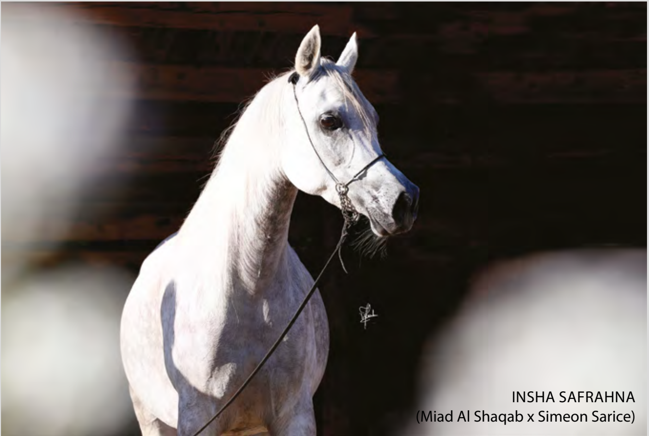
INSHA SAFRAHNA (Miad Al Shaqab x Simeon Sarice)