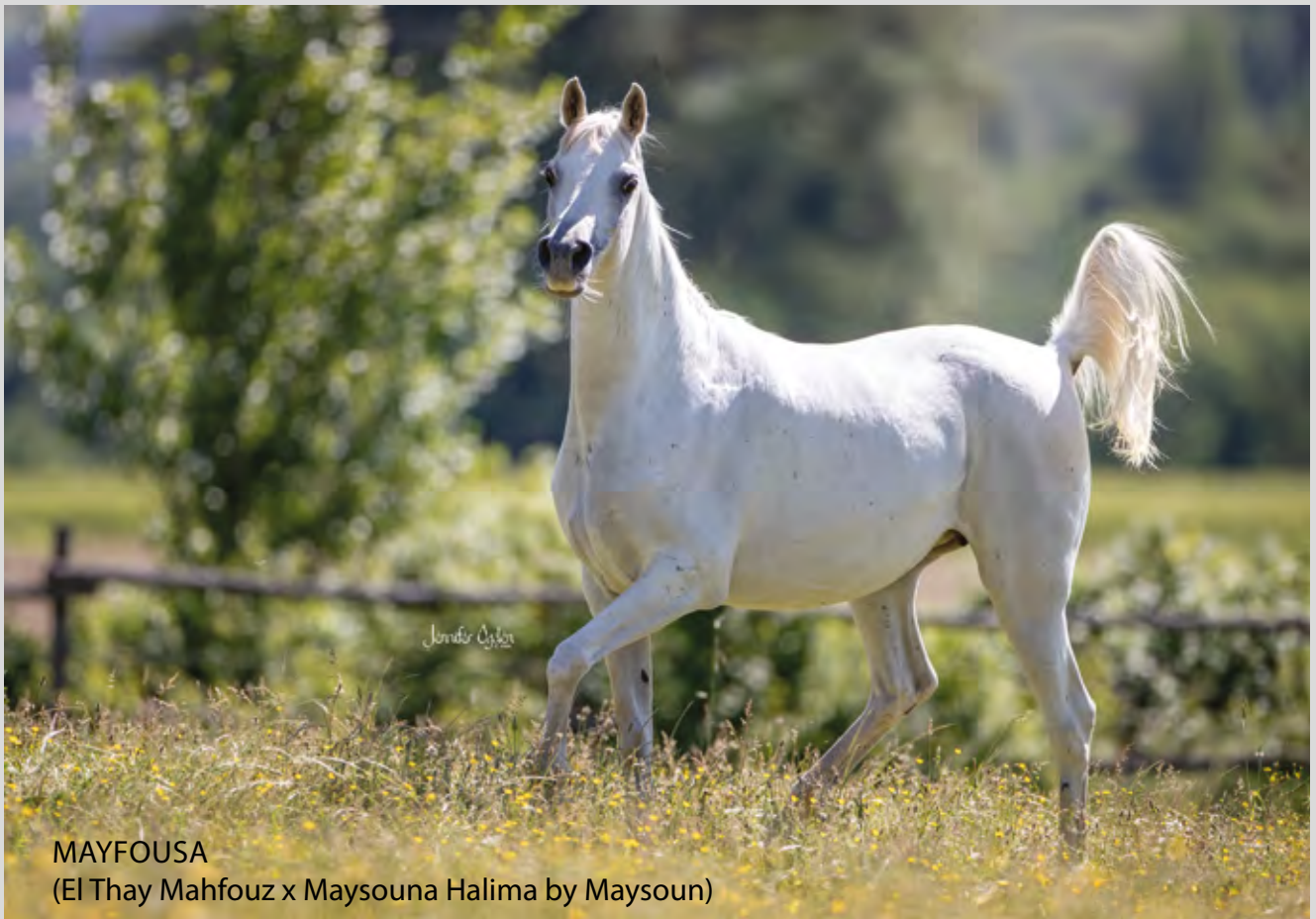
MAYFOUSA (El Thay Mahfouz x Maysouna Halima by Maysoun)